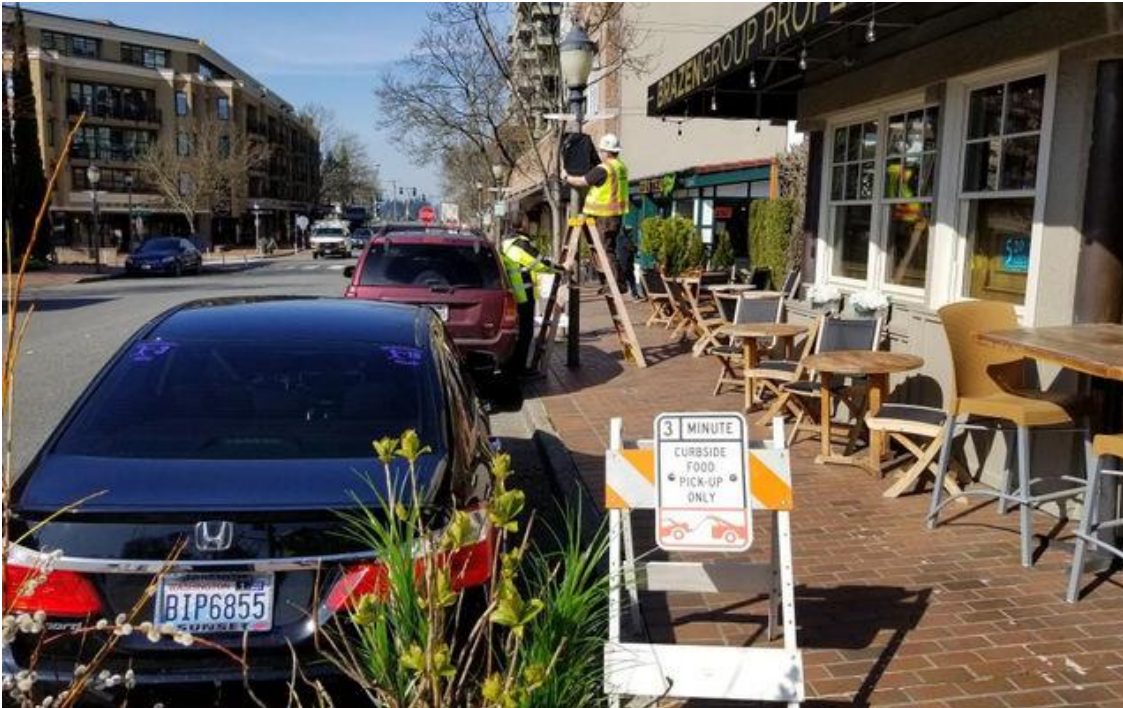
Bellevue Washington