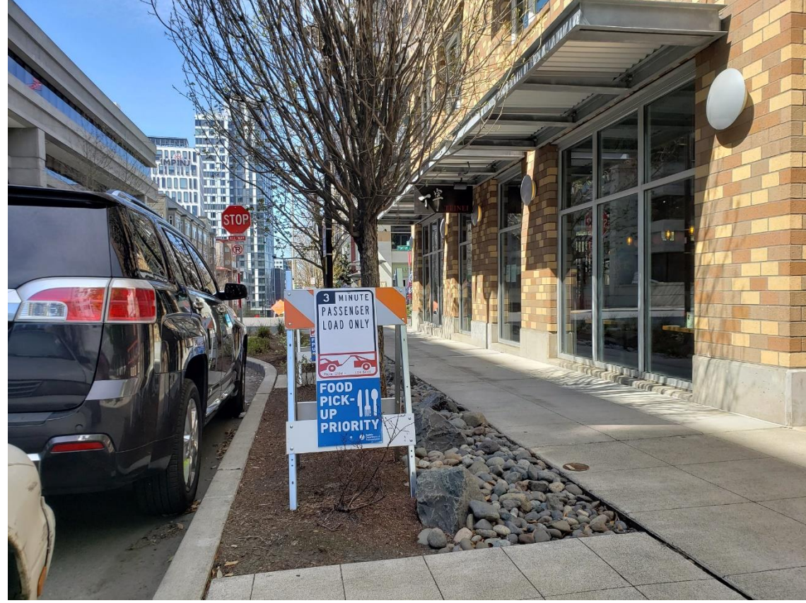
Seattle, Photo Credit NACTO