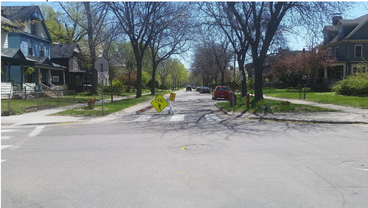
Minneapolis, Photo Credit: NACTO