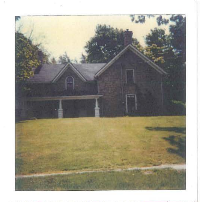
SIDE VIEW OF MILLER'S HOUSE FACING NORTH (WILSON ST.)

The Miller's House 580 Wilson St. E. ANCASTER, Ont.