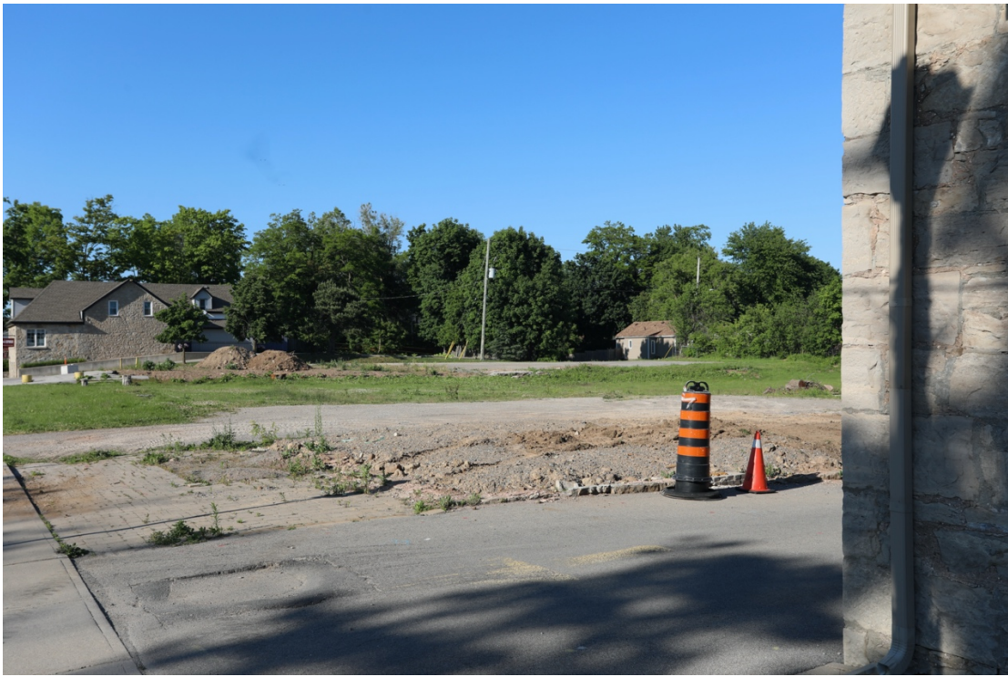
JUST WEST OF BRANDON HOUSE A HUGE EMPTY LOT THANKS TO MULTIPLE DEMOLITIONS