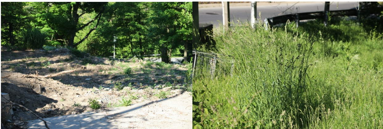
DIRT, WEEDS, RUBBLE--ALL THAT IS LEFT OF A ONCE PROUD HOME