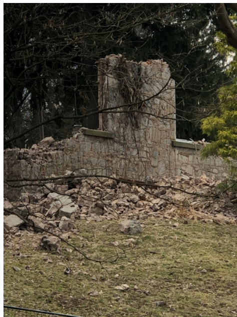
THE CITY DEMOLITION PERMIT WAS ACTED UPON IMMEDIATELY