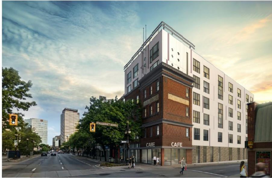
121 / 125 King Street East, Hamilton