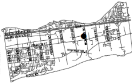
Key Map - Ward 10