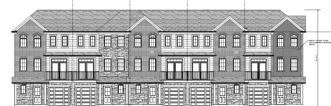
PARTIAL EAST ELEVATION