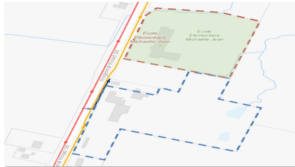
Wastewater Servicing Map