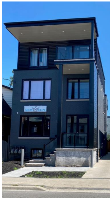
144 Wellington Street North (After)