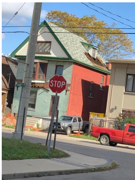
144 Wellington Street North (Before)

As construction projects move forward, it is sometimes necessary to amend previously approved Grant Agreements and any ancillary documentation. Therefore, staff recommends that the General Manager of Planning and Economic Development be authorized to amend Grant Agreements and any ancillary documentation, provided that the terms and conditions of the HTIGP are maintained.