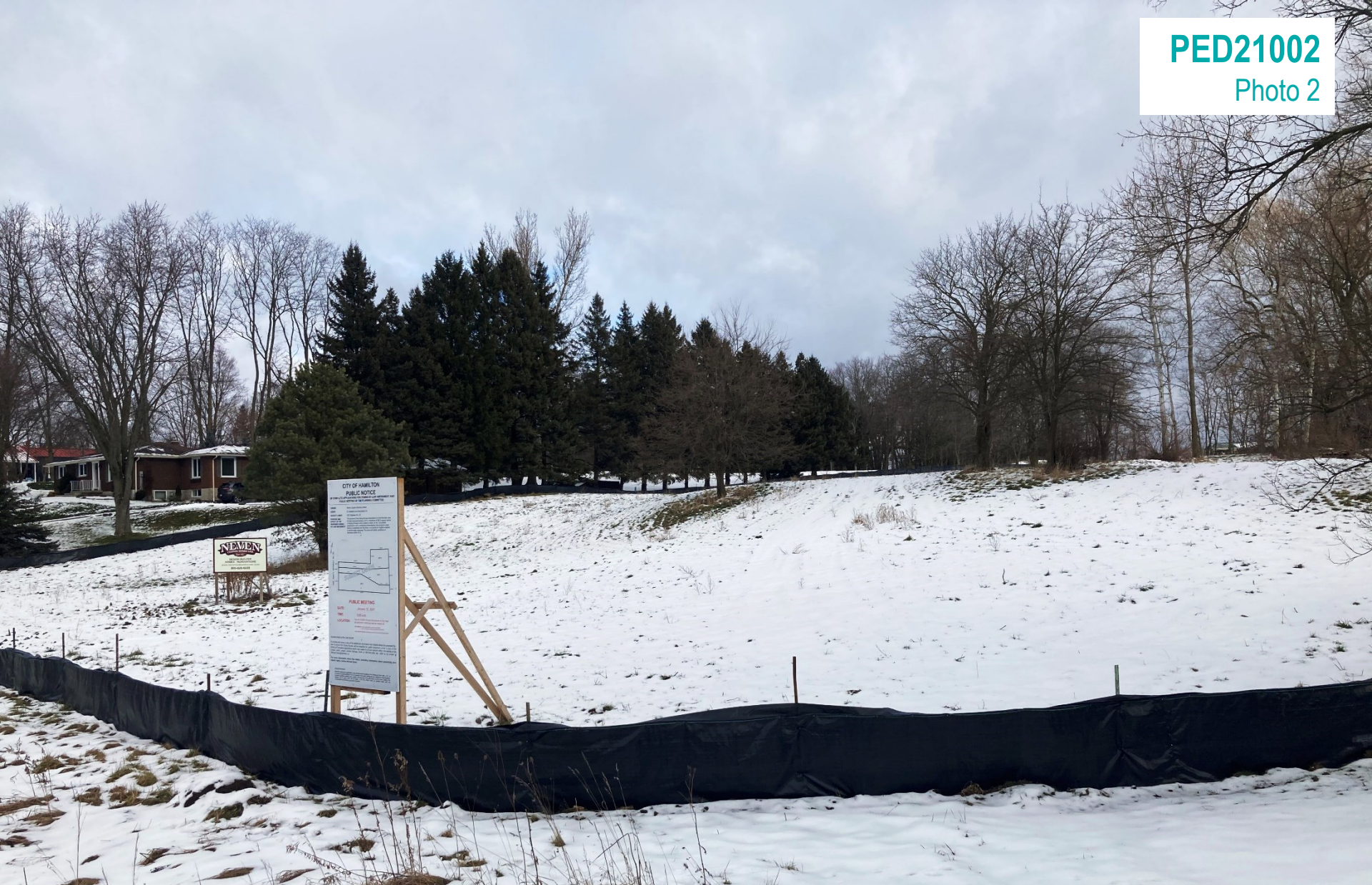
Looking northeast from site entrance along Highway 52 North