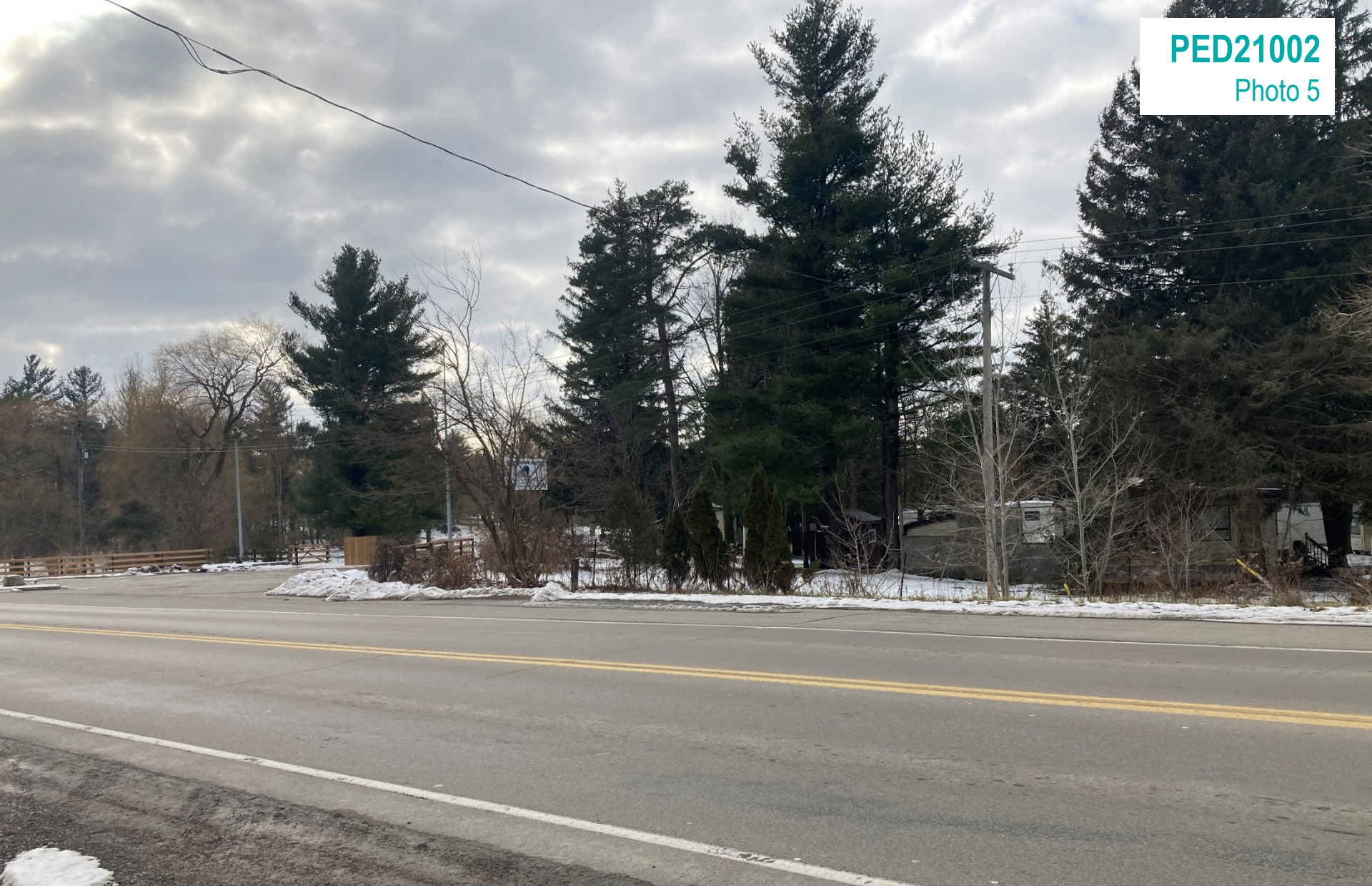
Looking west toward Eagle Worldwide Retreat Centre from Highway 52 North