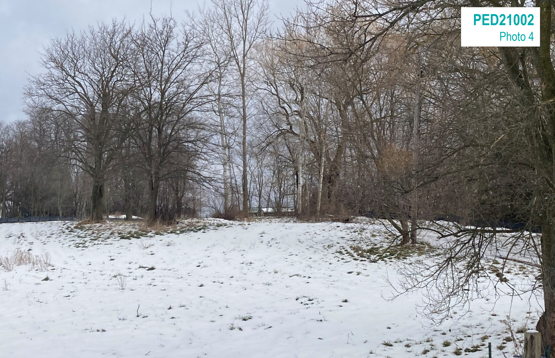
Rear of site looking east from site entrance