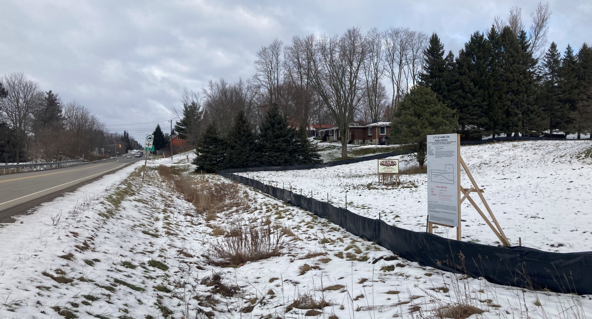
Looking north towards Copetown from site entrance