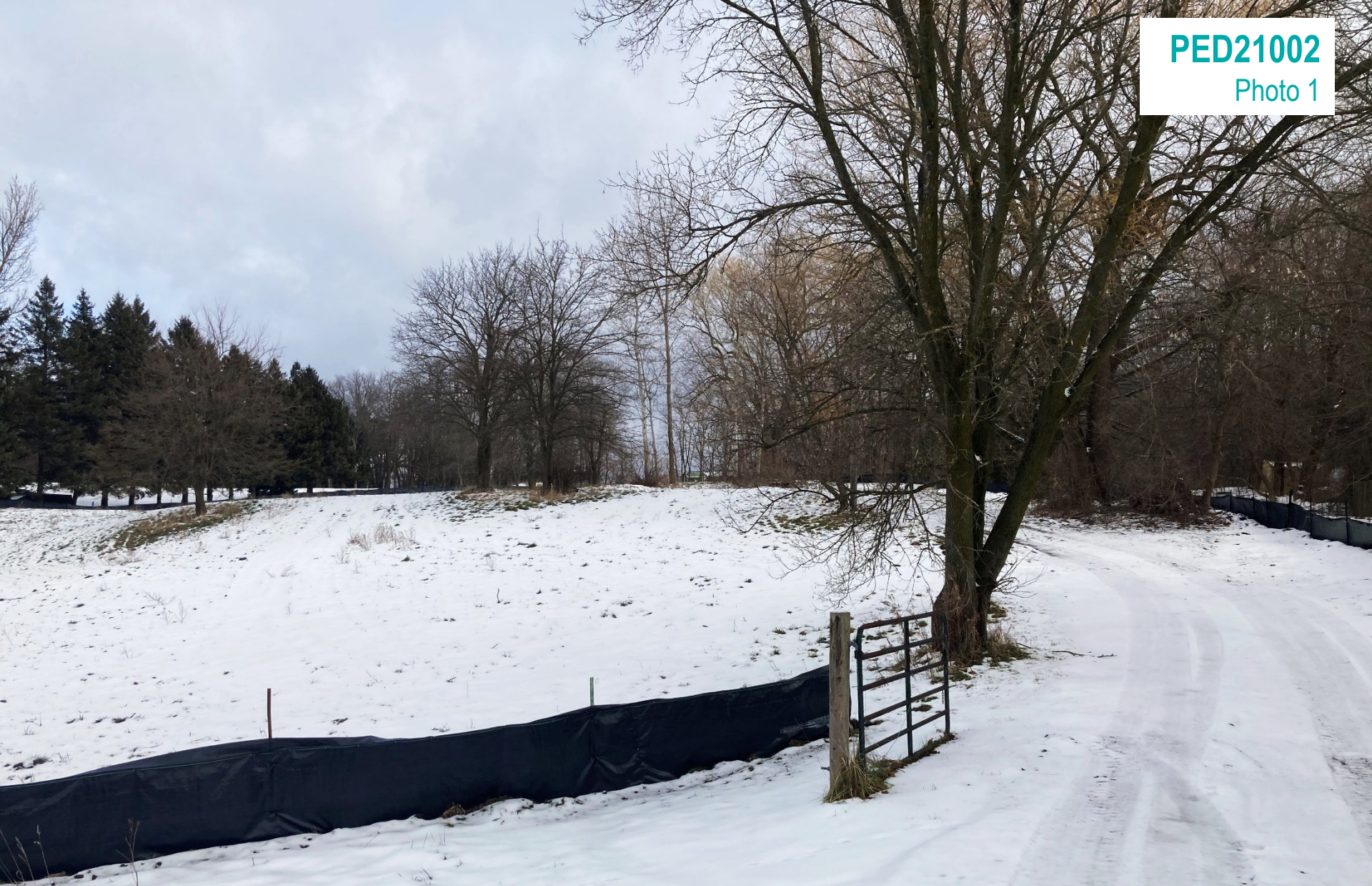
Looking east from site entrance along Highway 52 North