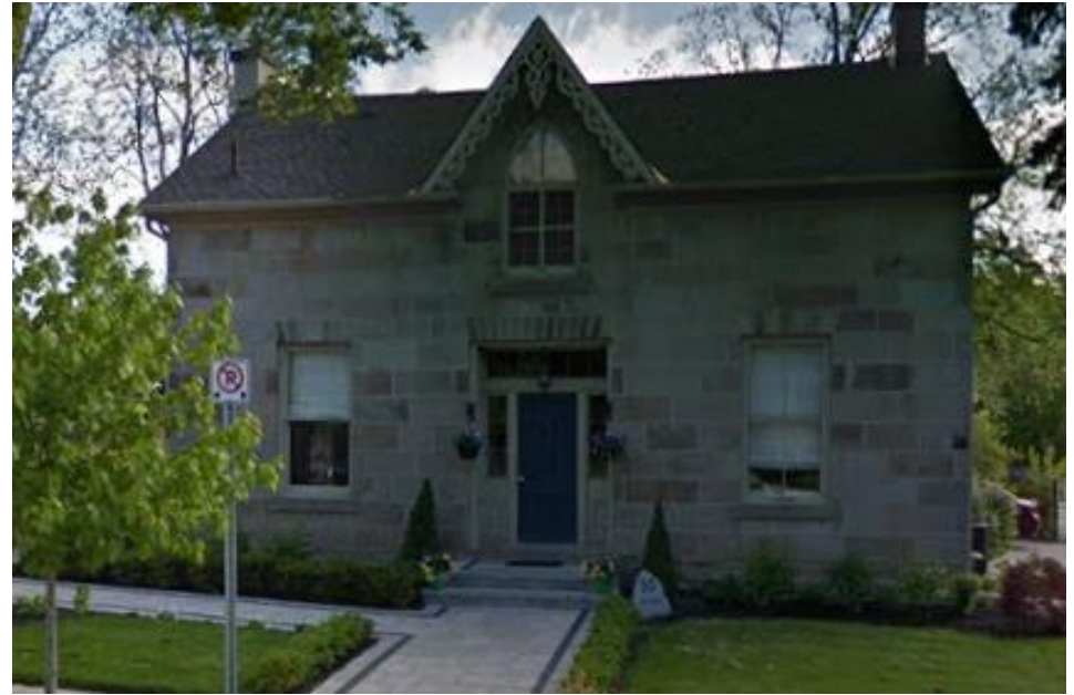
50 Mill St North, Waterdown