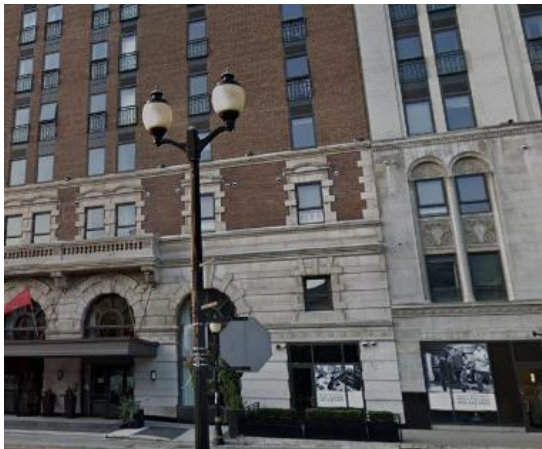
110-122 King St E, Hamilton