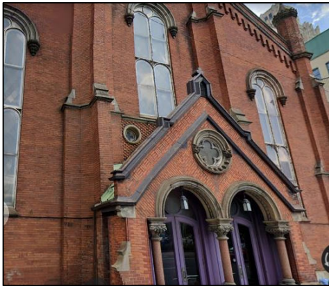
24 Main St W, Hamilton