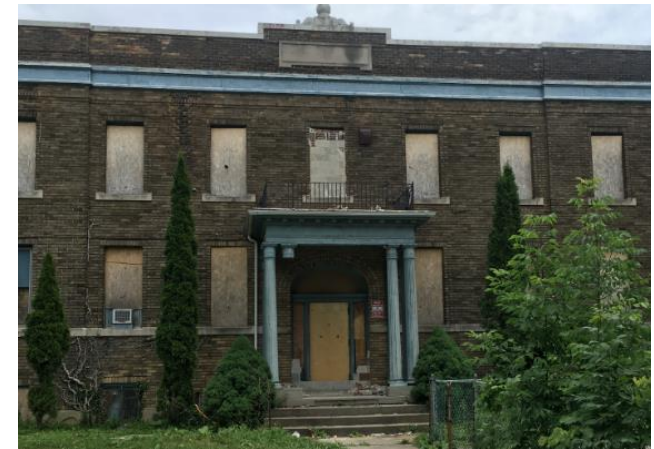
828 Sanatorium Rd, Hamilton