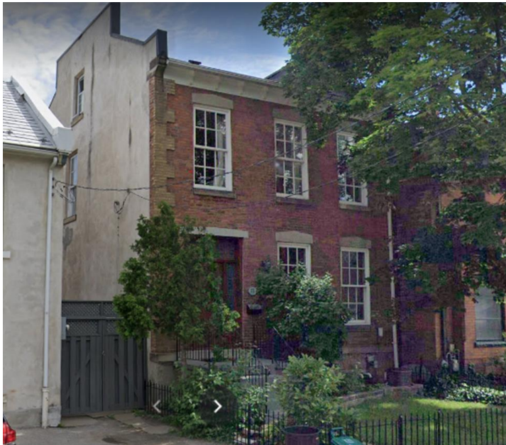
171 Forest Ave, Hamilton