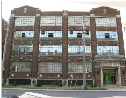
127 Hughson St N, Hamilton