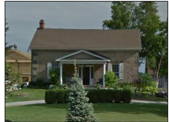
1021 Garner Rd E, Ancaster