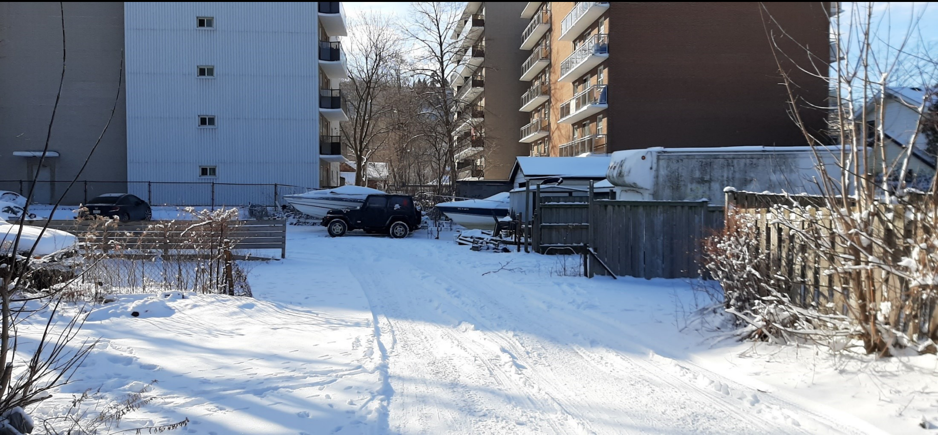
Right-of-Way between Subject Lands and Public Alley