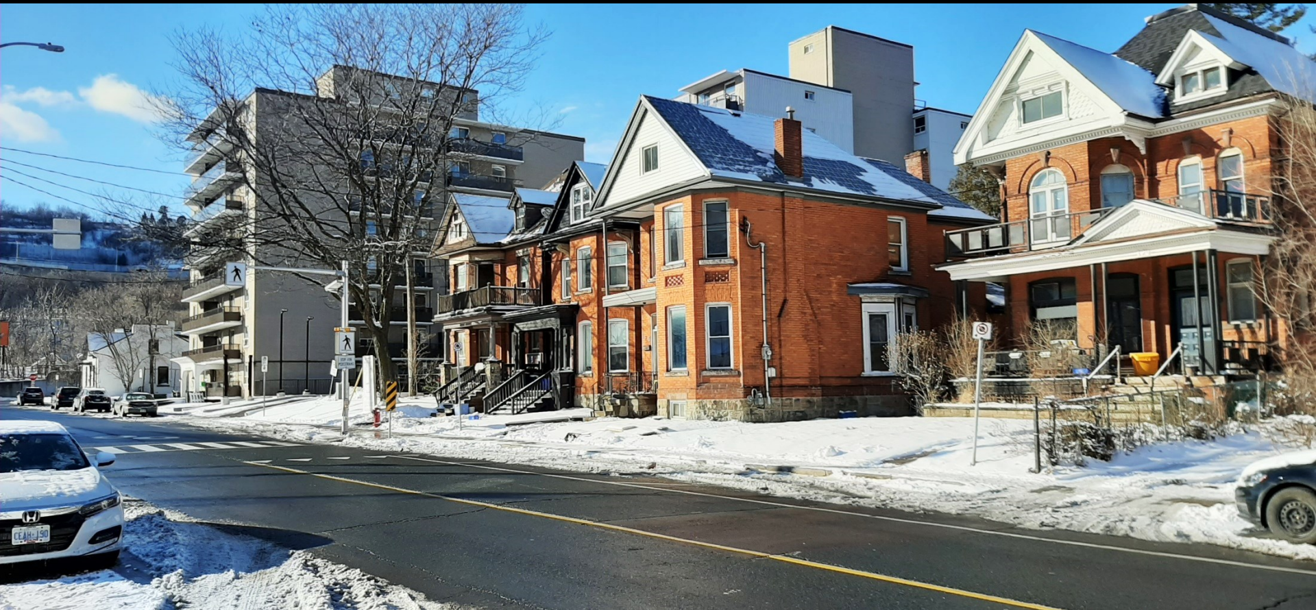
Looking south on Wellington Street South