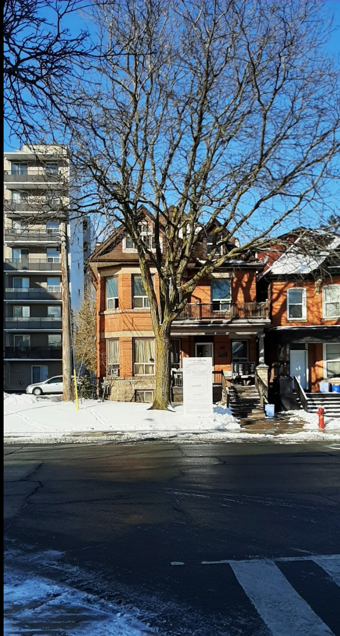
Subject Lands from Stinson Street and Wellington Street South