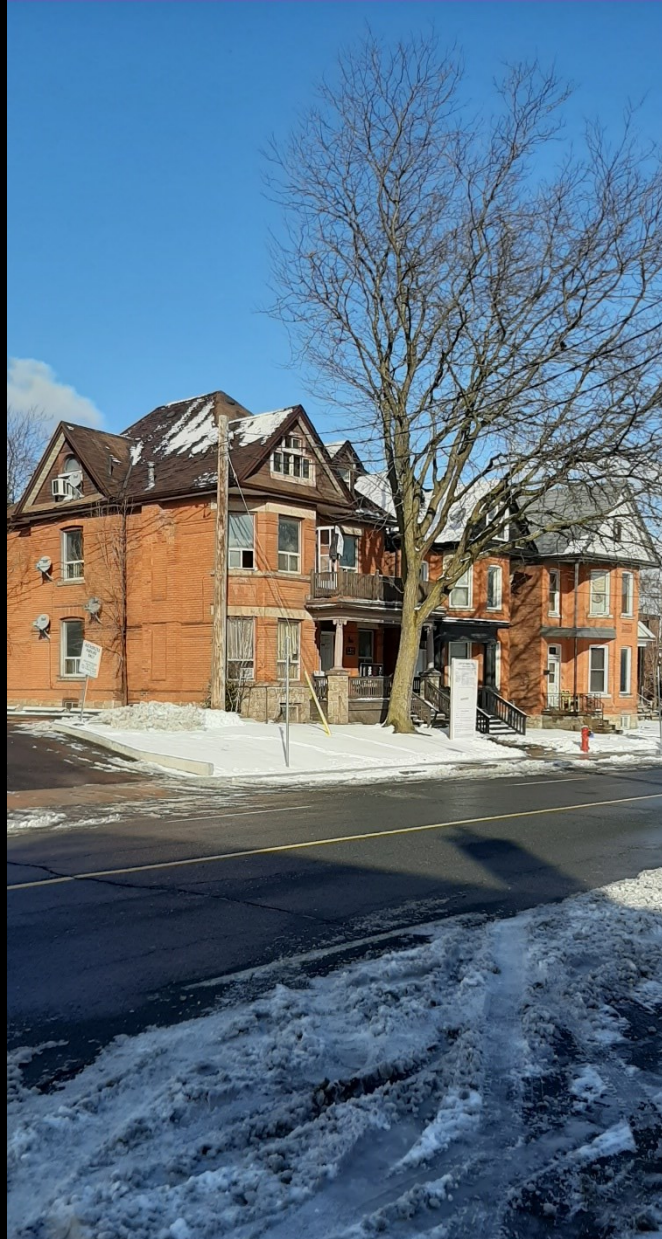
Looking north on Wellington Street South