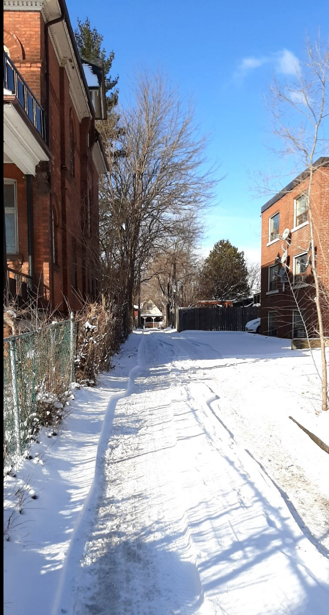
Public Alley between Wellington Street South and Ford Street