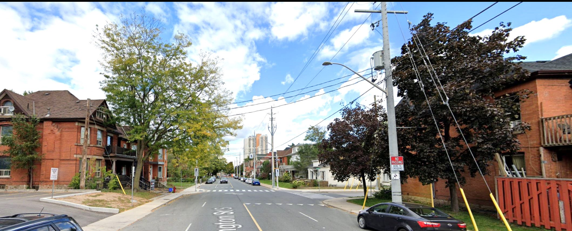
Wellington Street South looking north