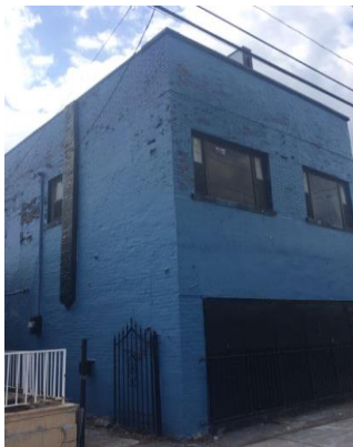
Pre-Renovation: 486 Barton Street East, Hamilton

The planned use of the property is permitted.