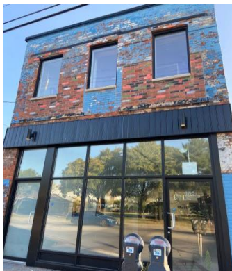
Post Renovation: 486 Barton Street East, Hamilton