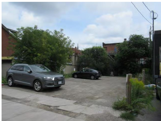
Pre-Redevelopment status of property-29 Severn Street, Hamilton

Upon completion of the redevelopment and reassessment of the property by the Municipal Property Assessment Corporation (MPAC), staff will report back in an Information Update to Council on the actual redevelopment costs, the reassessment amount determined by MPAC and the grant amount.