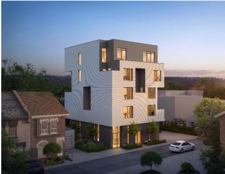
Rendering of Project-29 Severn Street, Hamilton