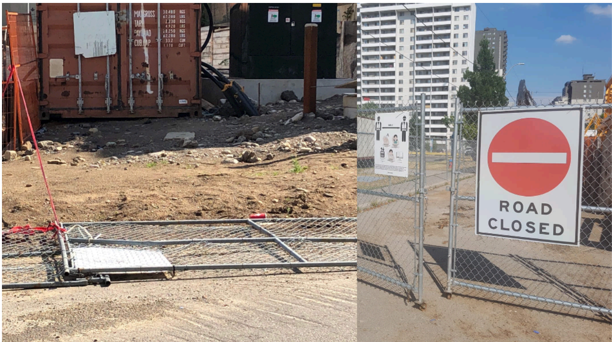
Gates to the dangerous construction site have been repeatedly left open or left unrepaired on weekends.