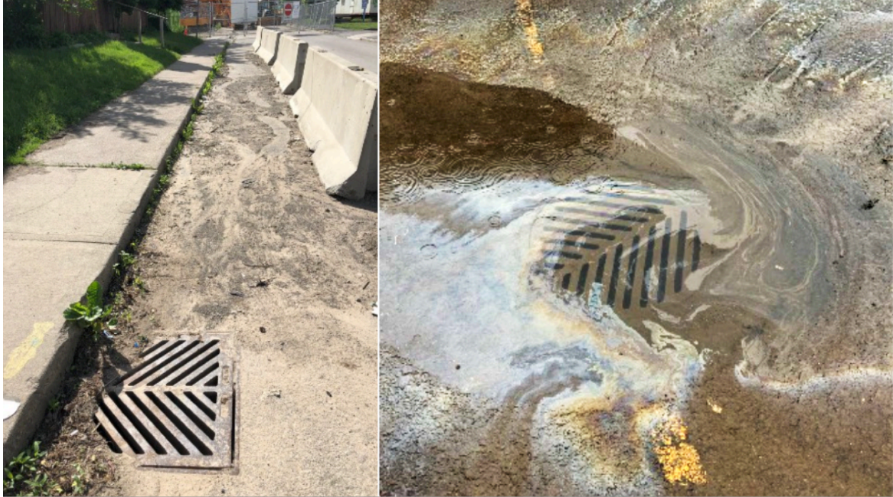
Our water and sewer systems have been contaminated by oil spills and sloppy soil and silt management by the developer.