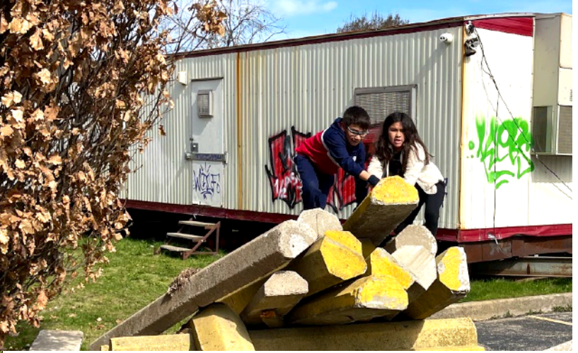
The Vancor-owned open parking lot beside the construction site has been used as an unprotected job site and dumping ground which children have discovered is a great playground.