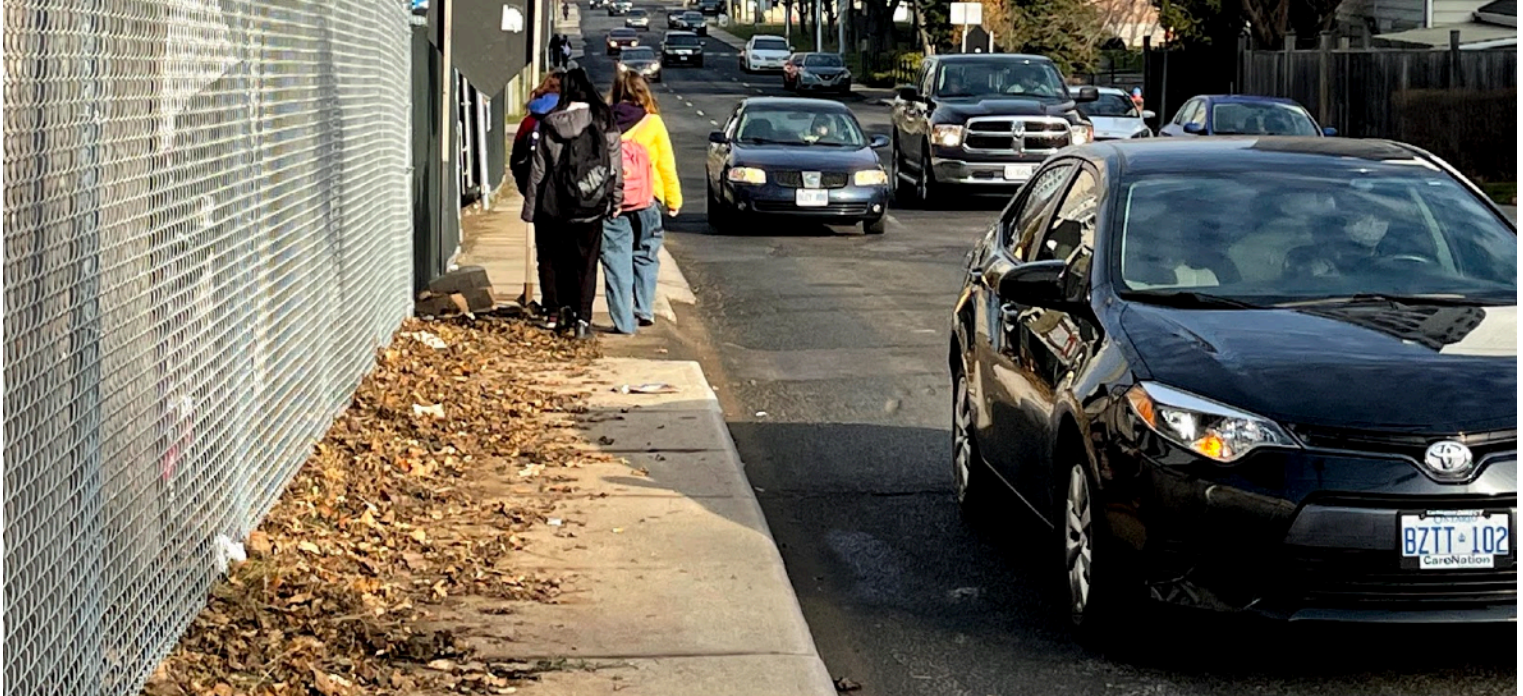
Market and Queen Sts. have been repeatedly blocked and narrowed by debris, loose fence curtains and thoughtlessly.