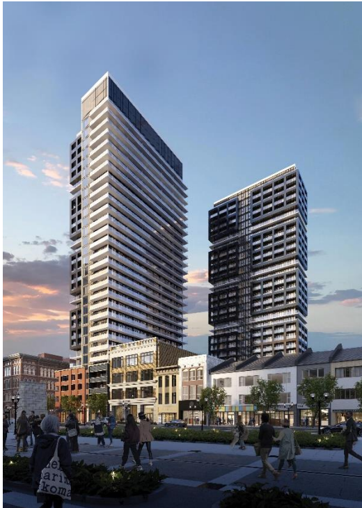
60 King William Street and 43-51 King Street East, Hamilton