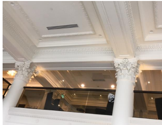
North façade of the 1931 building (left); interior lobby (right)