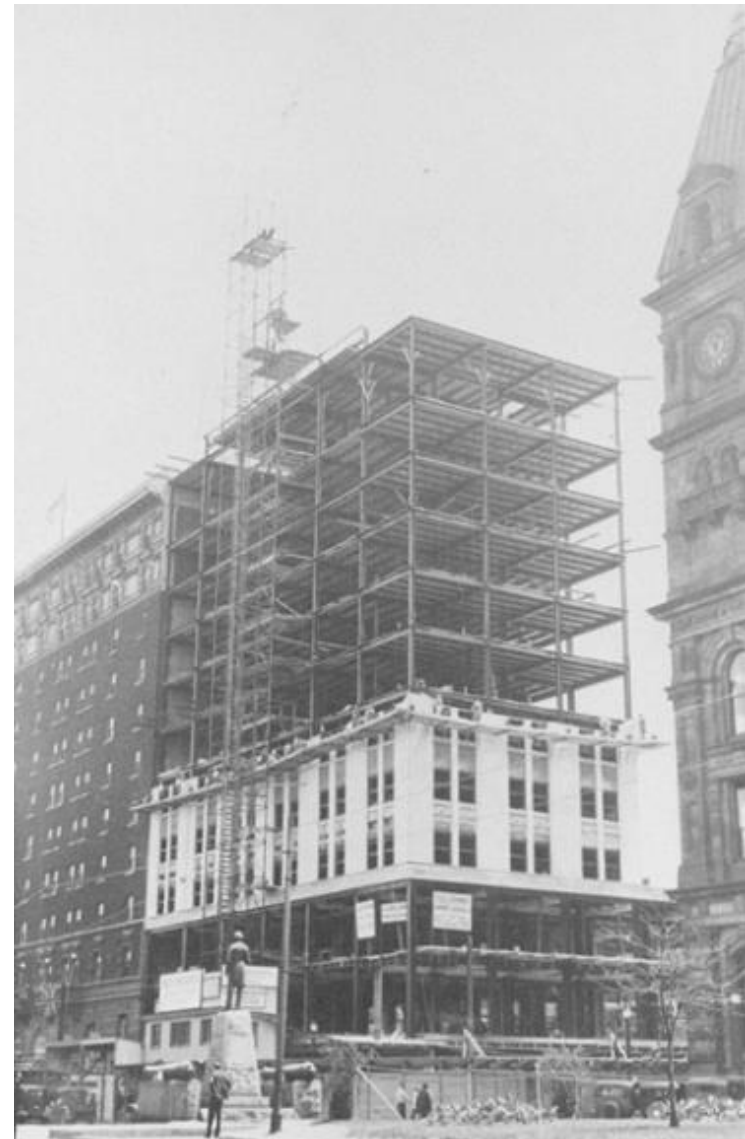
Left: 1914-16 building steel frame under construction; Right: 1931 building under construction.