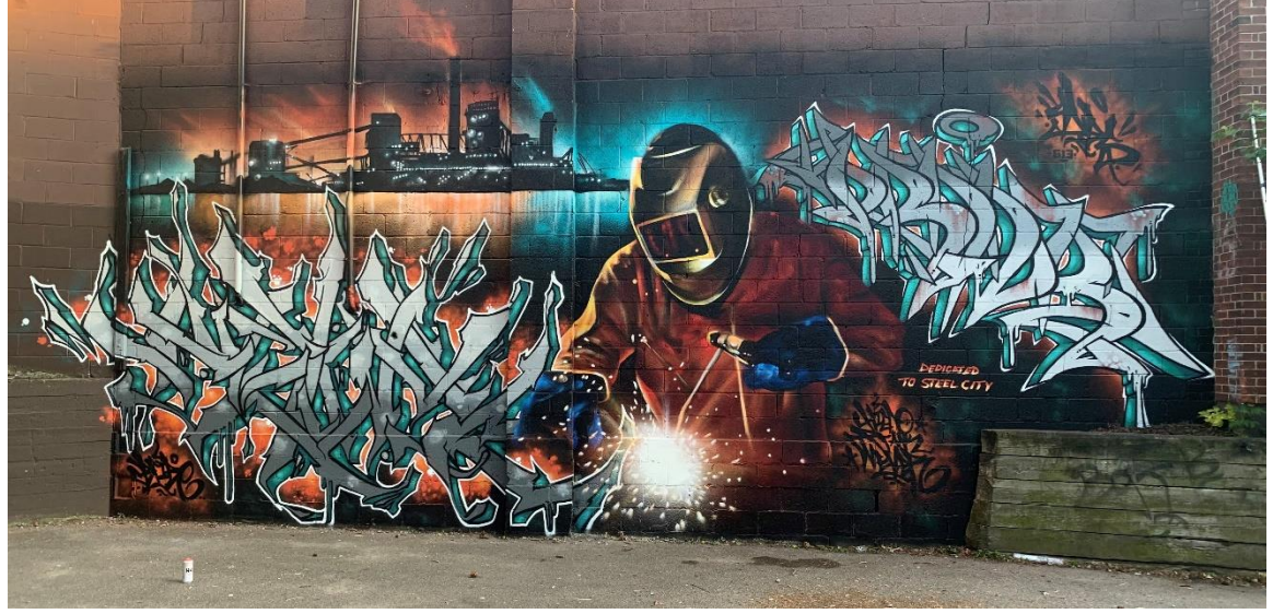
(@prank_DBS @thehigherups @high.dynamics)