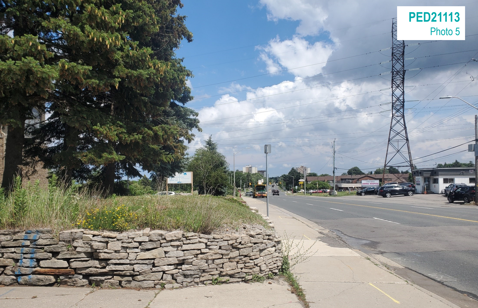
Subject Property Looking East Towards Upper Horning