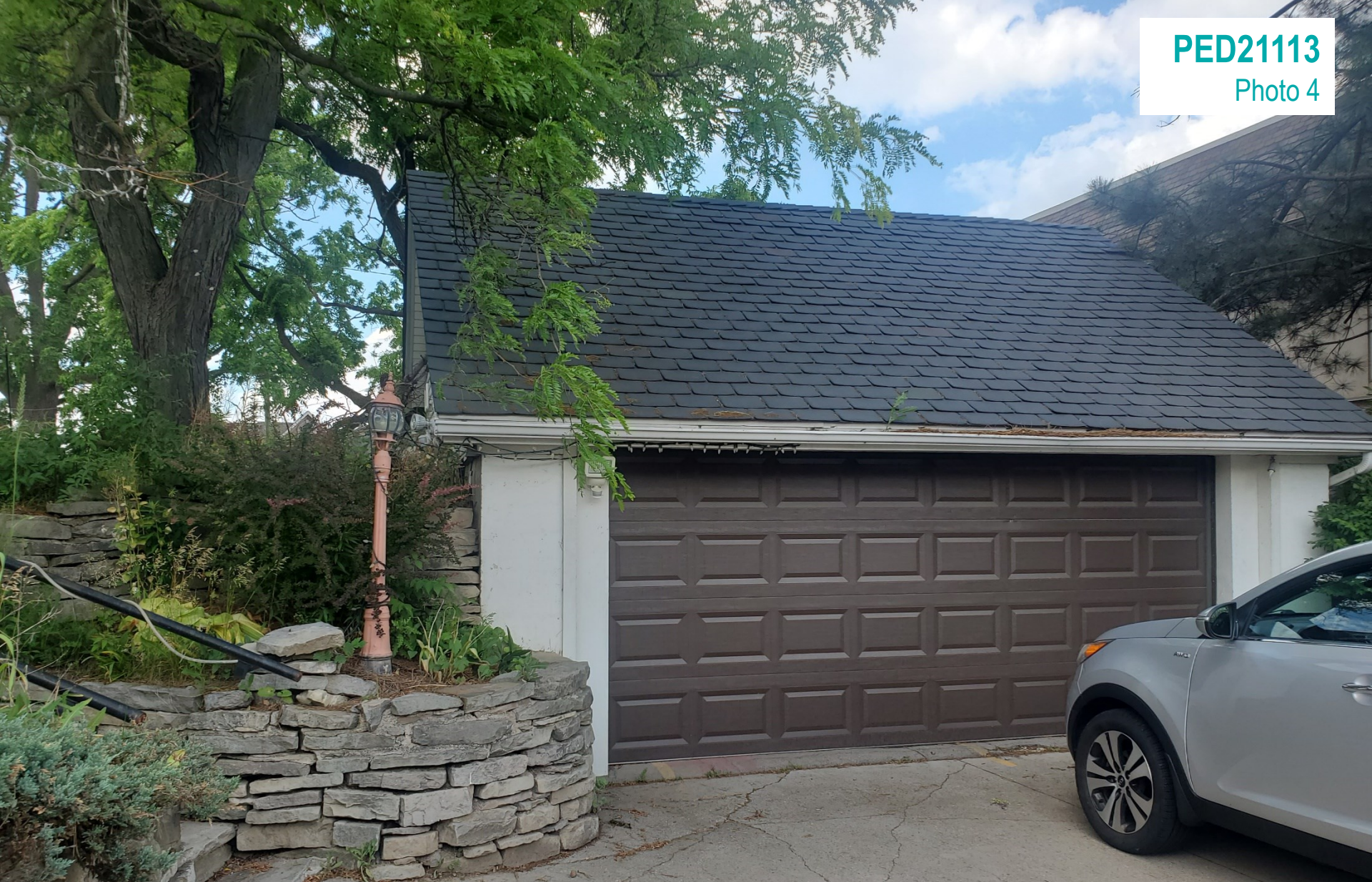
Accessory Structure (garage) To be Demolished