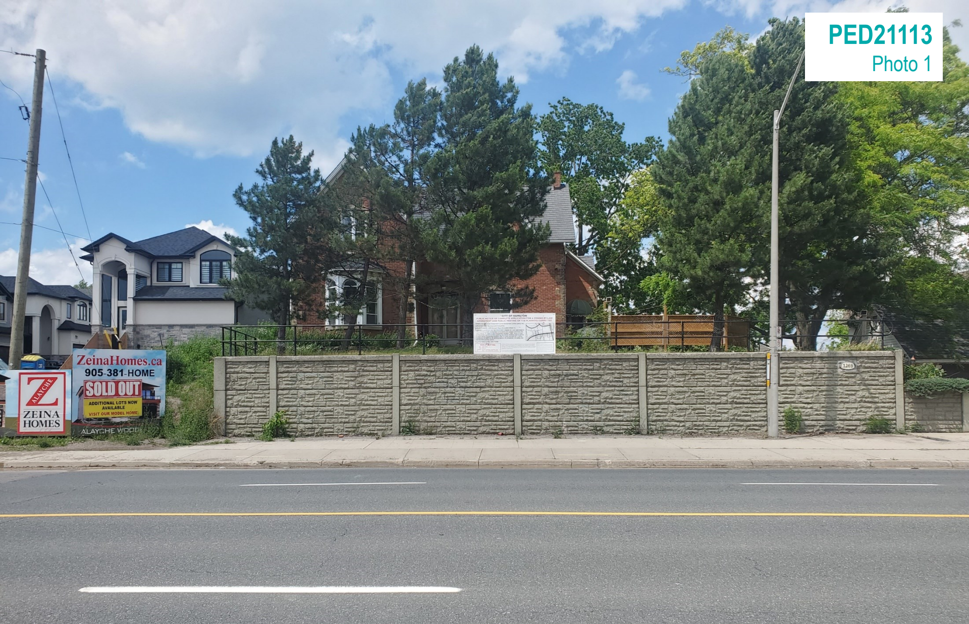
Subject Property Looking North