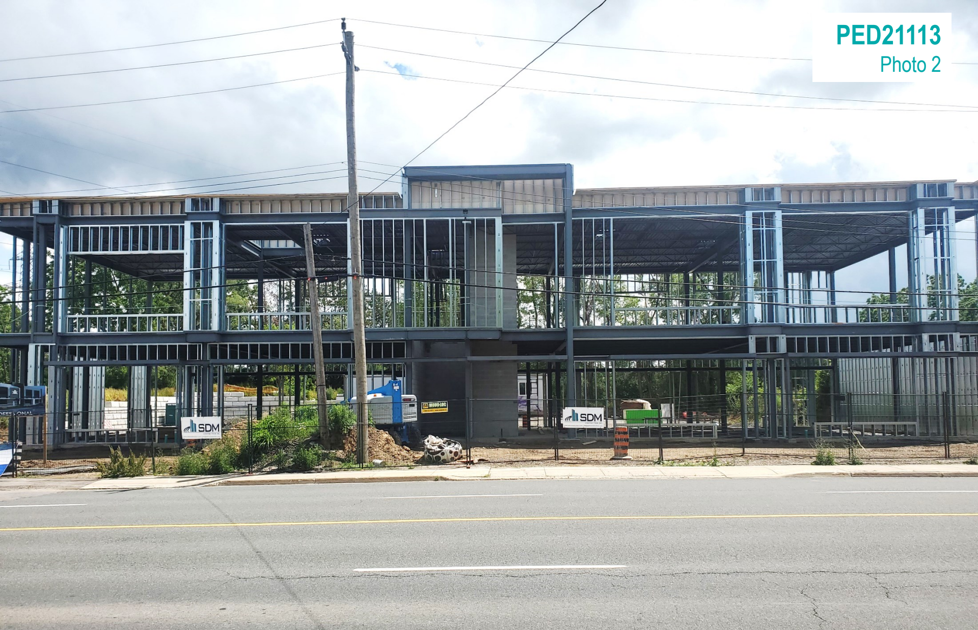
Looking South of Subject Property (across Mohawk Road)