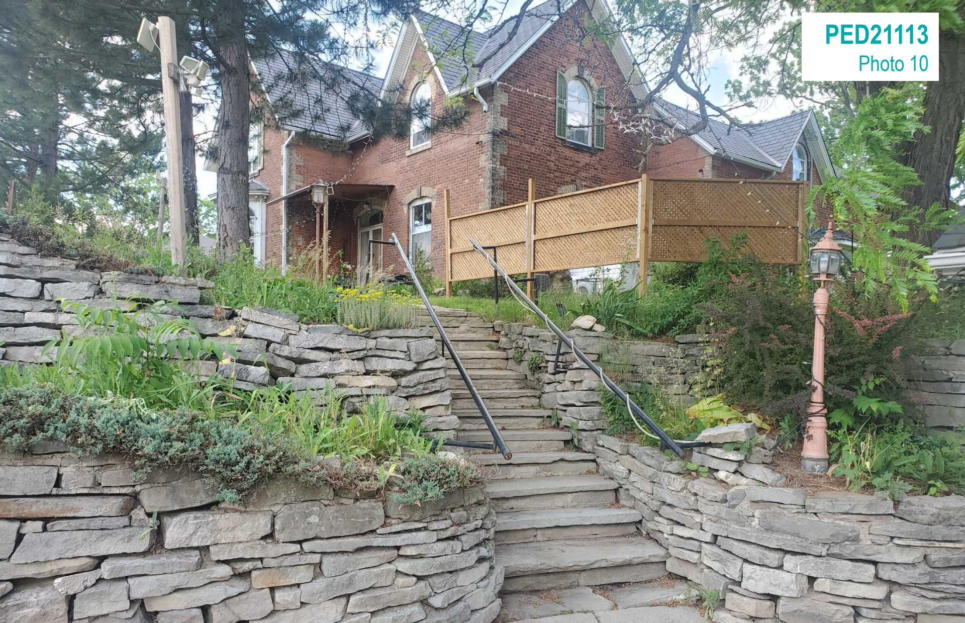
Front of Heritage Home with Existing Steps Built into Slope