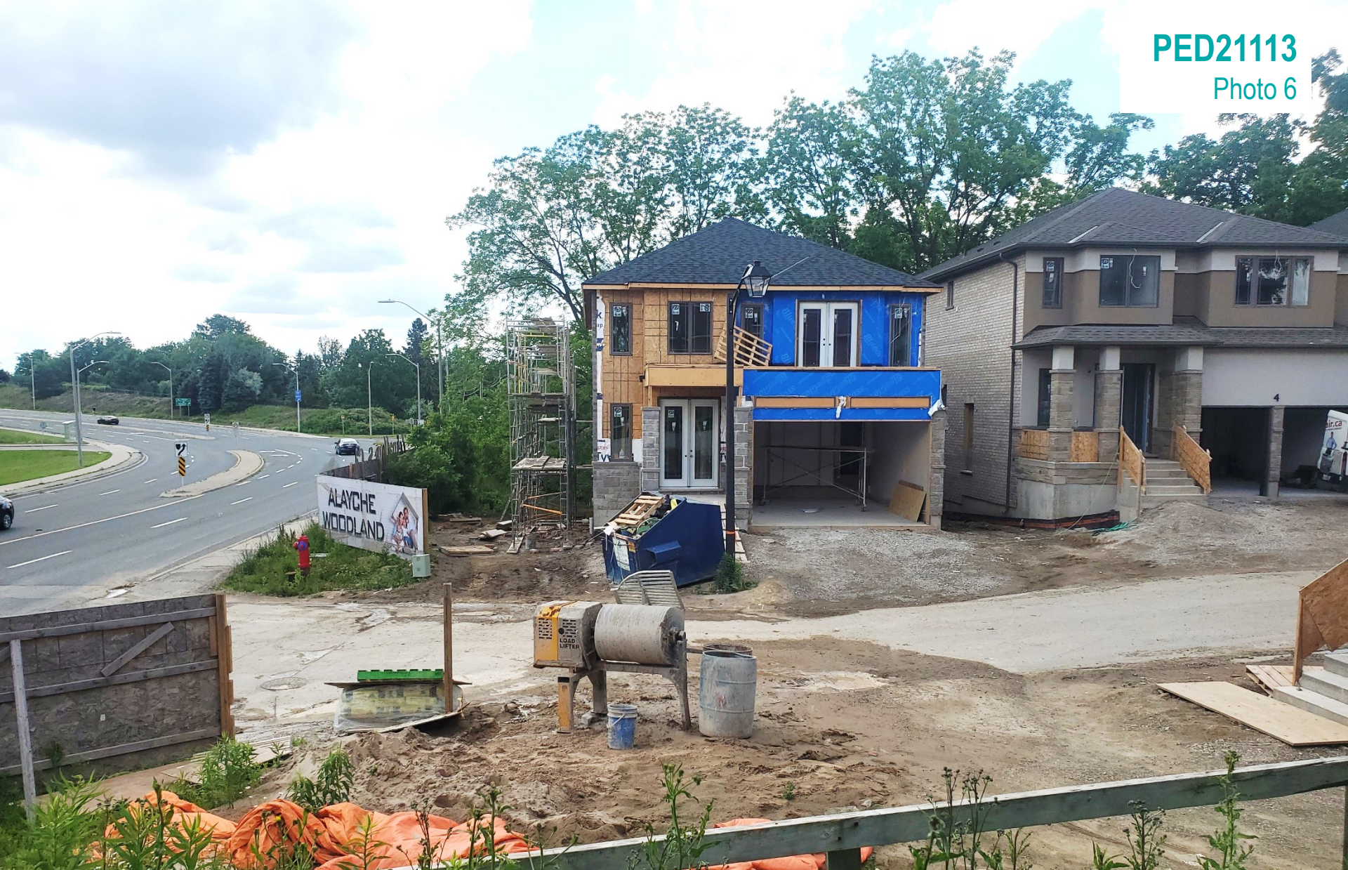
Looking West of Subject Property Towards the Linc