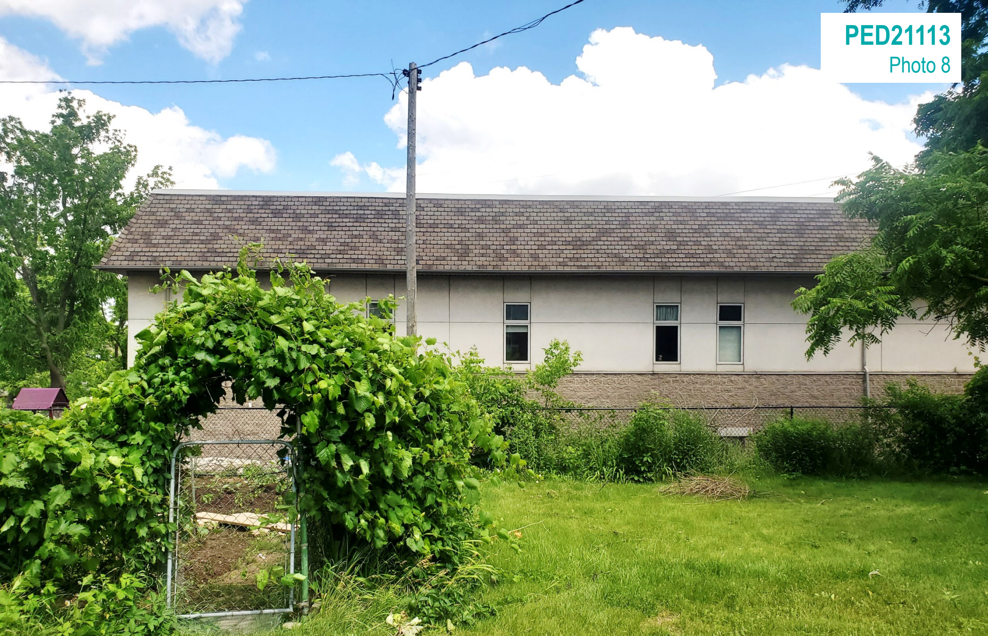
East Side Yard of Subject Property (Commercial Building)