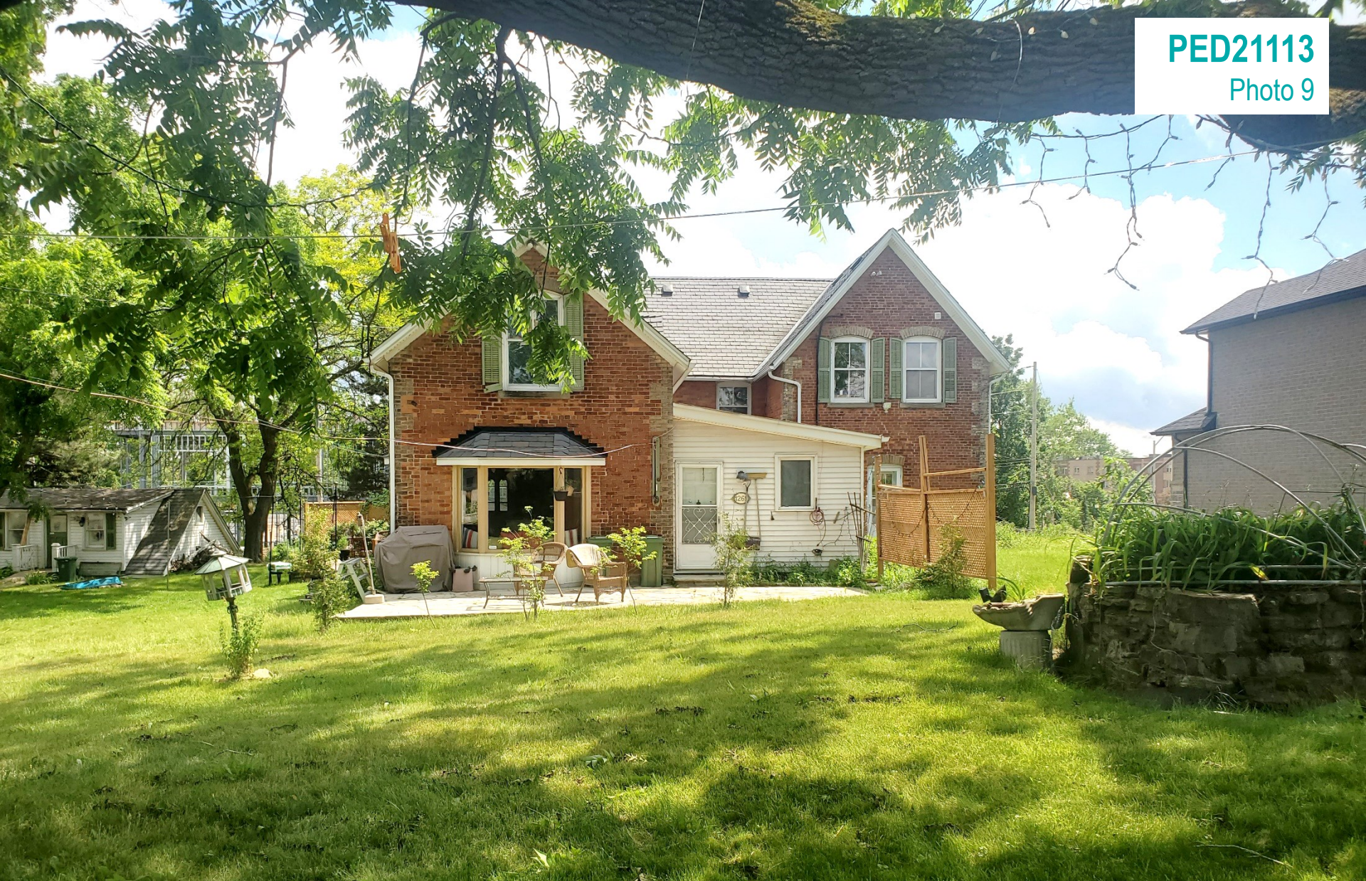
Rear of Heritage Building (Looking South) with Portion to be Demolished