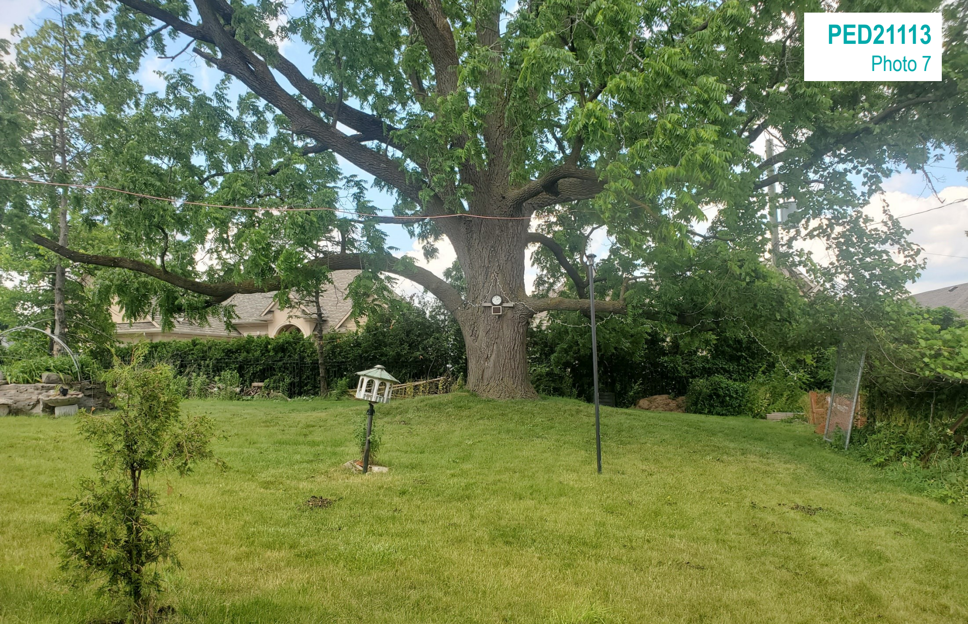
Rear Yard of Subject Property Looking North