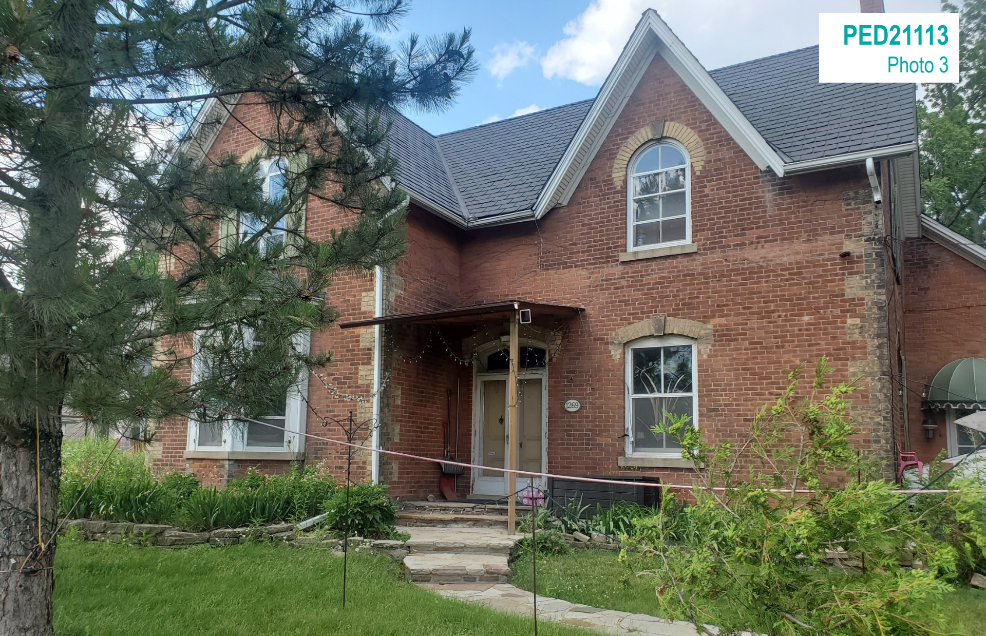
Front of Heritage Home (to be retained and incorporated into proposal)