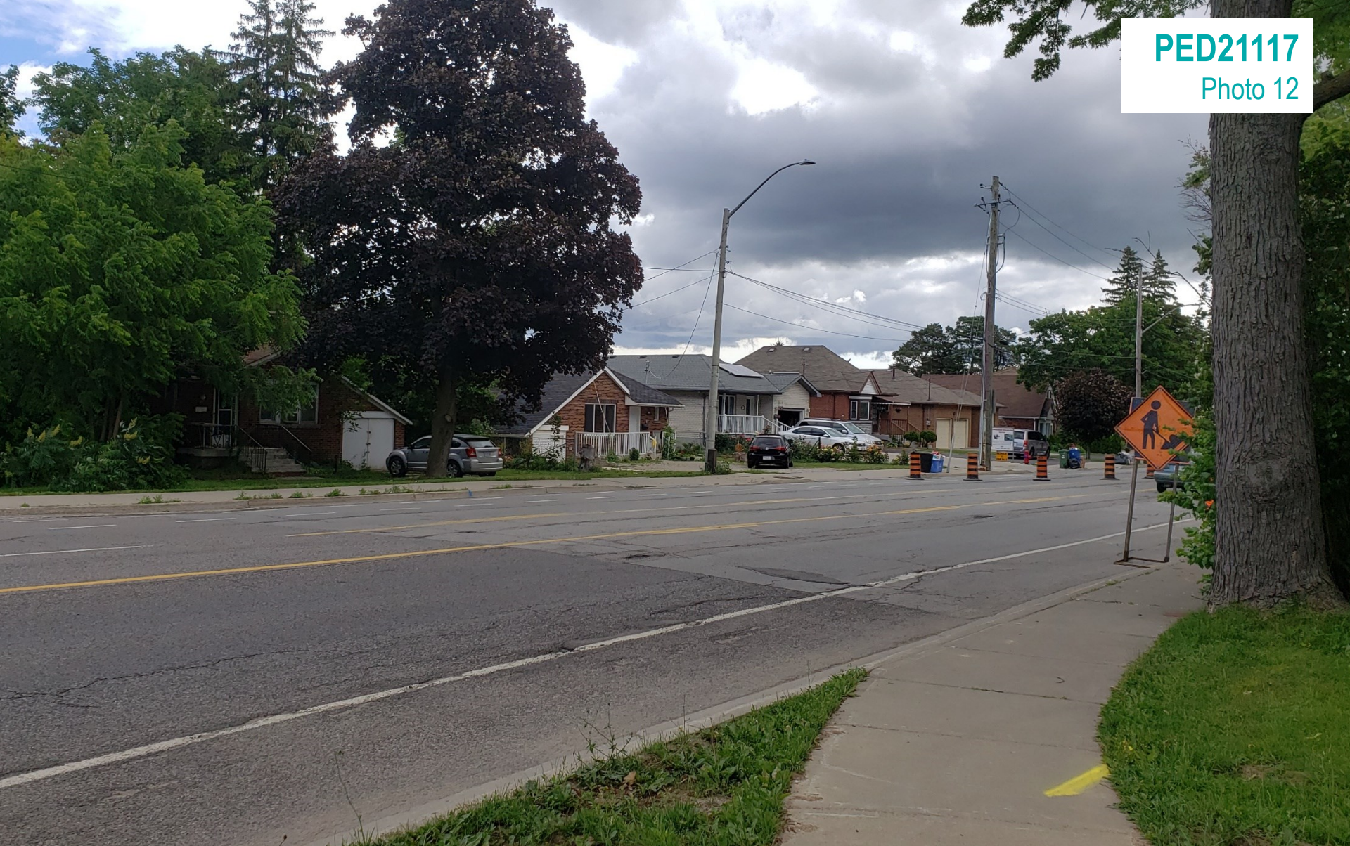
Single detached dwellings to the east along Stone Church Road East