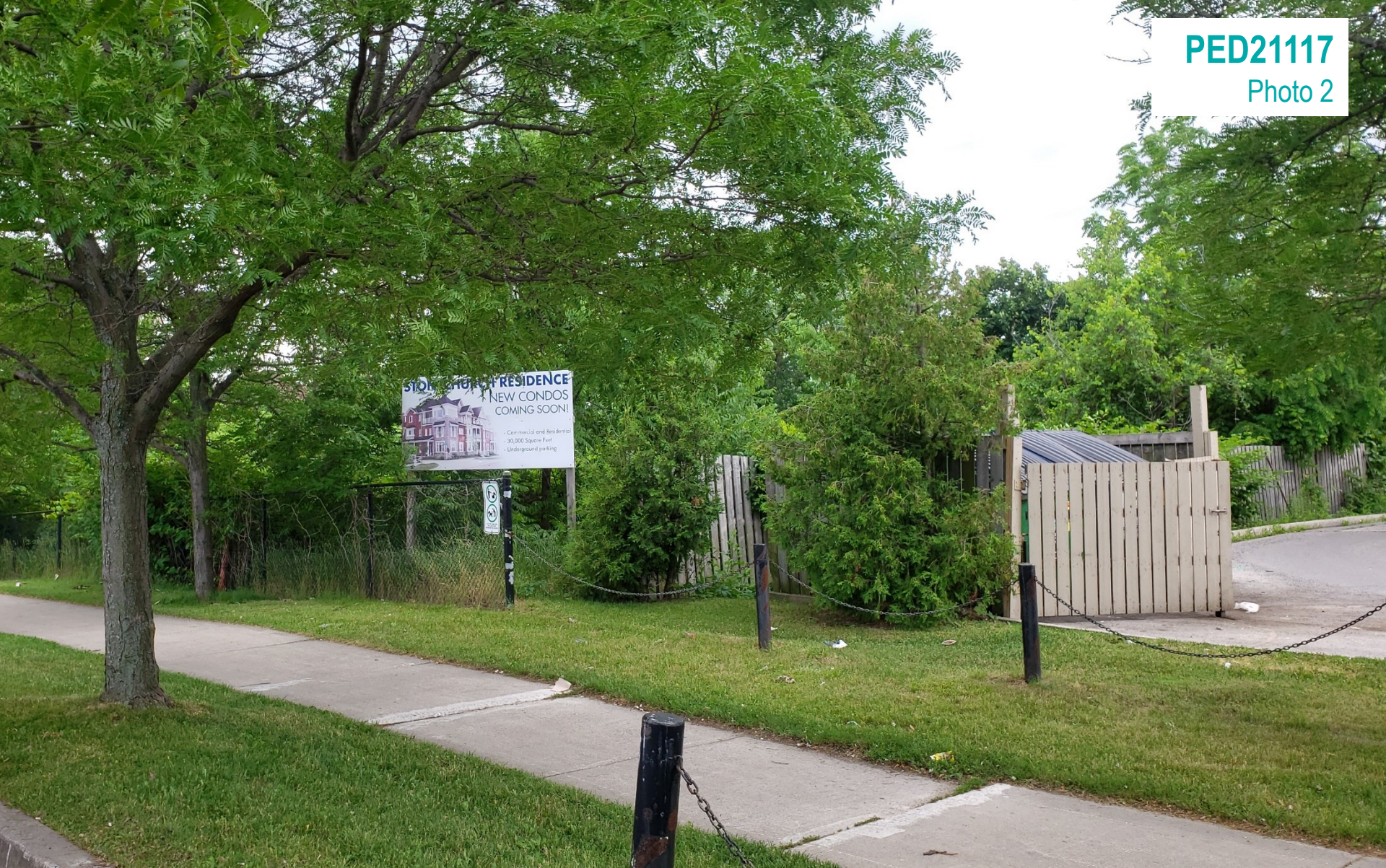
Subject site from northwest along north walkway