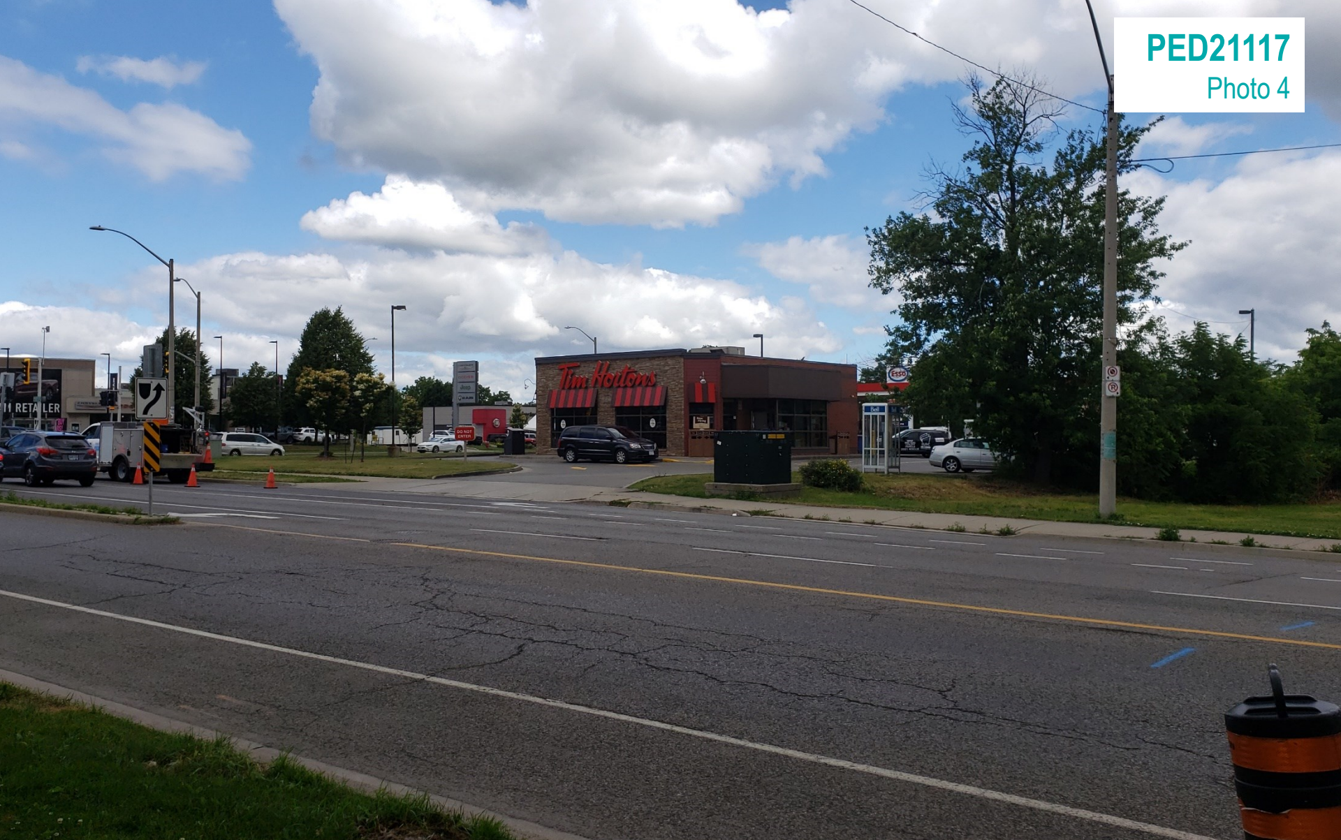
Commercial uses west of the subject site