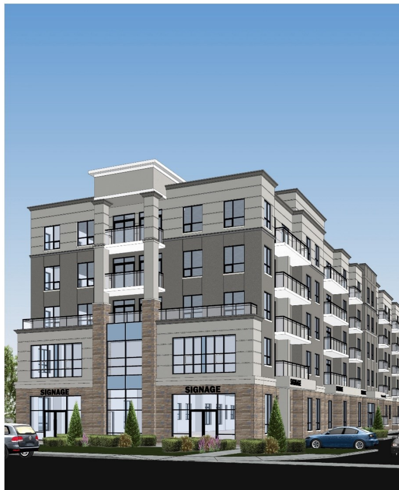
MIXED USE BUILDING 15-21 STONE CHURCH ROAD EAST HAMILTON, ON

KNYMH INC. 1006 SKYVIEW DRIVE • SUITE 101 BURLINGTON, ONTARIO • L7P 0V1 T 905.639.6225 www.knymh.com