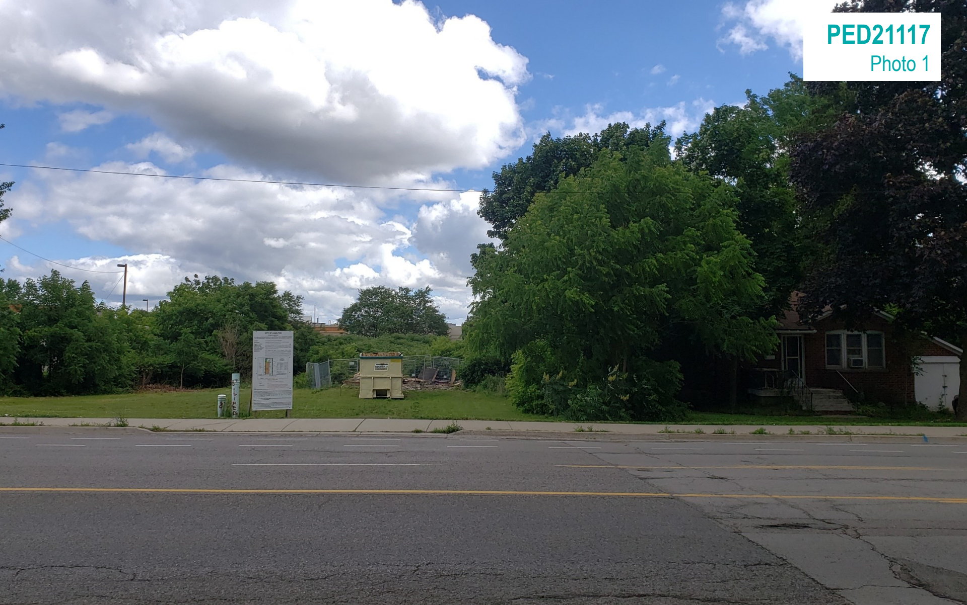
Subject site from south along Stone Church Road East