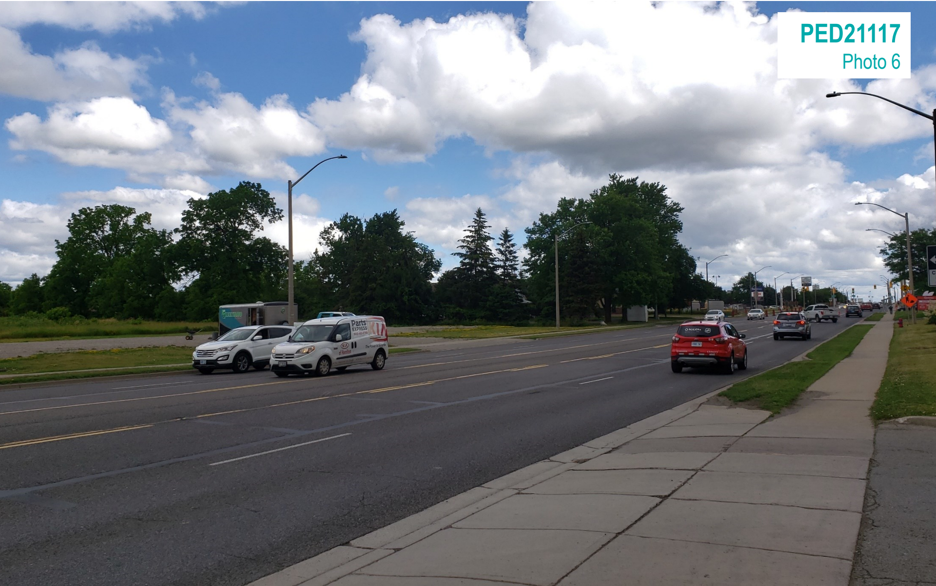
View to the north along Upper James Street from north walkway