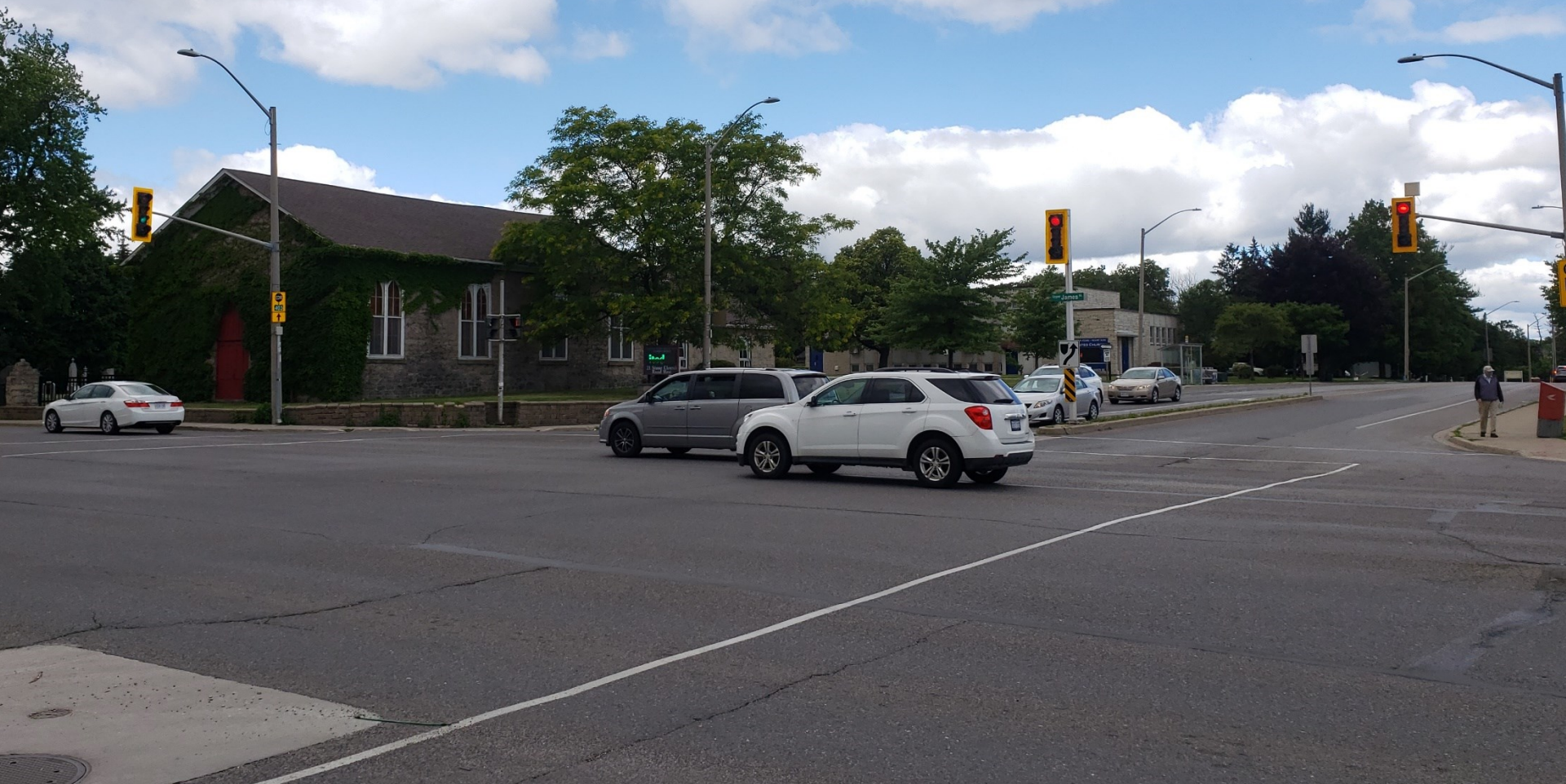
Place of Worship on southwest corner of Stone Church Road and Upper James Street