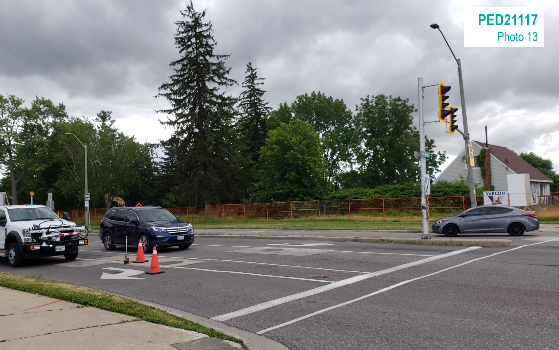
Lands to the south conditionally approved for multiple dwellings