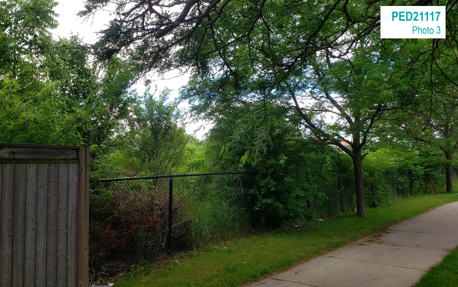
Subject site from northeast along north walkway