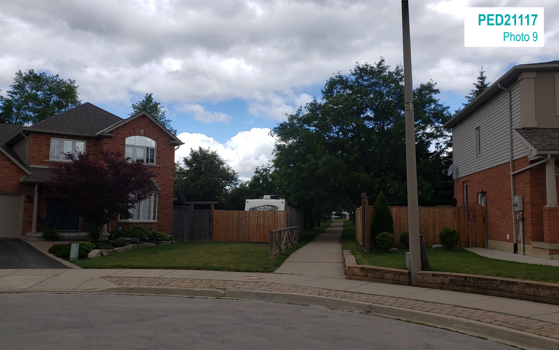
View to the west along north walkway from Theodore Drive