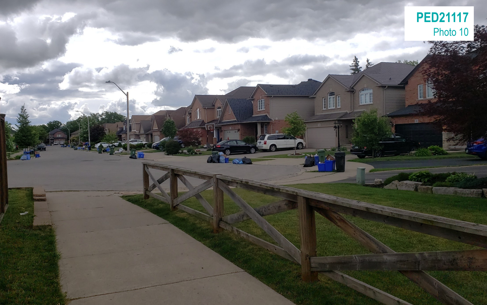
View to the east from north walkway along Theodore Drive