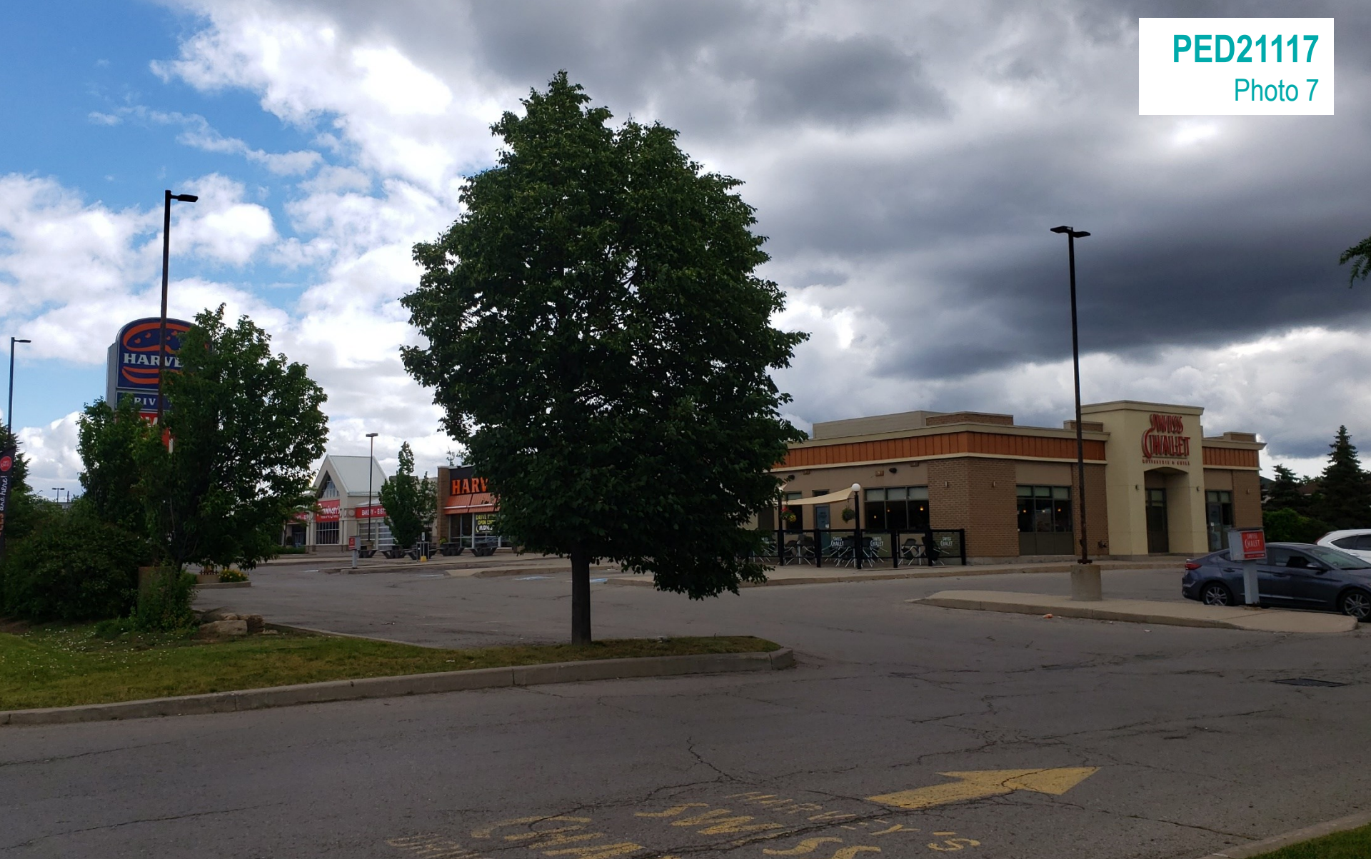
Commercial uses to the north from Upper James Street