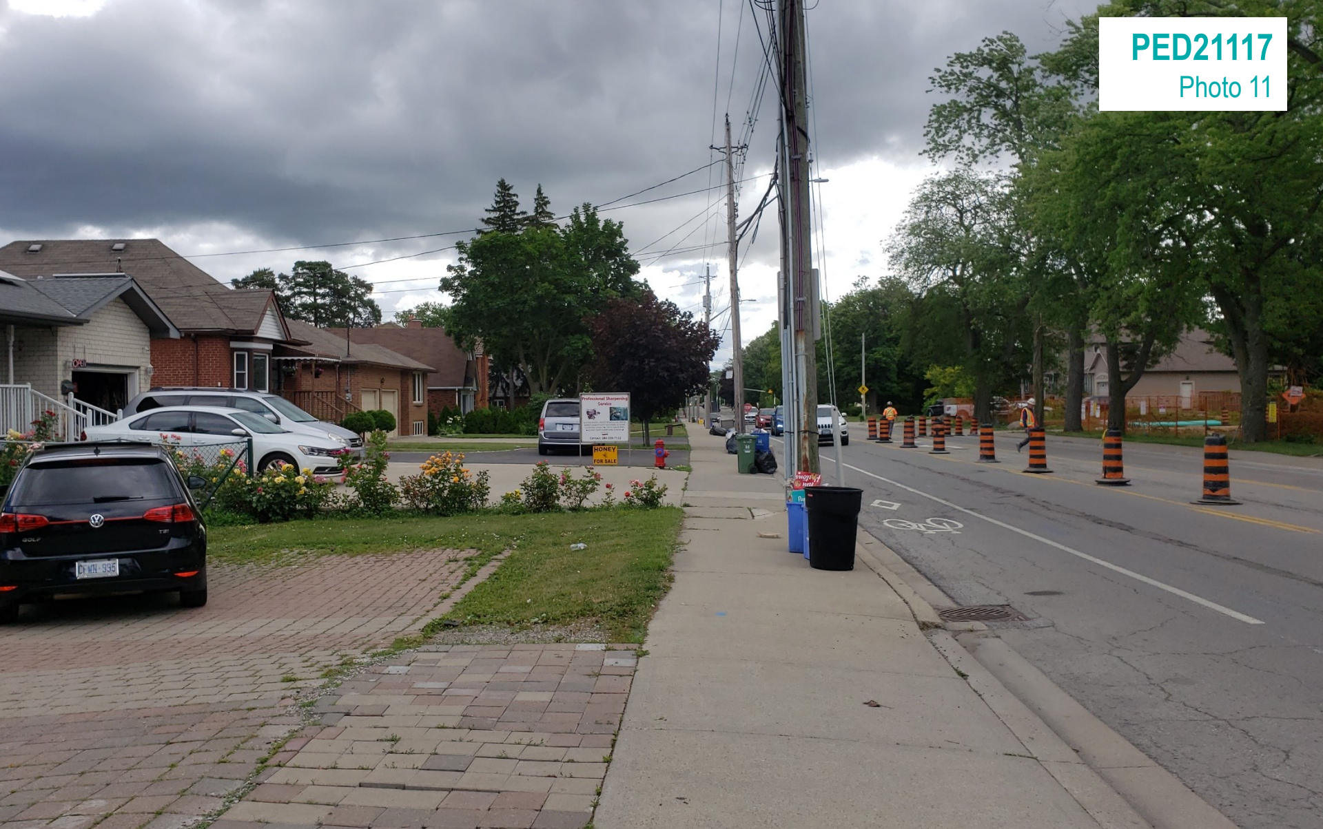
View to the east along Stone Church Road East