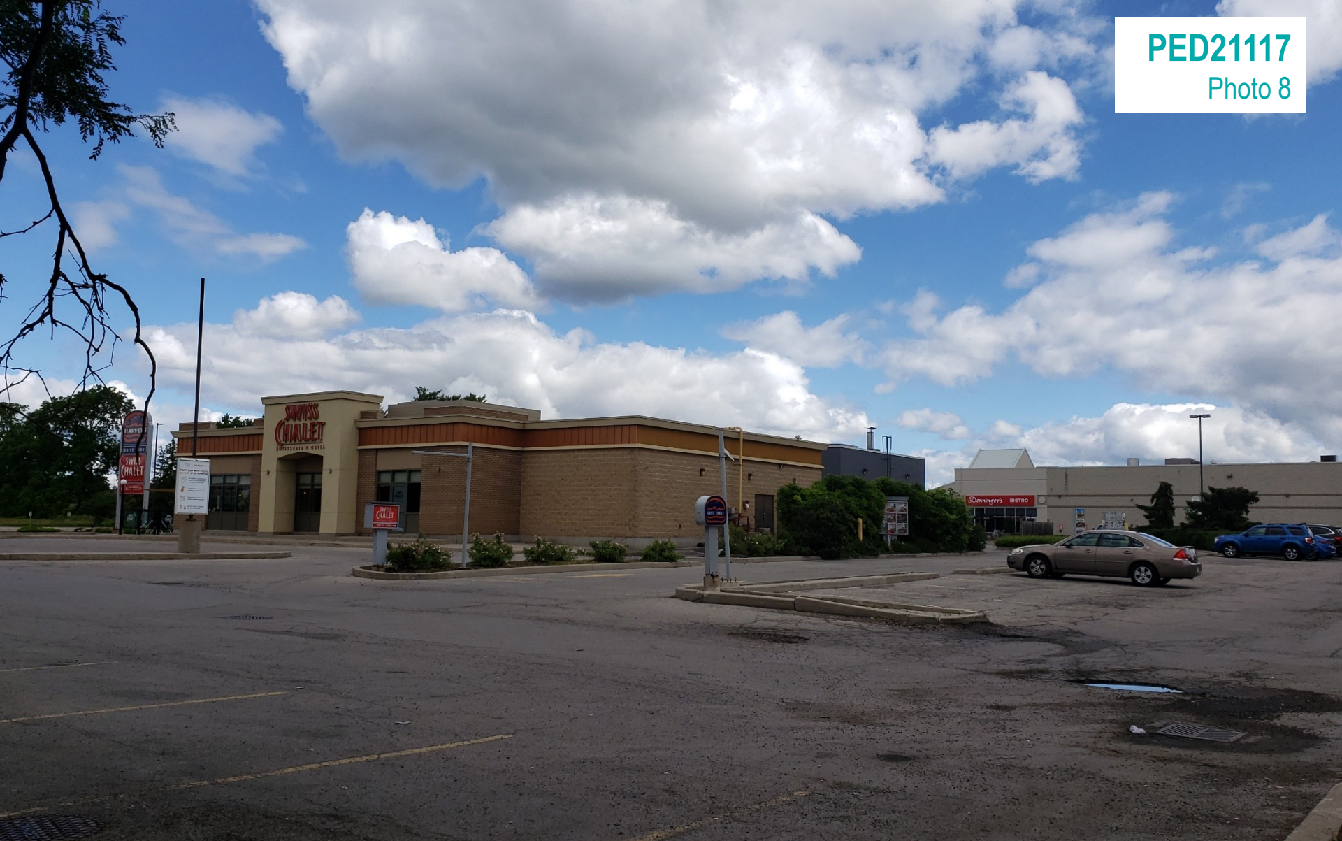
Commercial uses to the north from north walkway