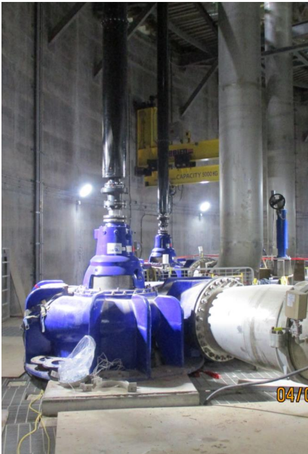
Figure 1: Complete Pumping System Installation