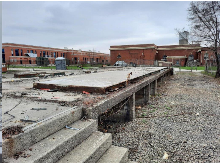
Figure 5 & 6: WTP Substation Demolition (Originally built in 1958)