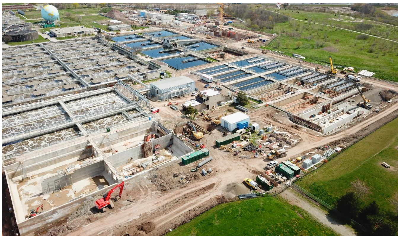
Figure 9: South Secondary Treatment Plant Upgrades Construction