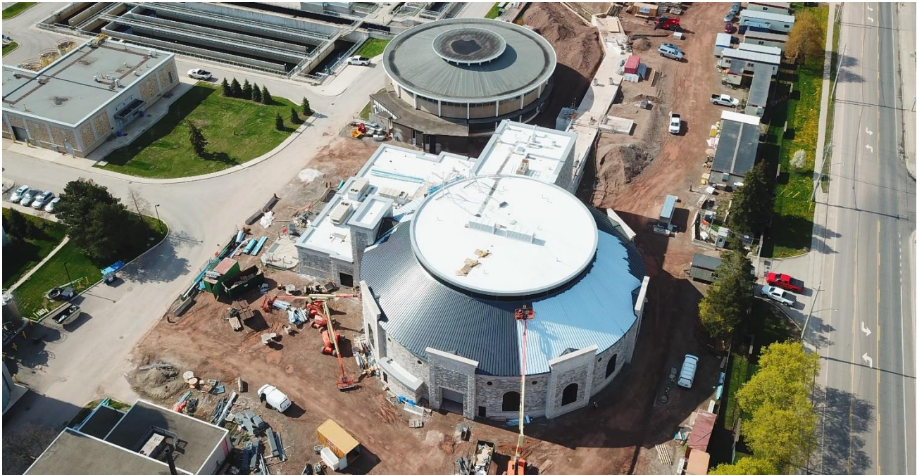
Figure 3: New Main Pumping Station