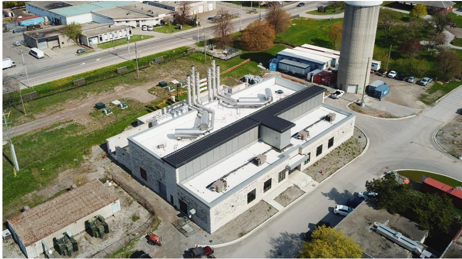
Figure 4: New Electrical Power Centre