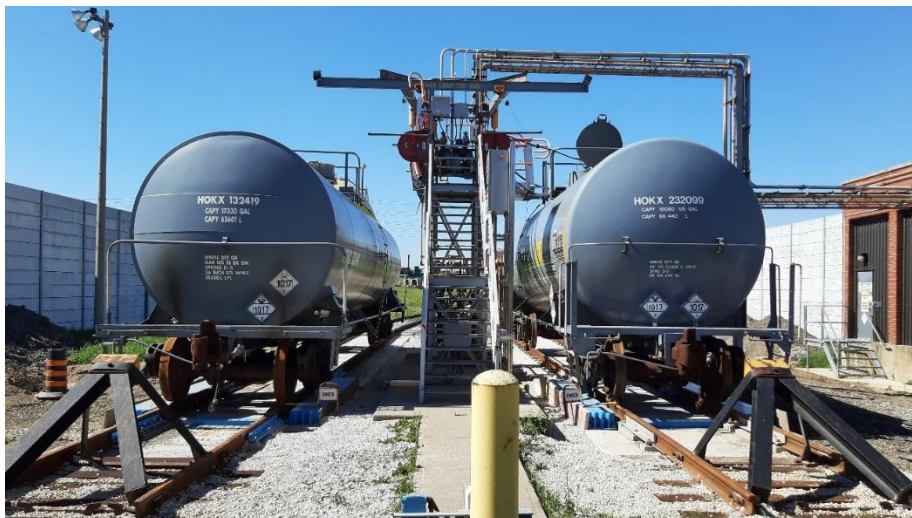
Figure 7: Chlorine Unloading Area with New Weigh Scales Installed