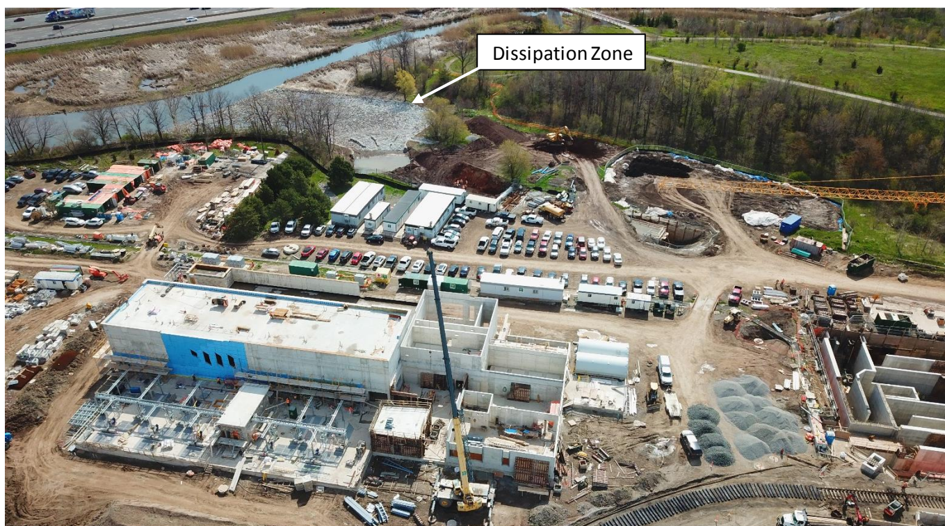
Figure 8: New Tertiary Treatment Facility Construction with Effluent Dissipation Zone