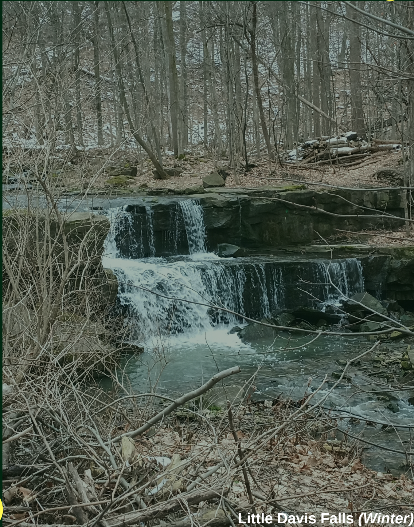
Little Davis Falls (Winter)