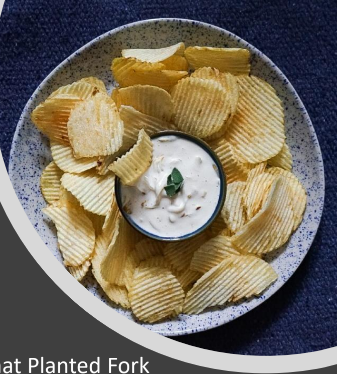
That Planted Fork