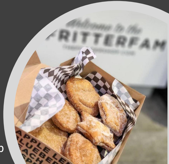
The Fritter Shop