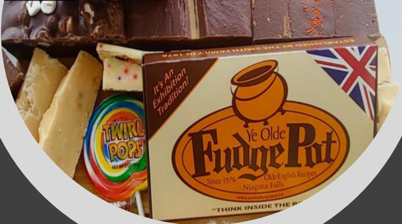
Joshy's Good Eats