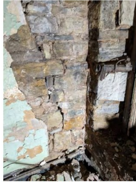
Fig 2: 18-20, 2 nd floor, West return wall separation