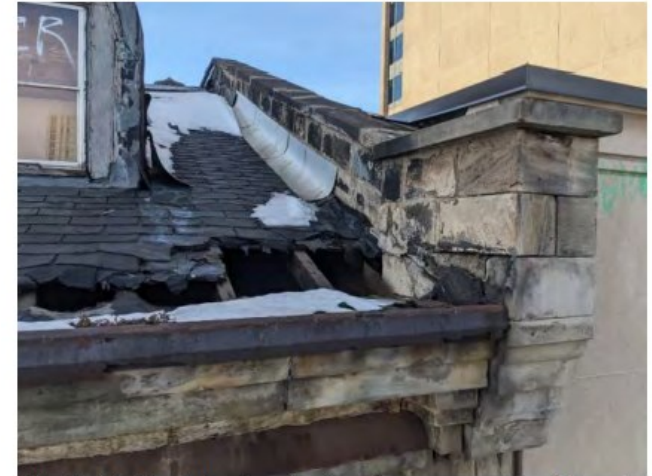
Fig 4: 18-20. Failed roof, pier at upper corner of façade