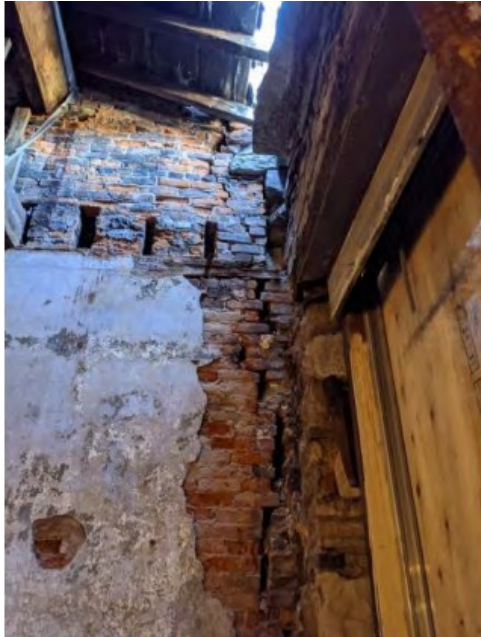
Fig 1: 18-20, 3 rd floor, West return wall separation