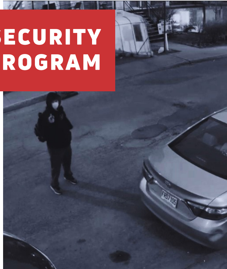
(April 5, 2021 - Montreal mosque, the Centre Communautaire Islamique Assahaba, targeted by a mask man firing an air gun at the windows of the masjid)

Right now, programs in place allow Muslim organizations to apply for funding to shore up their security measures. However, applicants must demonstrate that they, “are at risk of being victimized by hate-motivated crime.” Typically, given that there are more applicants than there is funding, applicants demonstrate that