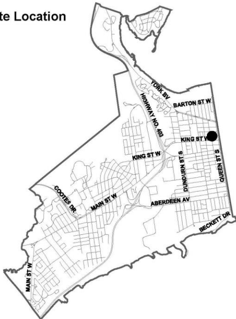
Key Map - Ward 1