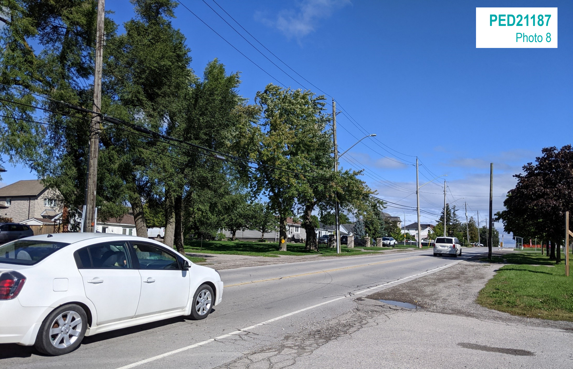
Streetscape of Upper Wellington Street