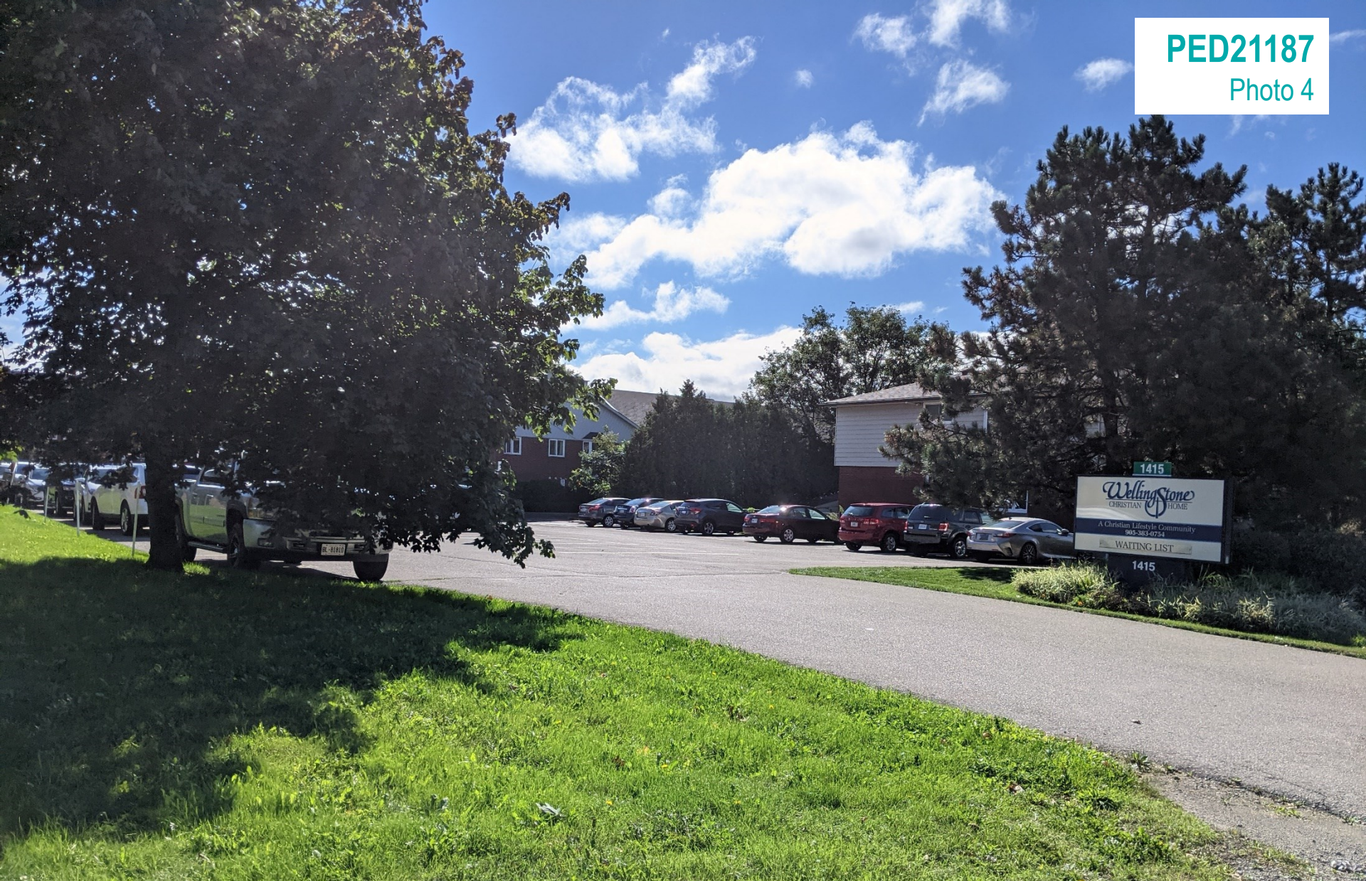
Existing retirement home to be connected to development