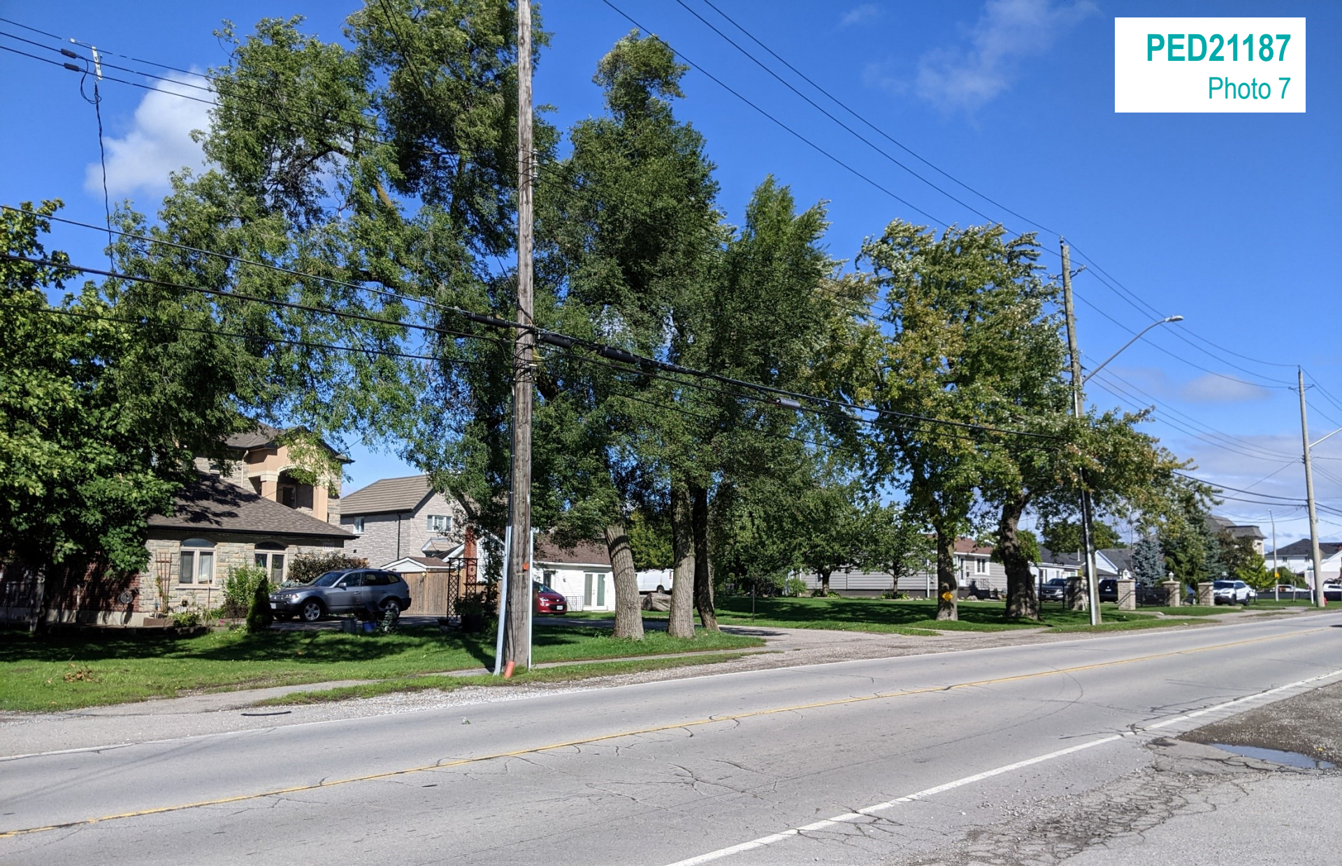
Existing single detached dwellings to the west