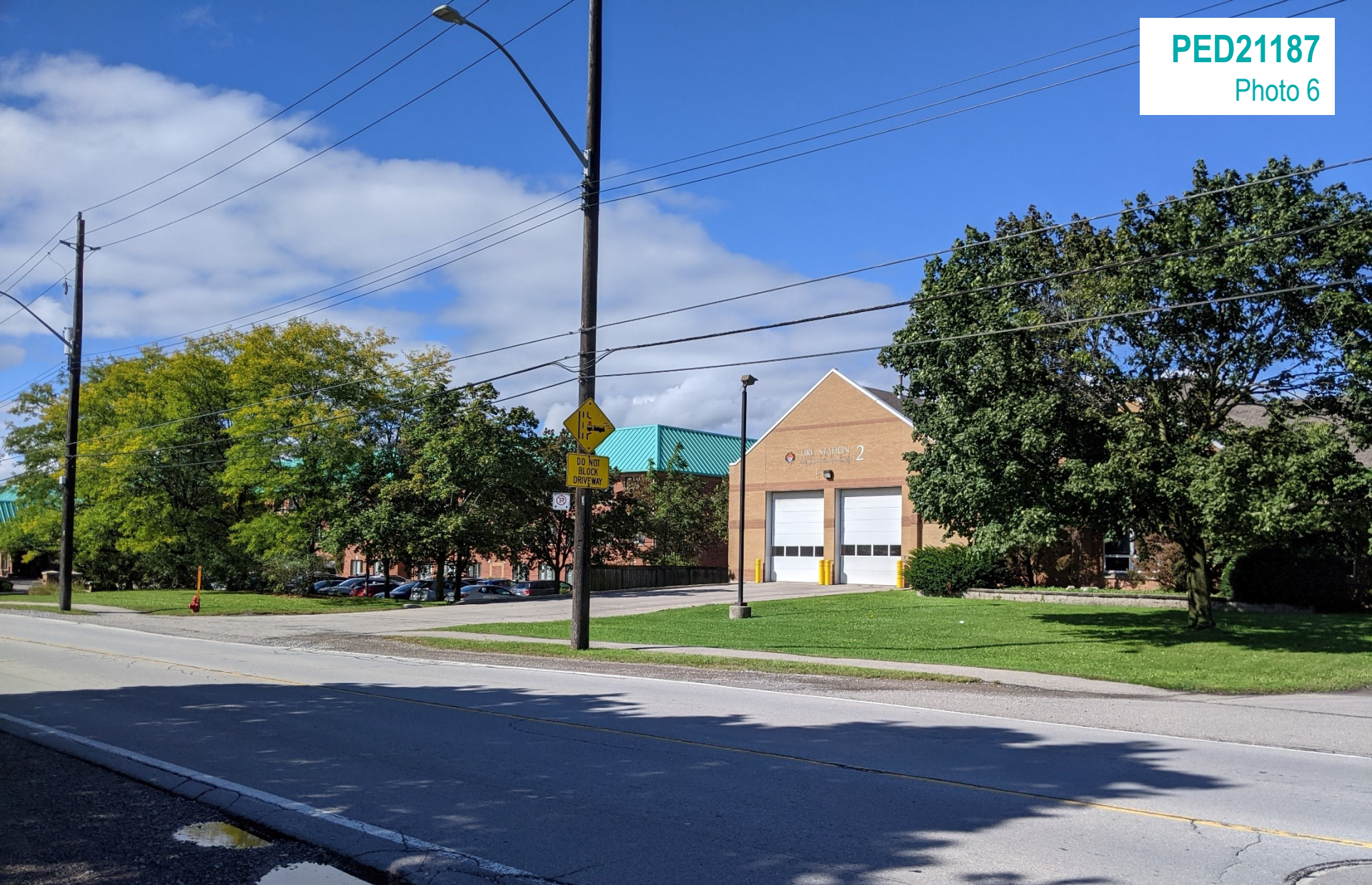
Fire Station to the west