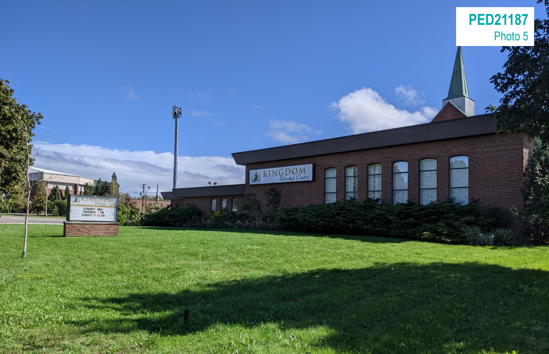
Place of worship on site to be demolished