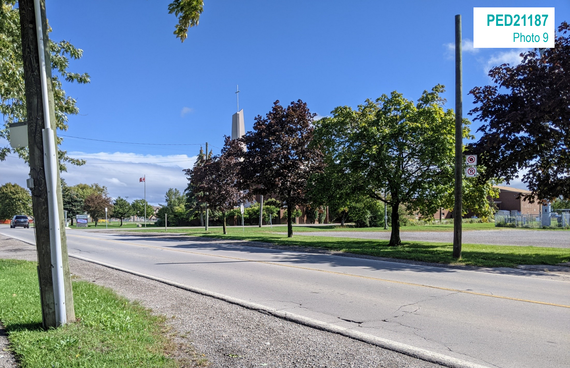
Northerly extent of lands and Place of Worship to north