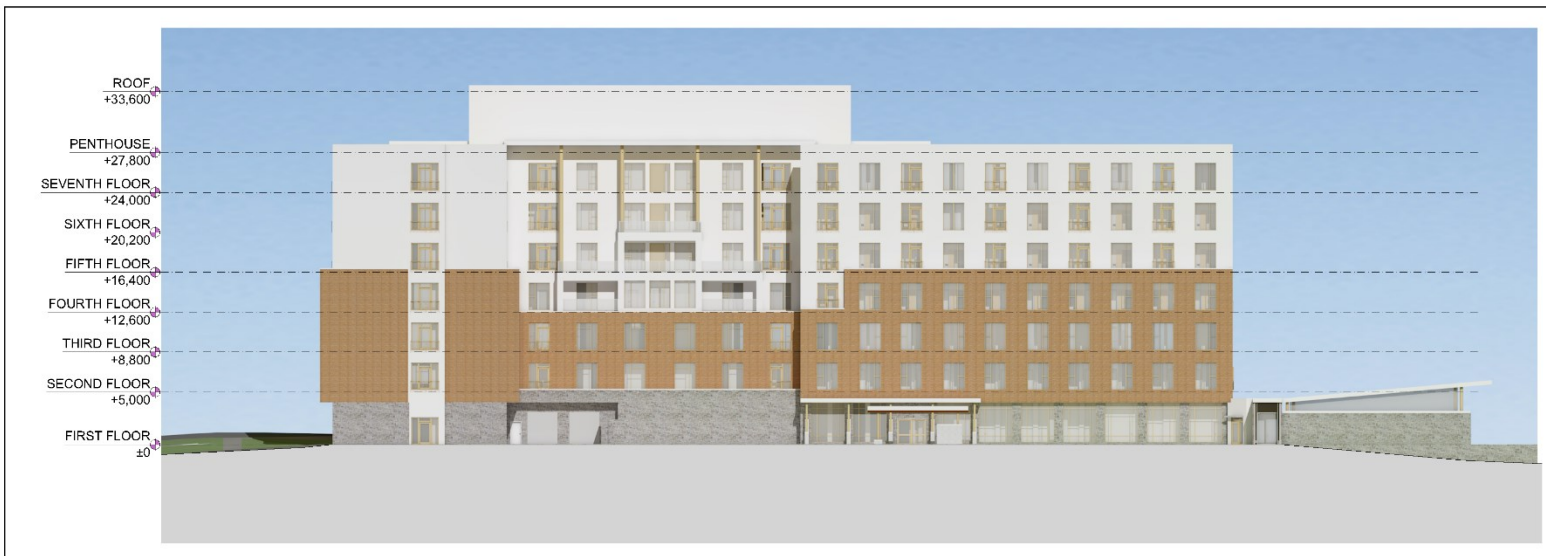
2 SOUTH ELEVATION SCALE: 1/200