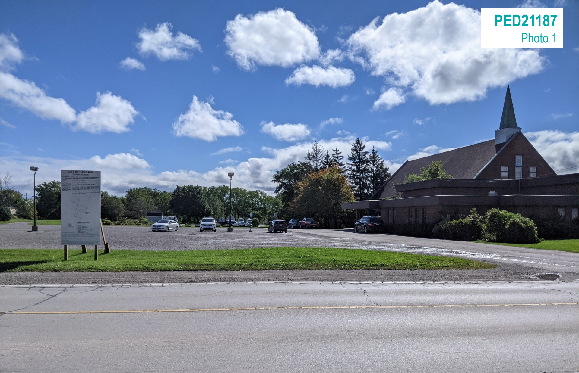
Subject Lands showing lands to the east