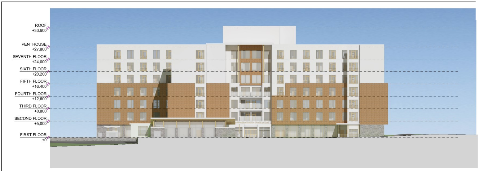
1 EAST ELEVATION SCALE: 1/200