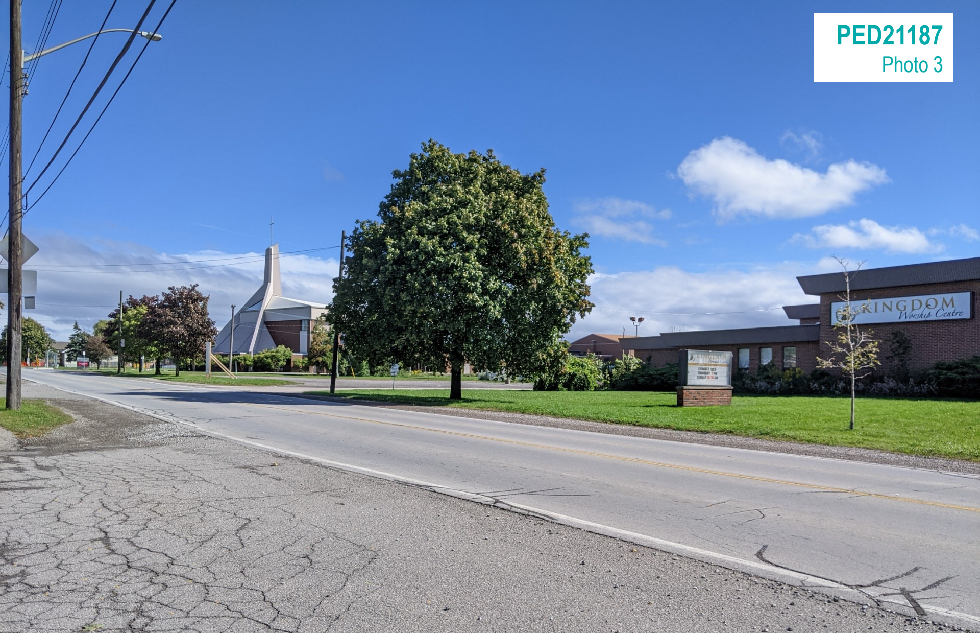
Existing place of worship and Upper Wellington Street