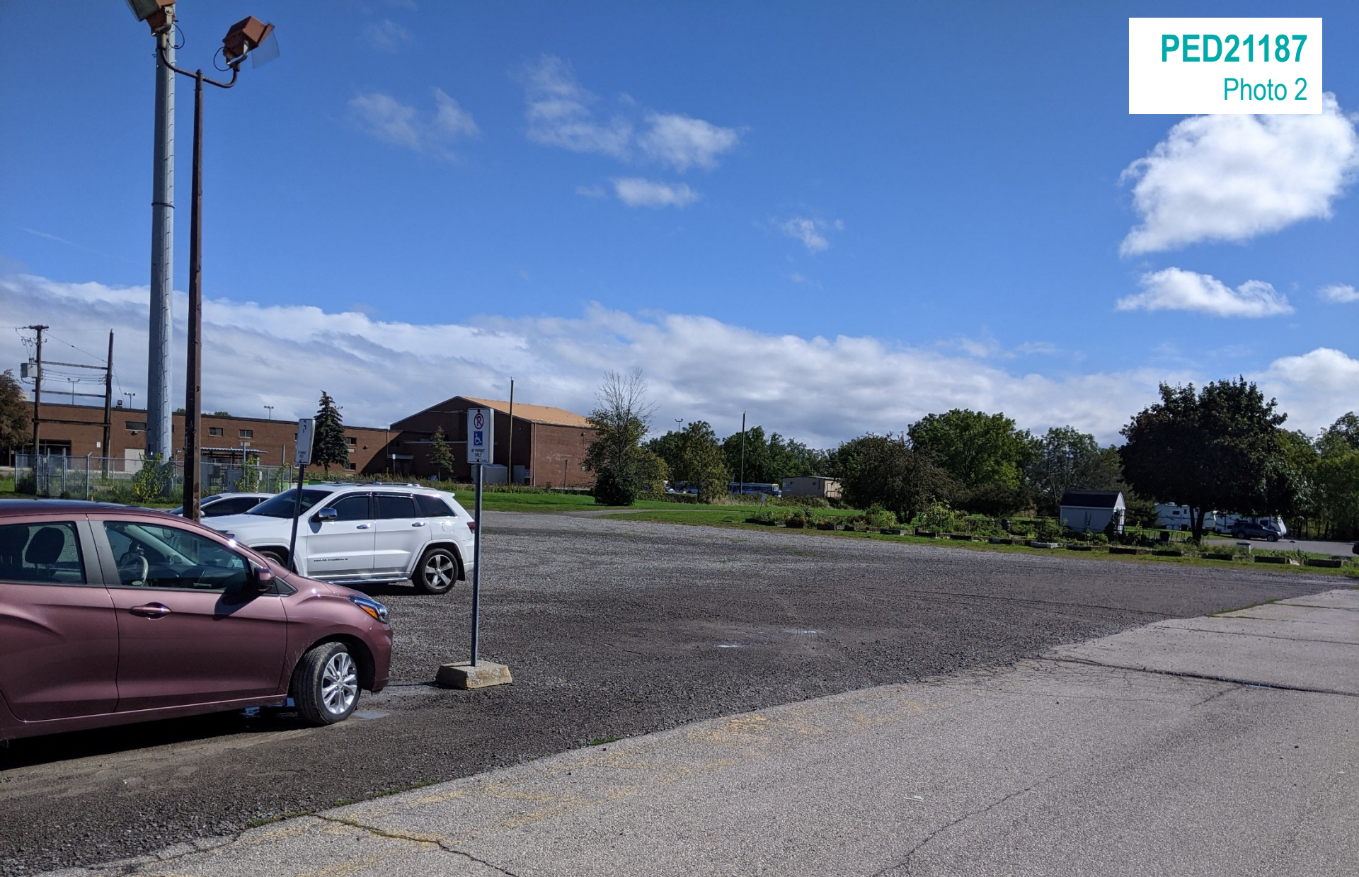
Undeveloped portion of Subject Lands