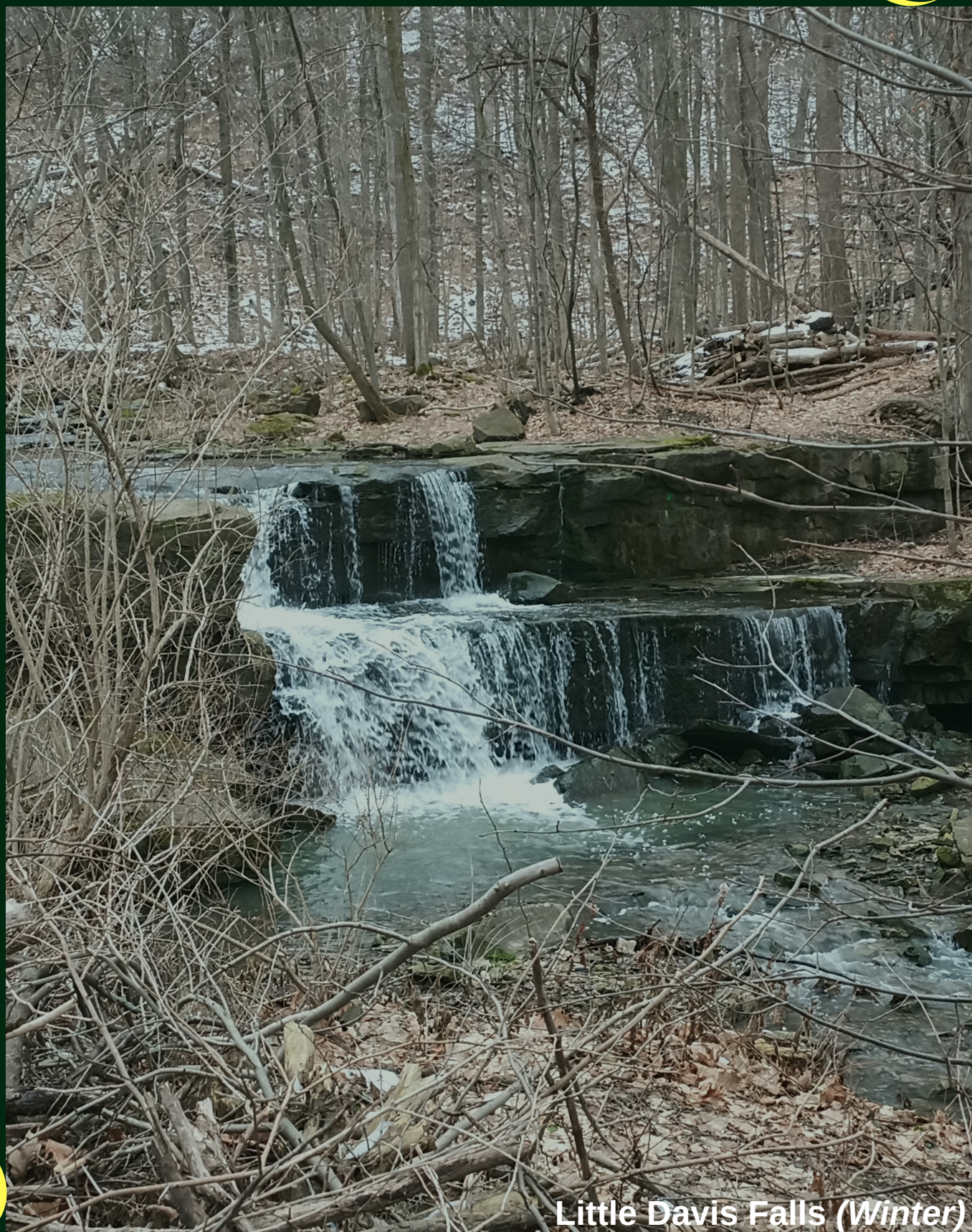
Little Davis Falls (Winter)