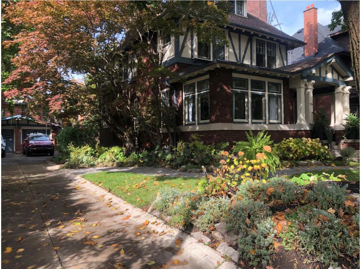
Photograph 3: Property (October 20, 2020)