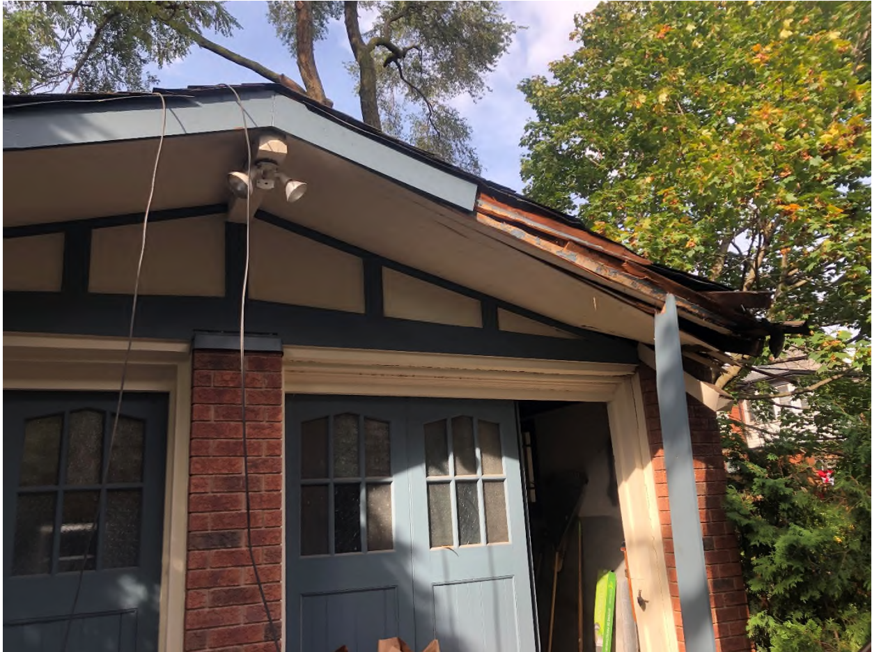
Photograph 2: Front Elevation - Original Brick (October 20, 2020)