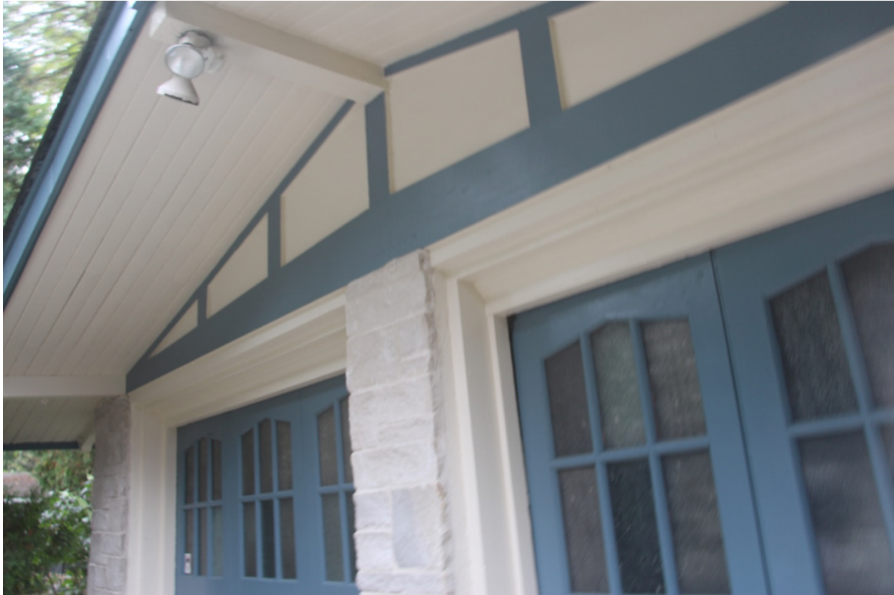
Photograph 5: New Wall Application Close-up (October 29, 2021)