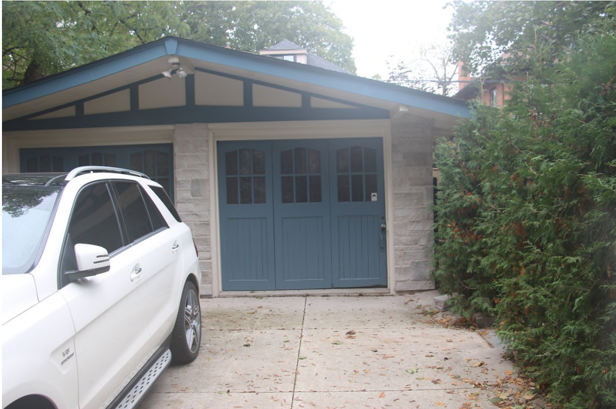
Photograph 4: New Wall Application (October 29, 2021)