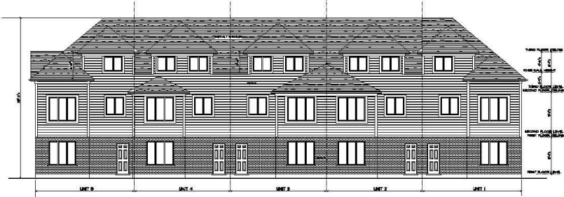
WEST ELEVATION 100 AND 104.5 STREET

NOTES: OWNER/CONTRACTOR TO VERIFY SITE CONDITIONS AND MAKE ANY NECESSARY ADJUSTMENTS TO FOUNDATION HEIGHT, STEPPING AND VERRISING TO SUIT GRADE.