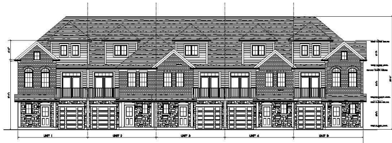
EAST ELEVATION 100 AND 104.5 STREET