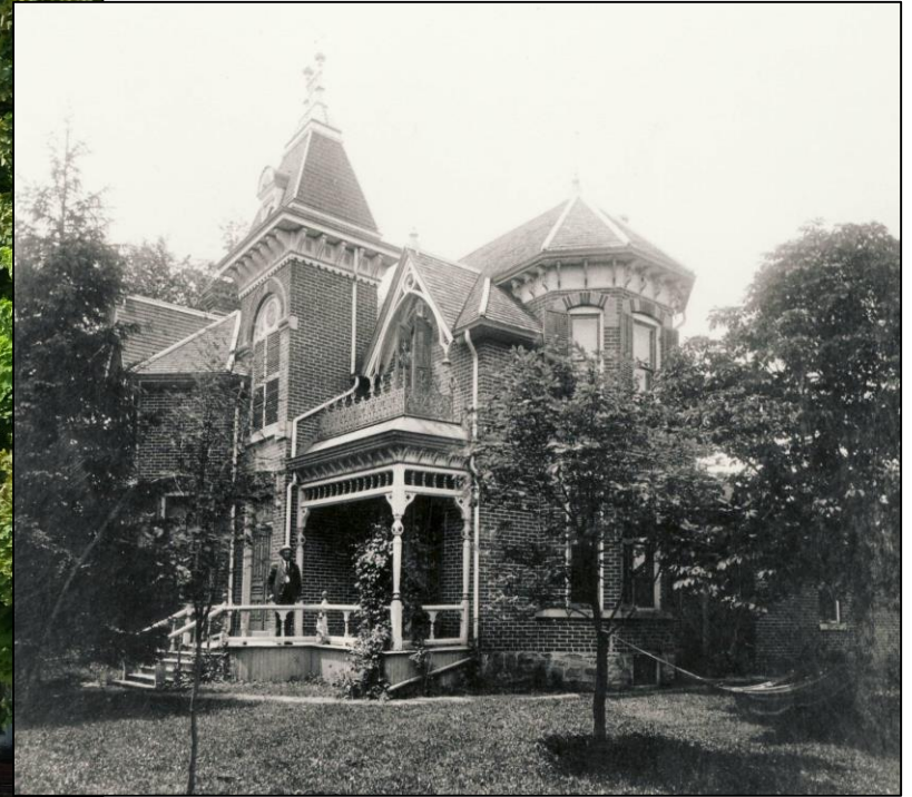
c. 1906, Flamborough Archives Image BW1879