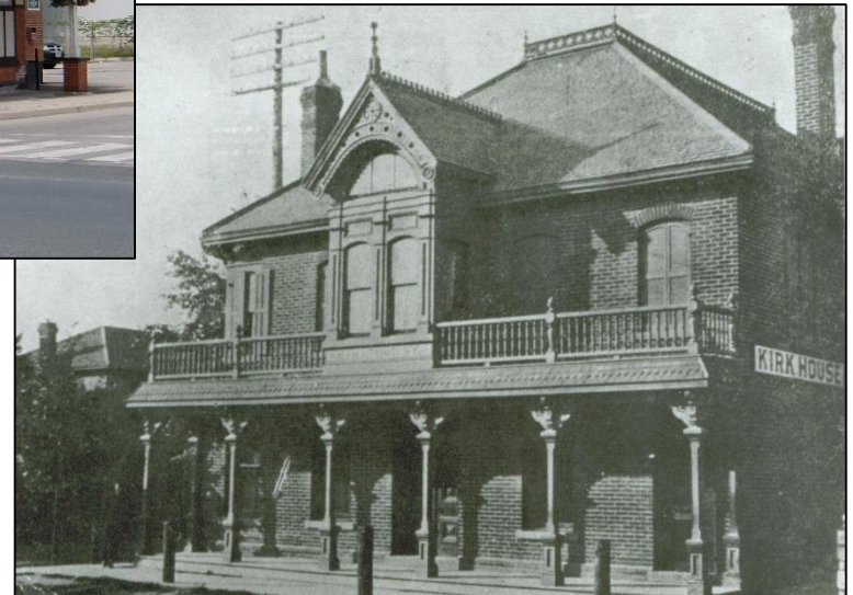
c. 1920, Flamborough Archives Image BW746