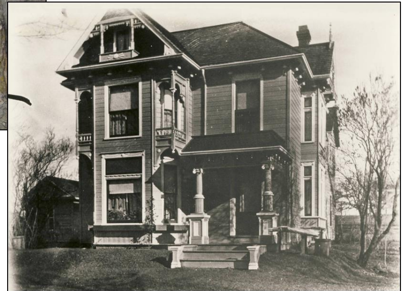
Undated, Flamborough Archives Image BW2229