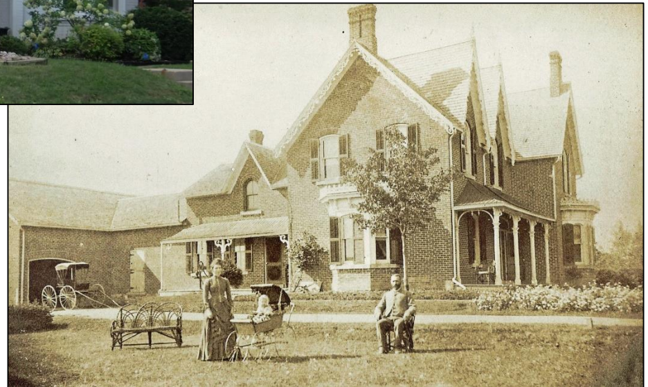
c. 1888, Flamborough Archives Image BW2836