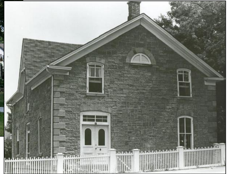
c. 1970s, Flamborough Archives Image BW467