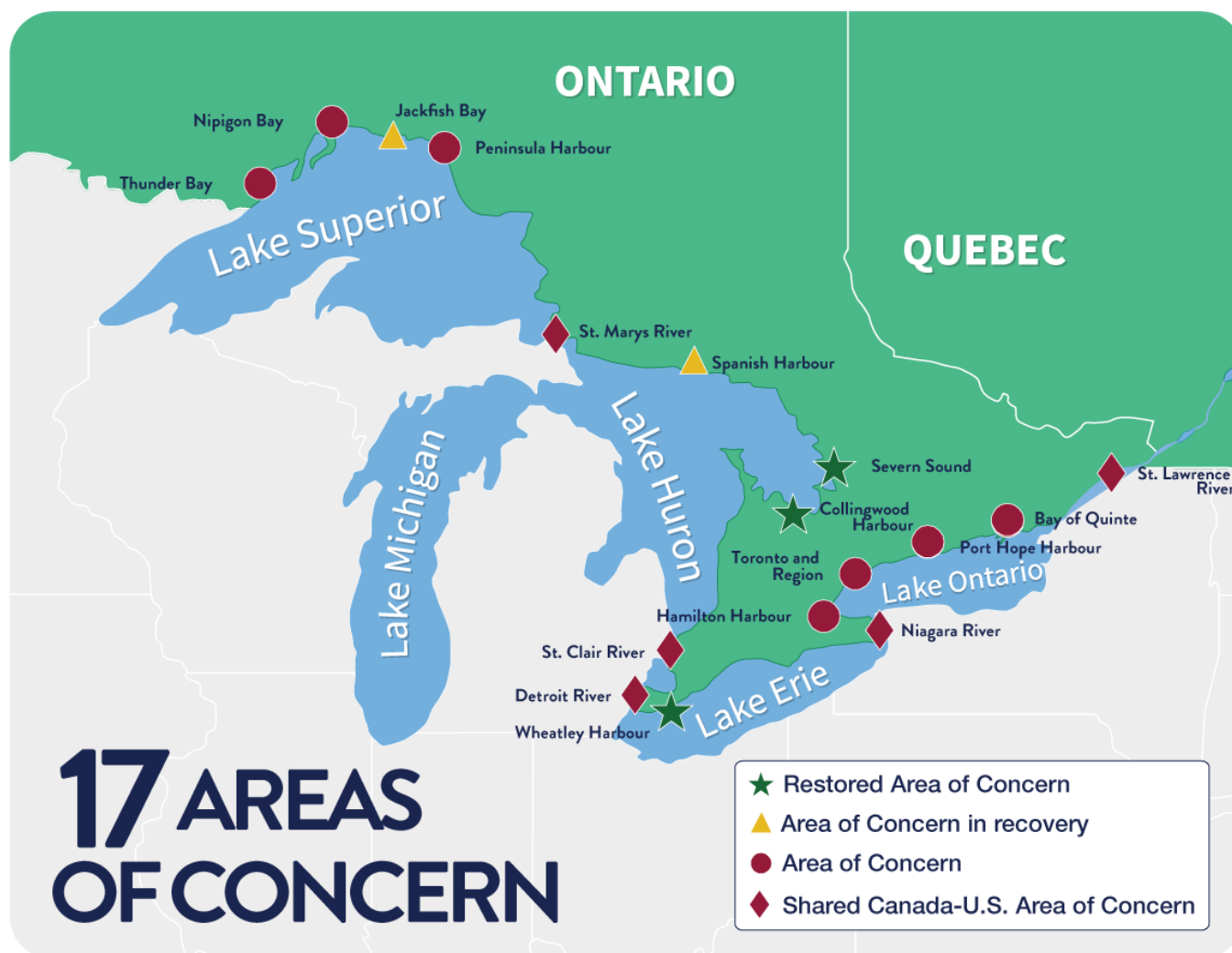
Figure 1. Status of Canada's 17 Great Lakes Areas of Concern, 2021