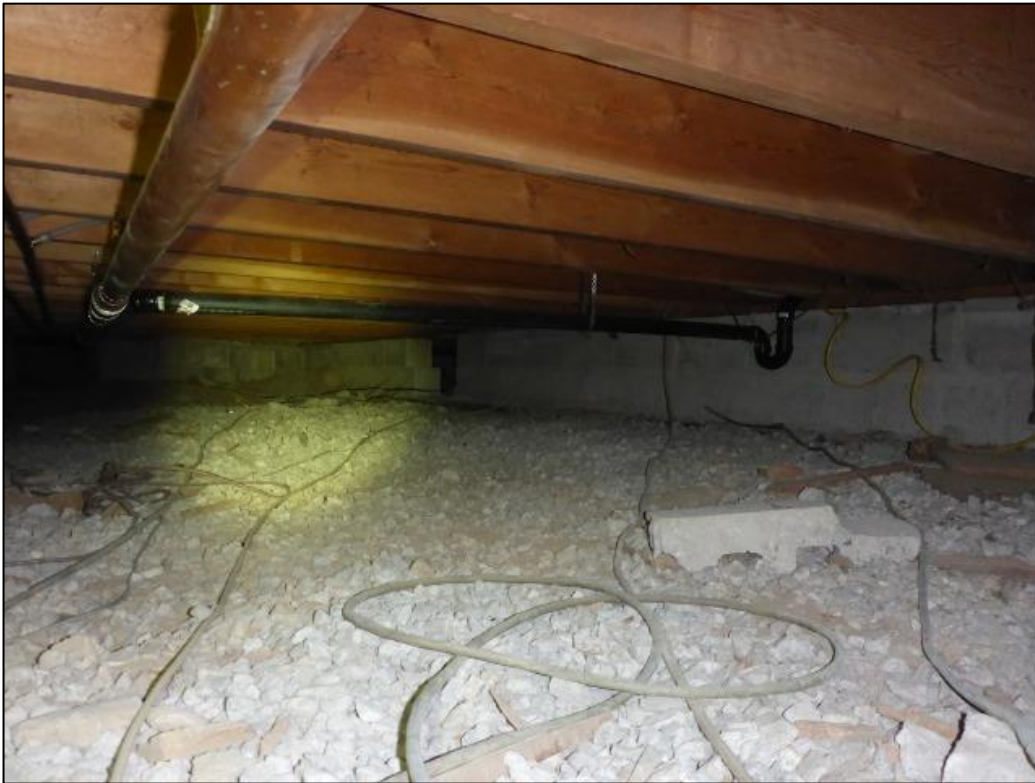
Image 10: Crawl space under house showing typical cinderblock foundation and wooden floor joists