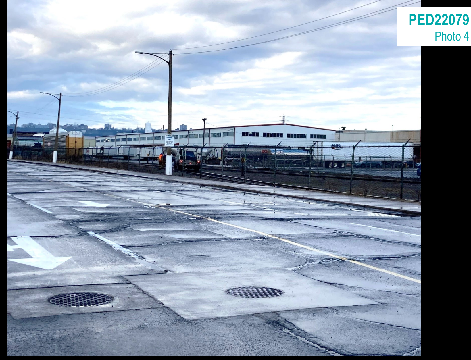
Looking south on Wilcox Street at Neighbouring Industrial