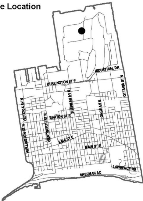
Key Map - Ward 3