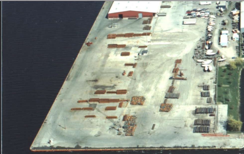
LATE 1980's HAMILTON PORT AUTHORITY