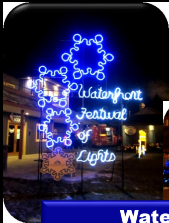
Waterfront Festival of Lights 2013 to present