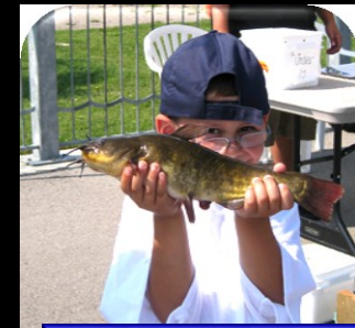
Hamilton Harbour Fishing Derby 2007 to present