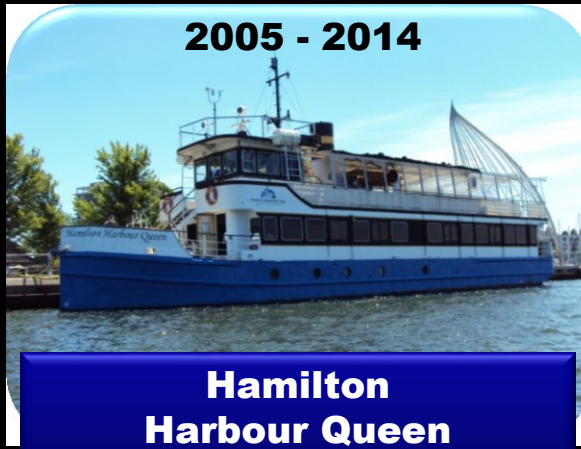
Hamilton Harbour Queen