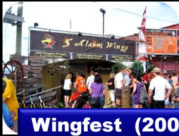
Wingfest (2008 – 2010)