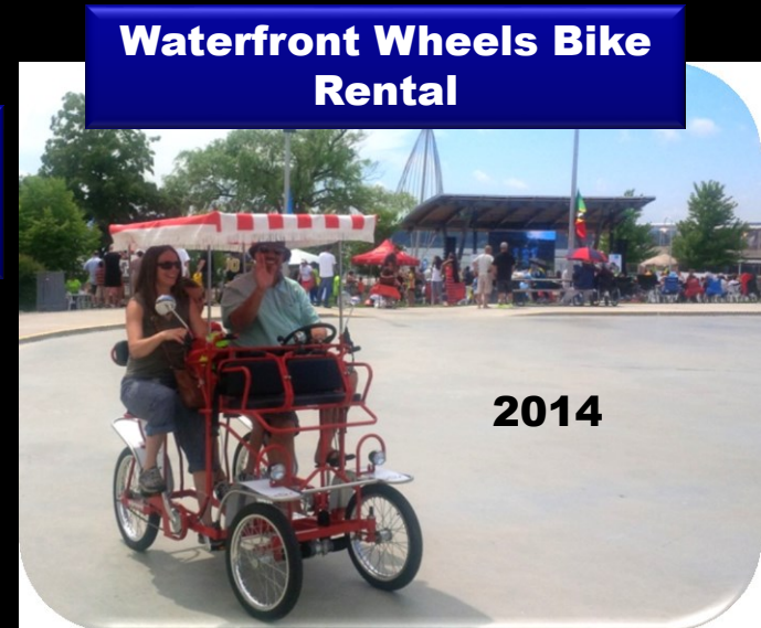
Waterfront Wheels Bike Rental