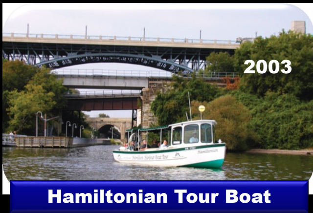
Hamiltonian Tour Boat