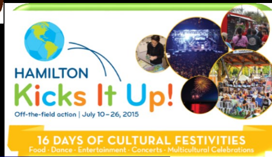
Toronto PanAm Events 2014 & 2015