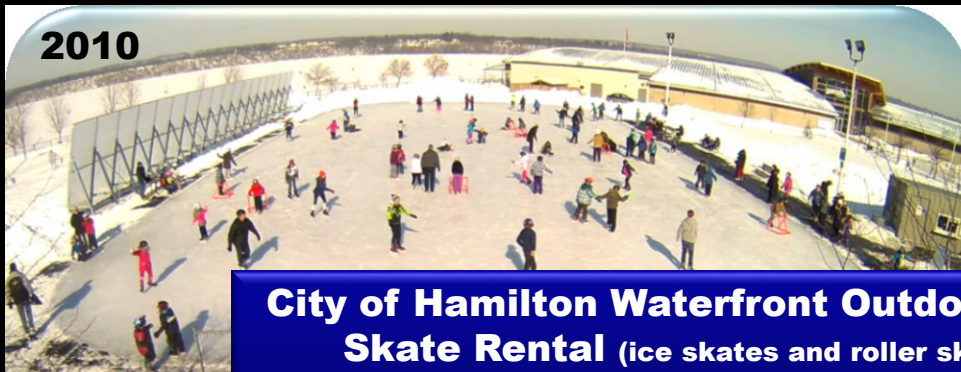
City of Hamilton Waterfront Outdoor Rink, Skate Rental (ice skates and roller skates) & Warm Up Room