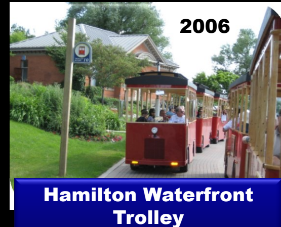
Hamilton Waterfront Trolley