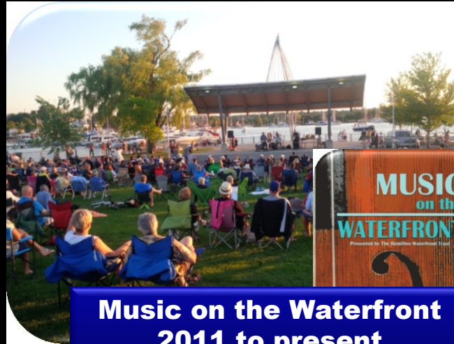
Music on the Waterfront 2011 to present