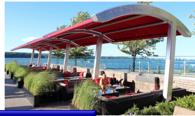
Restaurant & Bar 2012 - 2017