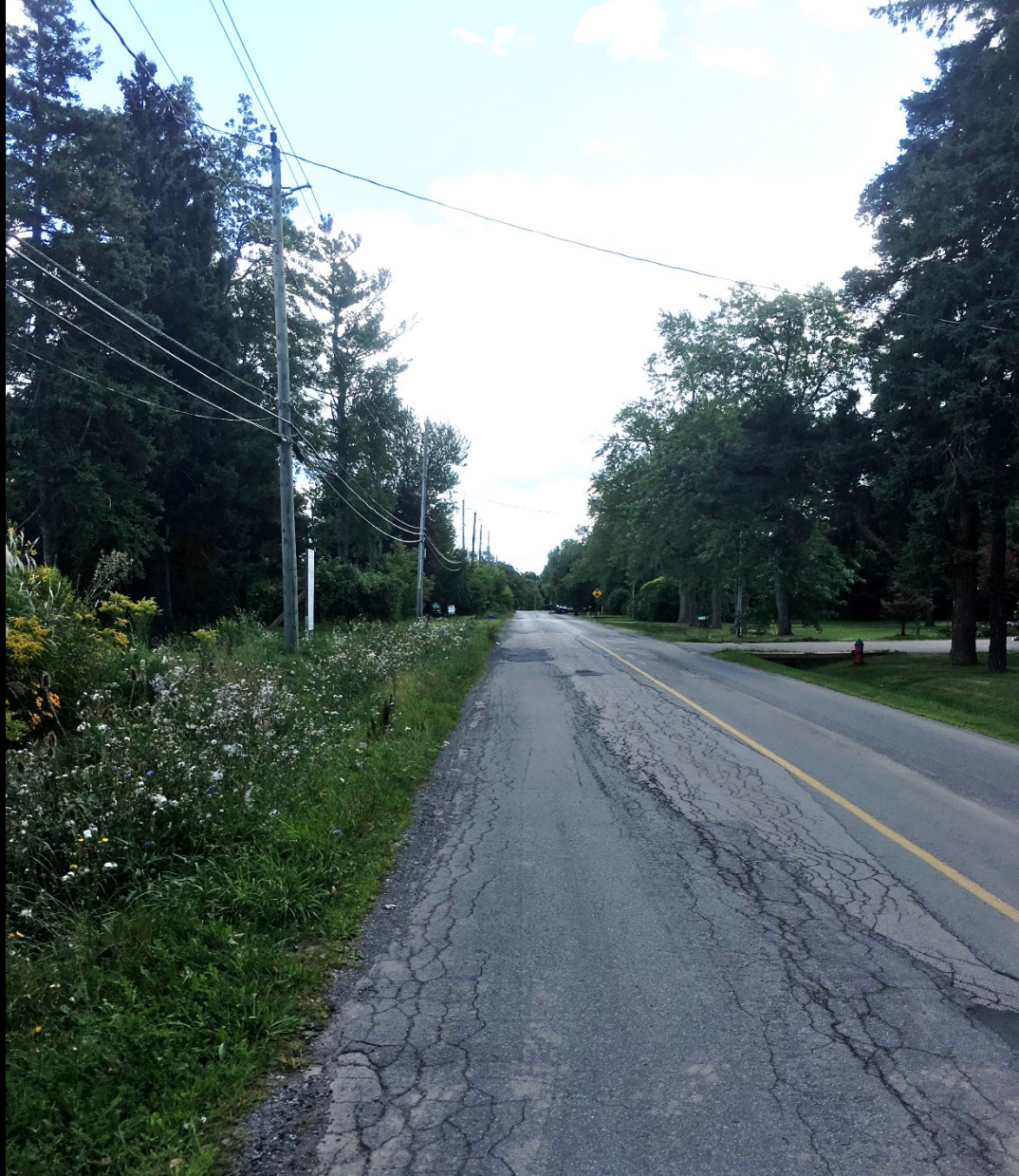
Looking South along Springbrook Avenue