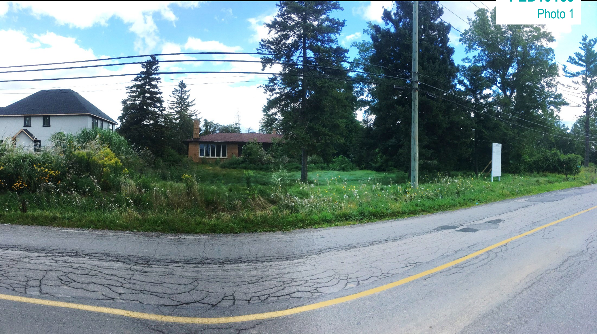
Existing Single Detached 455 Springbrook Avenue