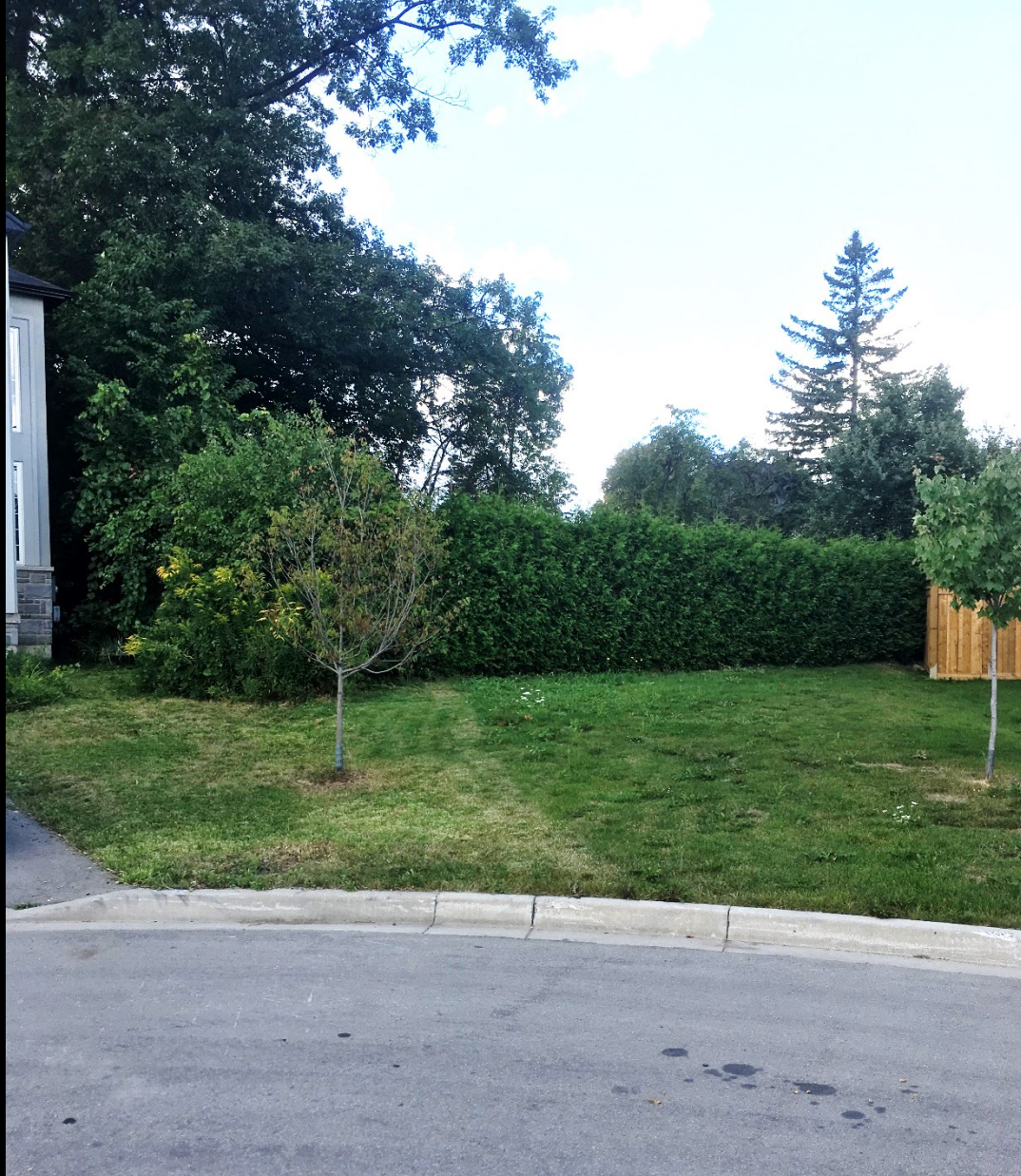
253 Fair Street and Block 14