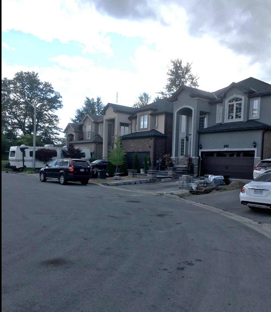
Properties south of Fair Street