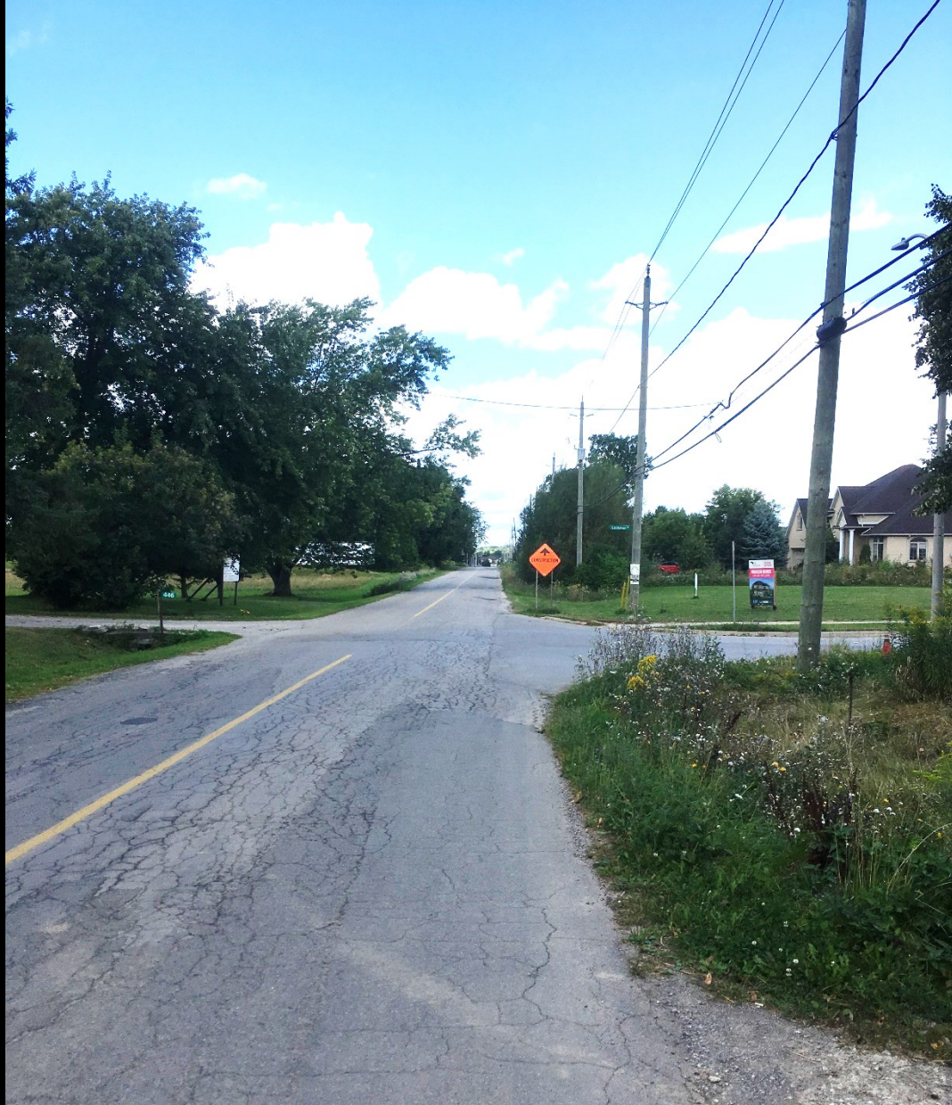
Looking North along Springbrook Avenue