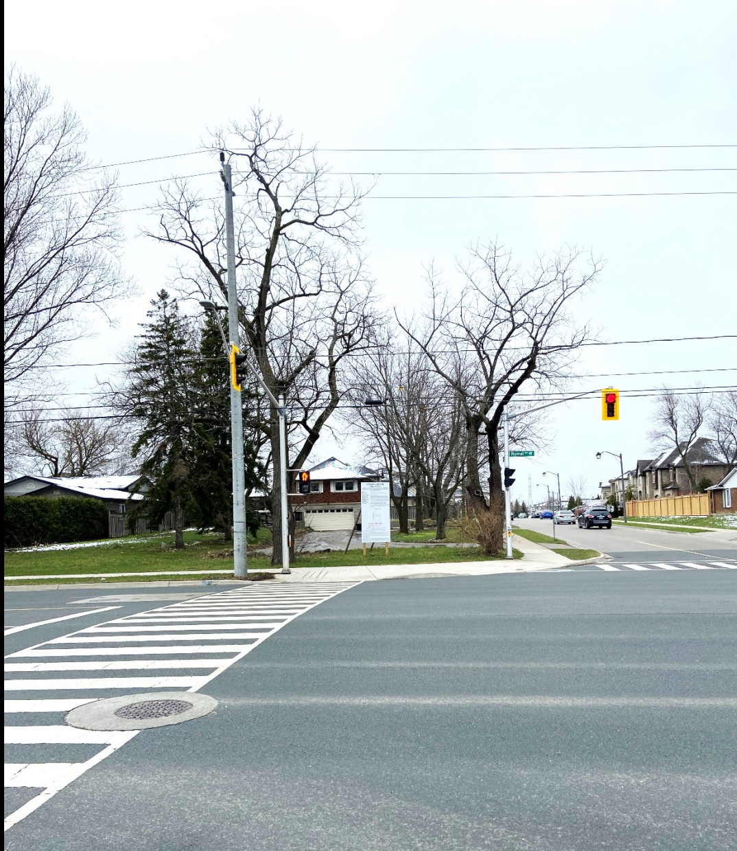
View of Subject Lands from north side of Rymal Road West