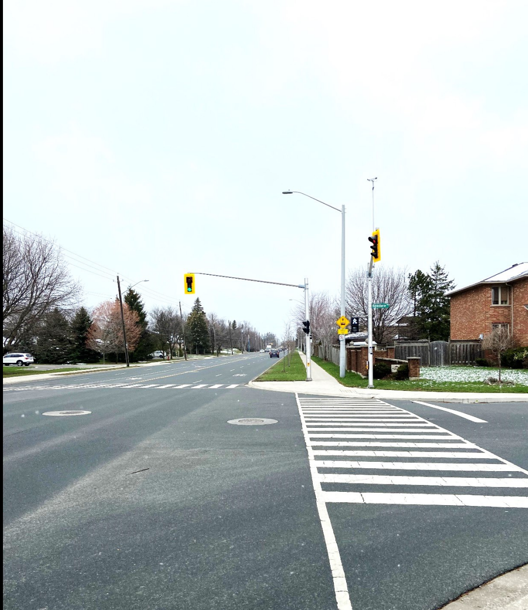
View looking west on Rymal Road West