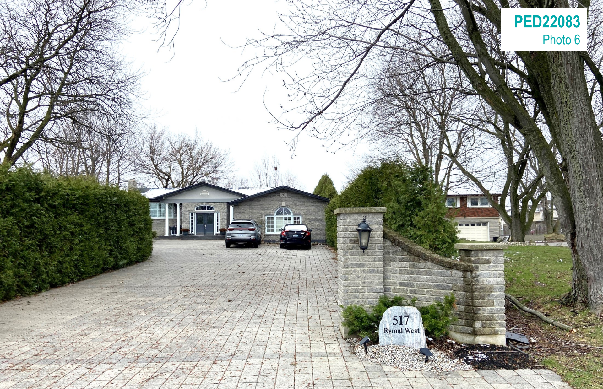
517 Rymal Road West