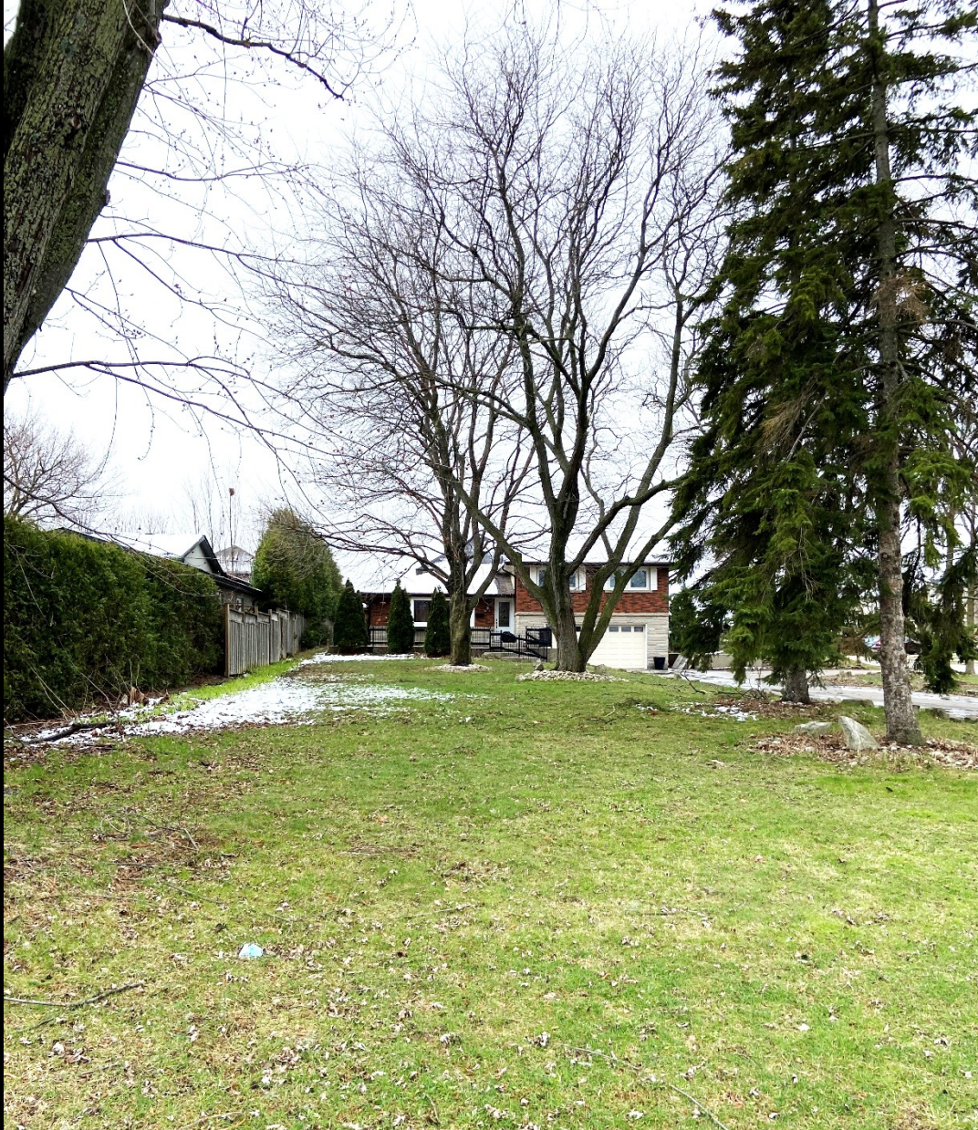
View of Subject Lands from south side of Rymal Road West