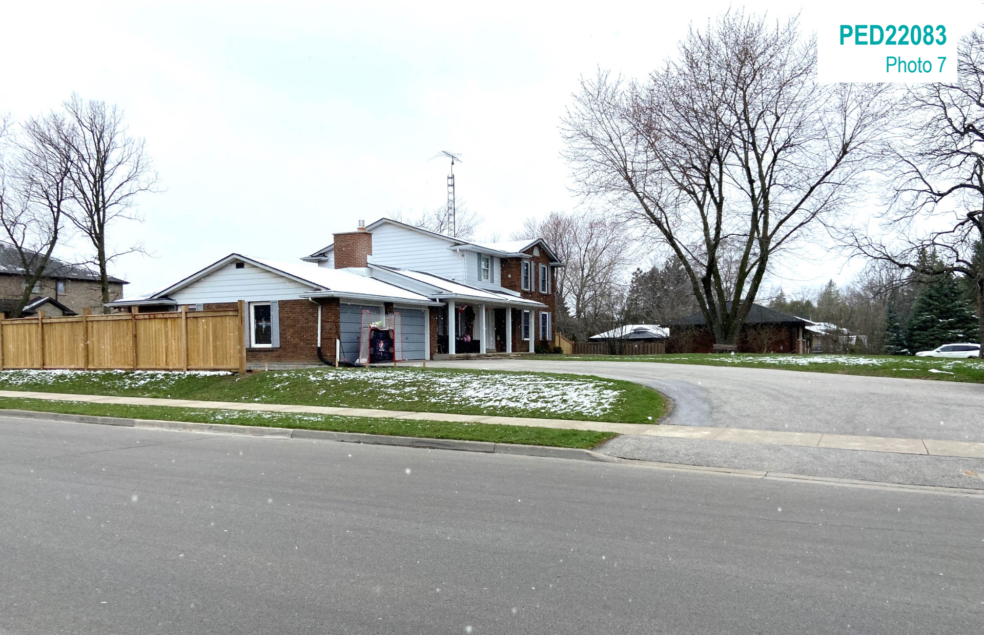
545 Rymal Road West