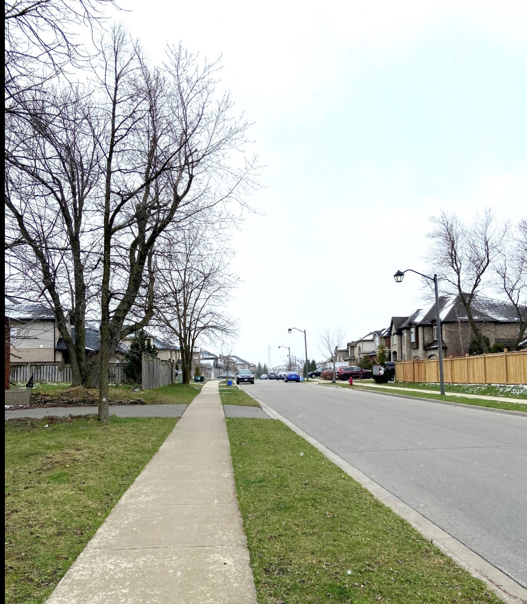
View looking south on Davinci Boulevard