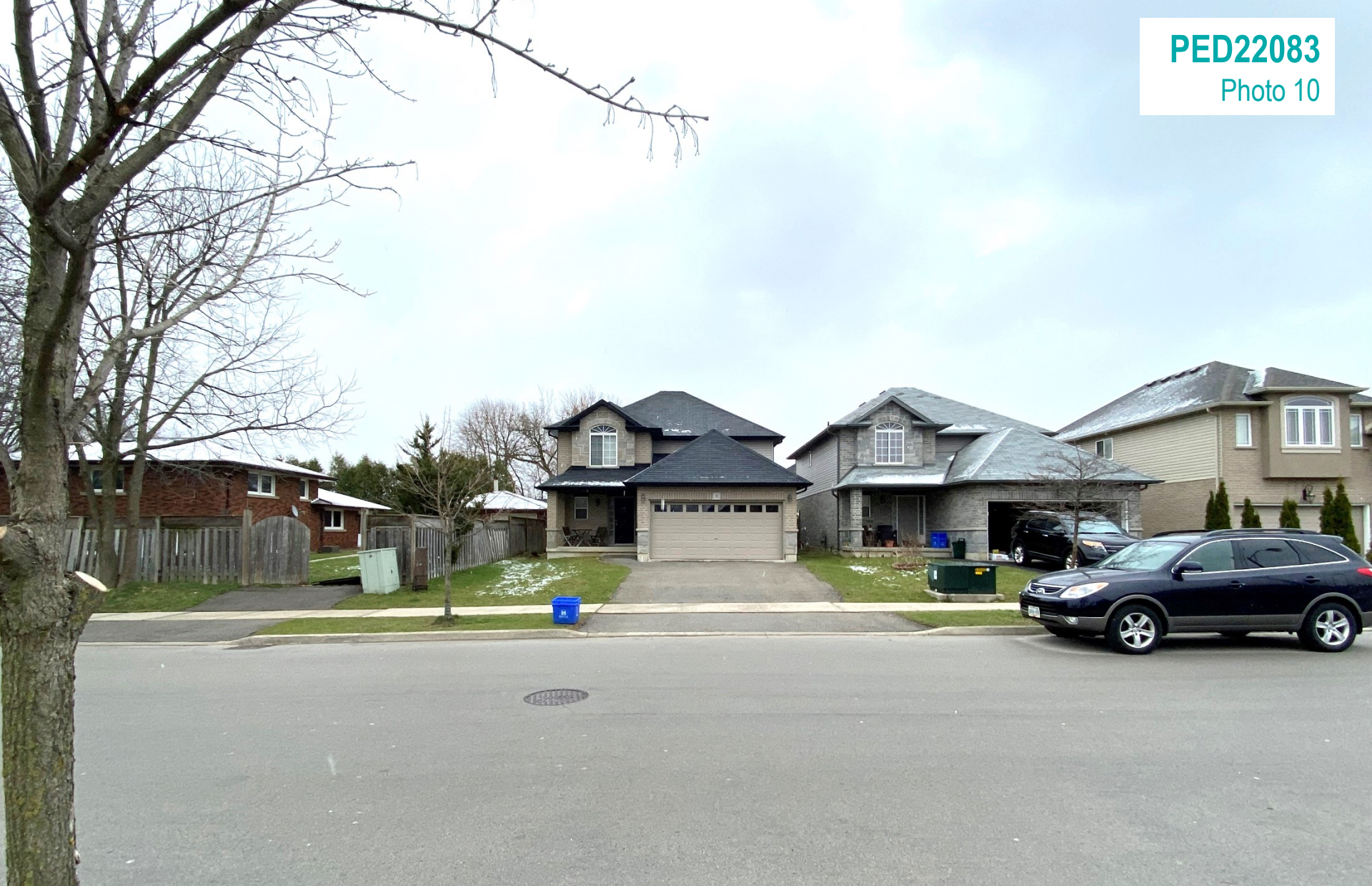
Properties to the south of Subject Lands on Davinci Boulevard