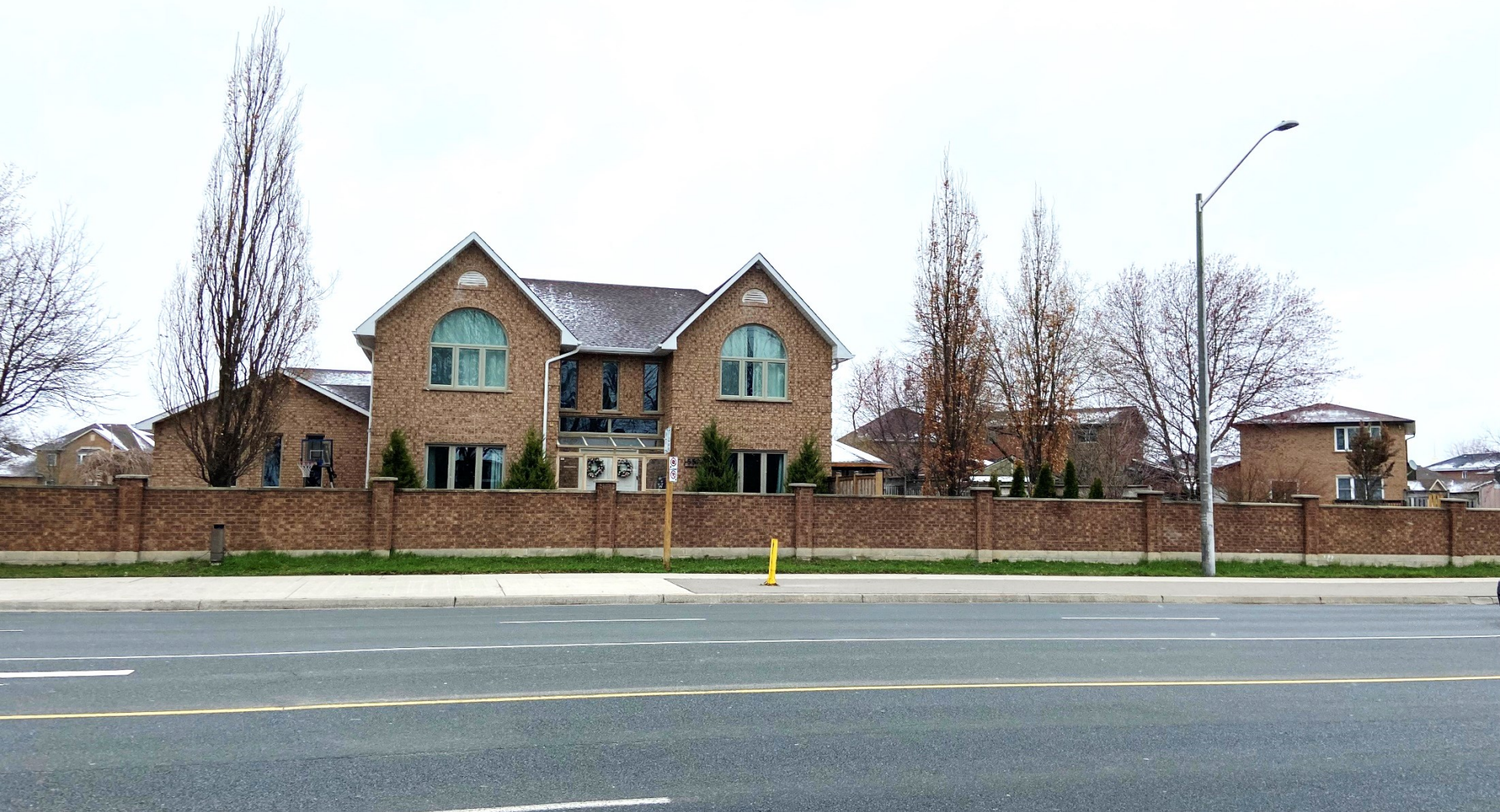
View looking north of Subject Lands