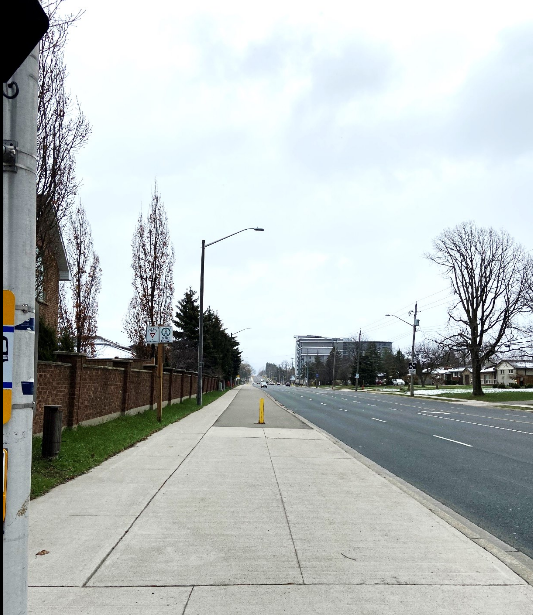
View looking east on Rymal Road West