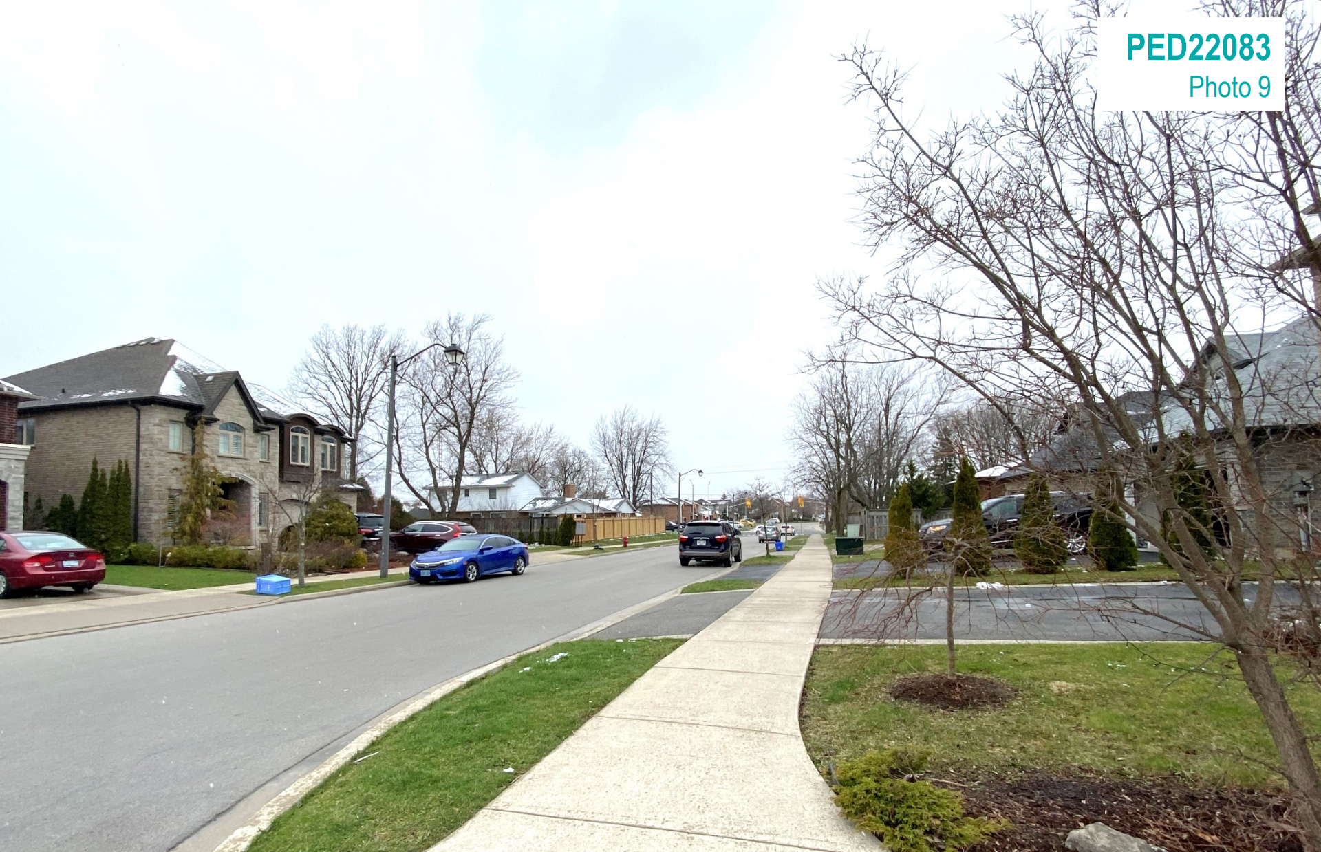
View looking north on Davinci Boulevard