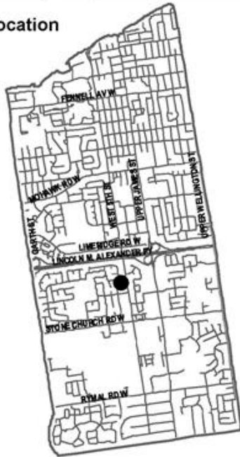
Key Map - Ward 8