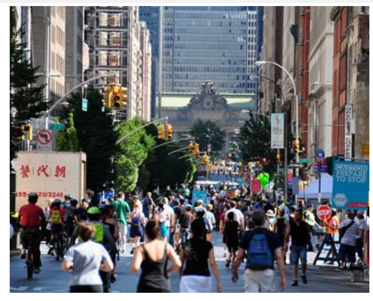
Open Streets in NYC