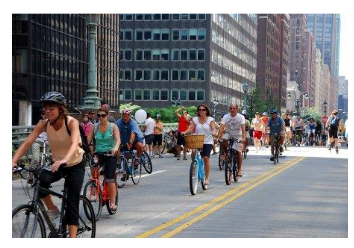
NYC Open Street