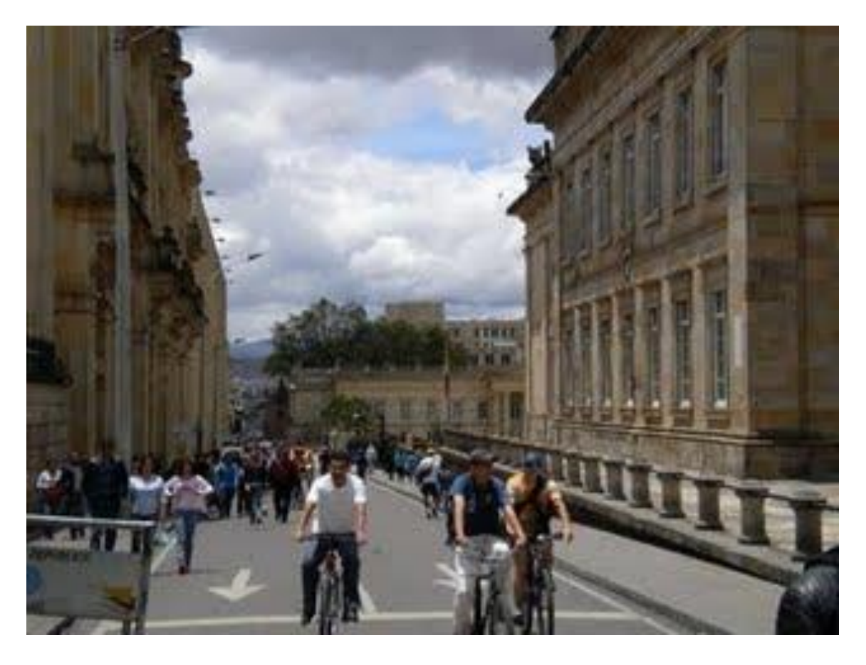
'Cyclovia' Open Street event in Bogota