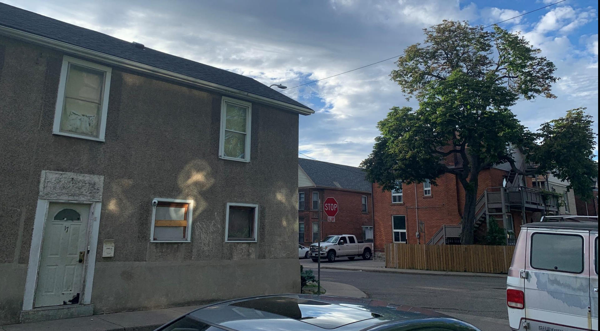
View looking west from the site on Steven Street