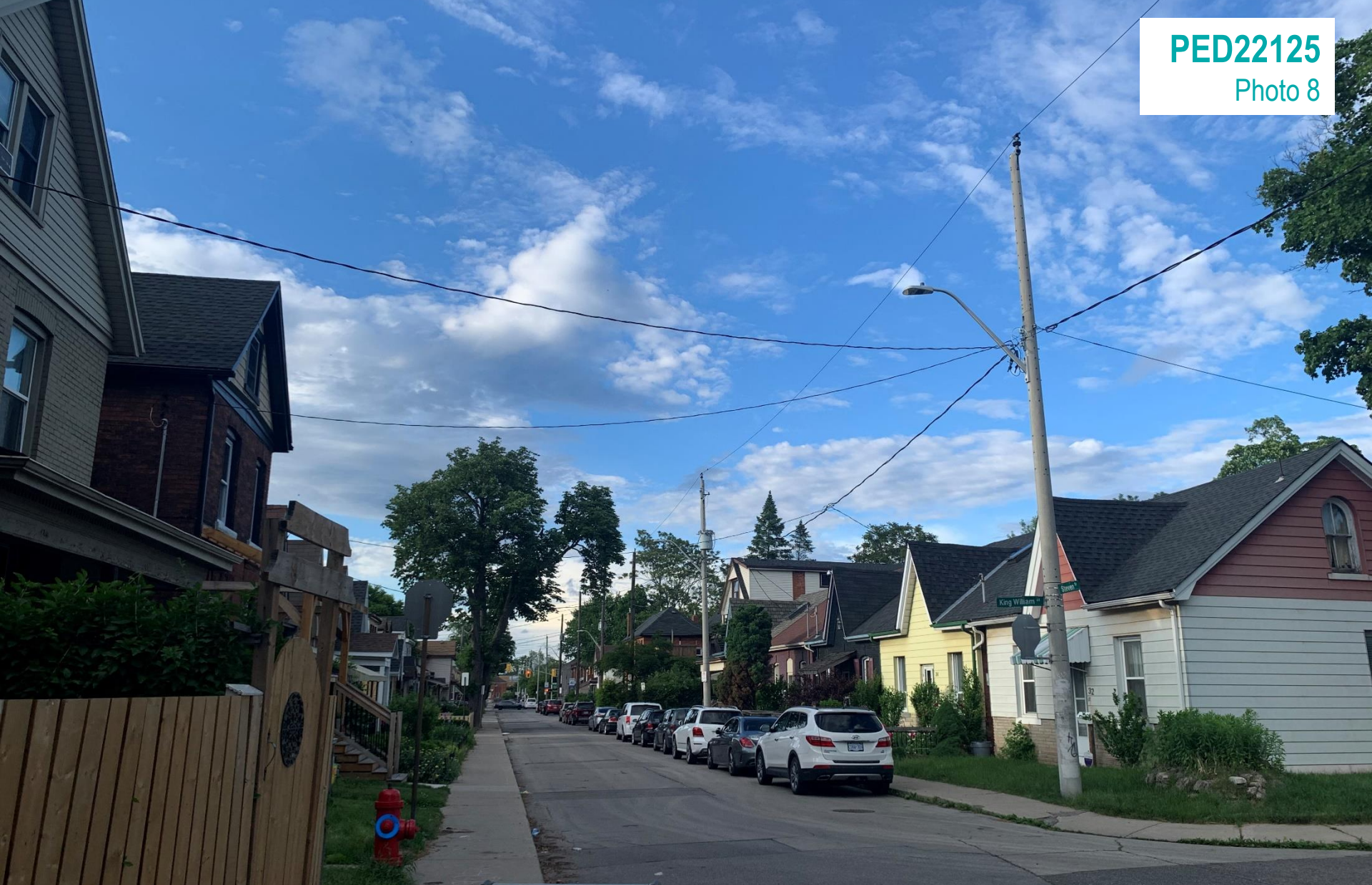
View looking north on Steven Street