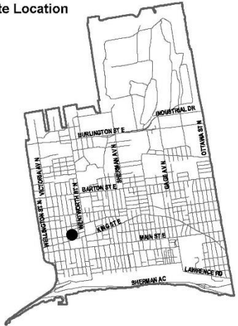
Key Map - Ward 3