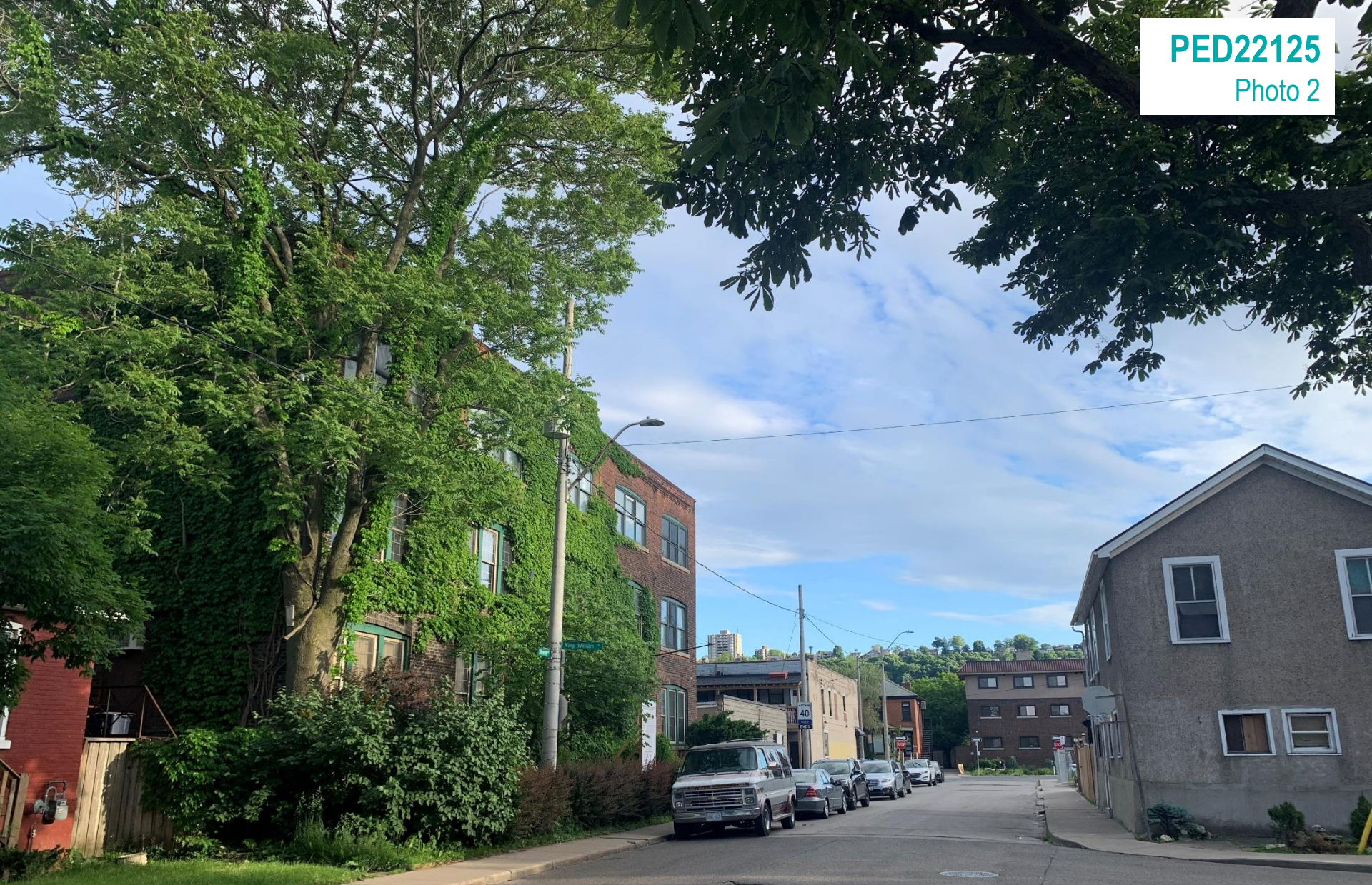
View of the site and surrounding area looking south on Steven Street