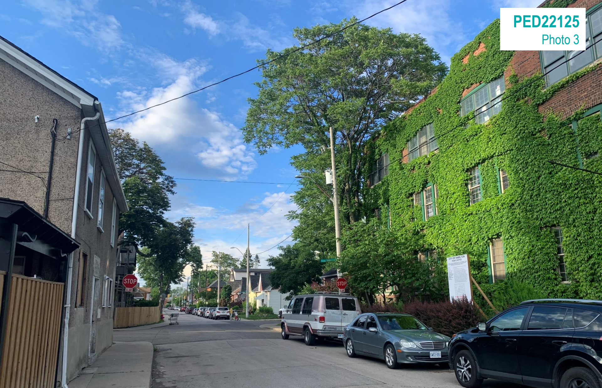
View of the site and surrounding area looking north on Steven Street