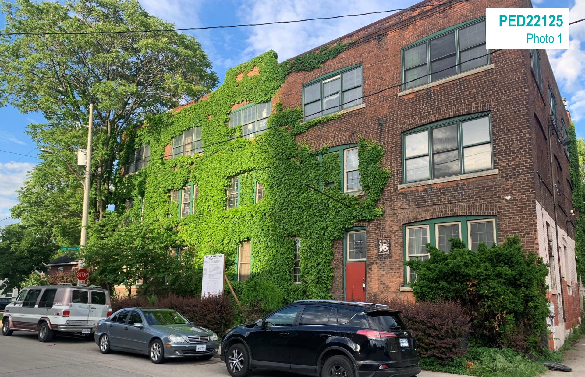
View of the site looking east from Steven Street