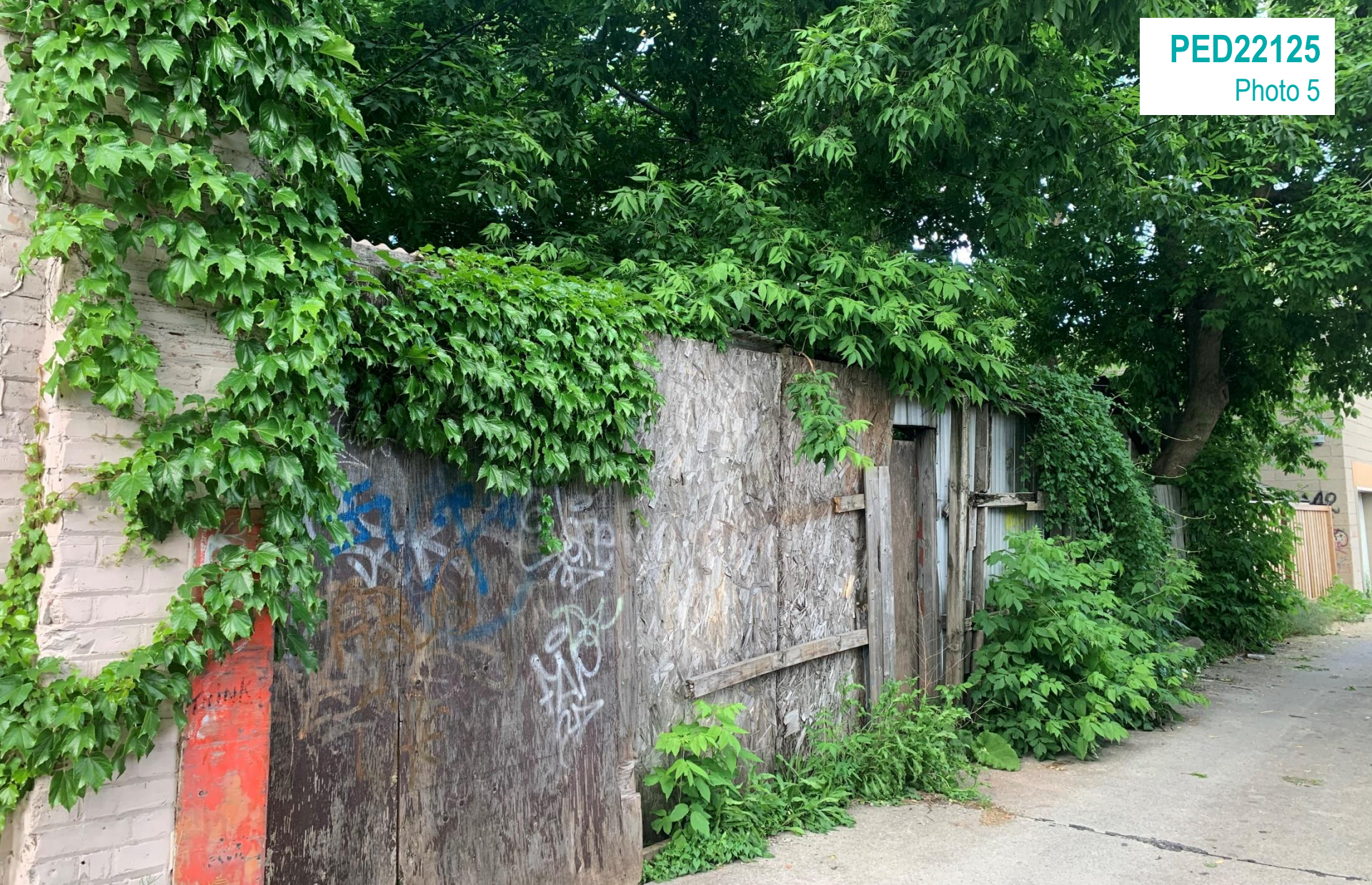
View of the rear of site looking north from the alleyway