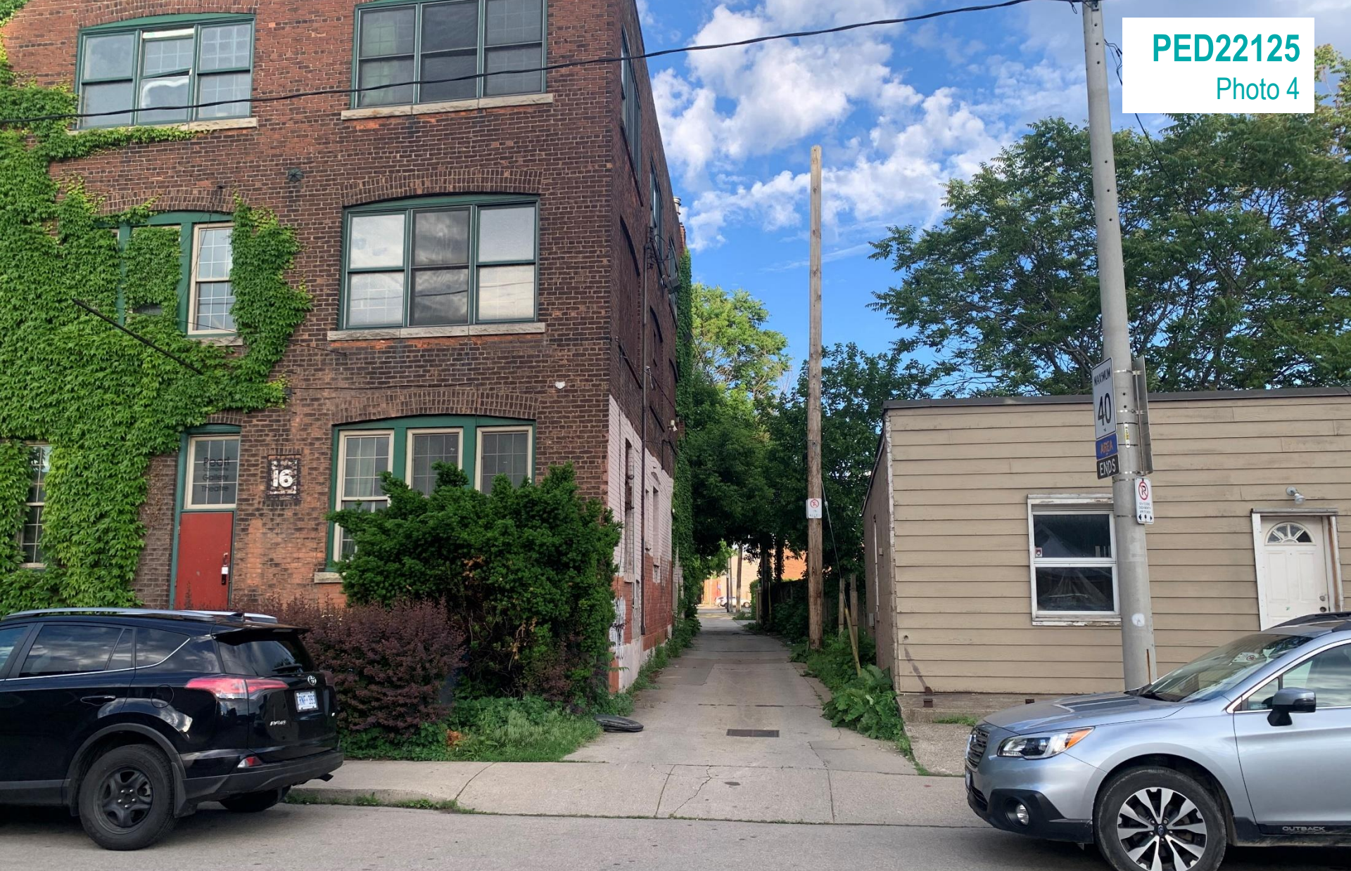
View of adjacent alleyway looking east on Steven Street