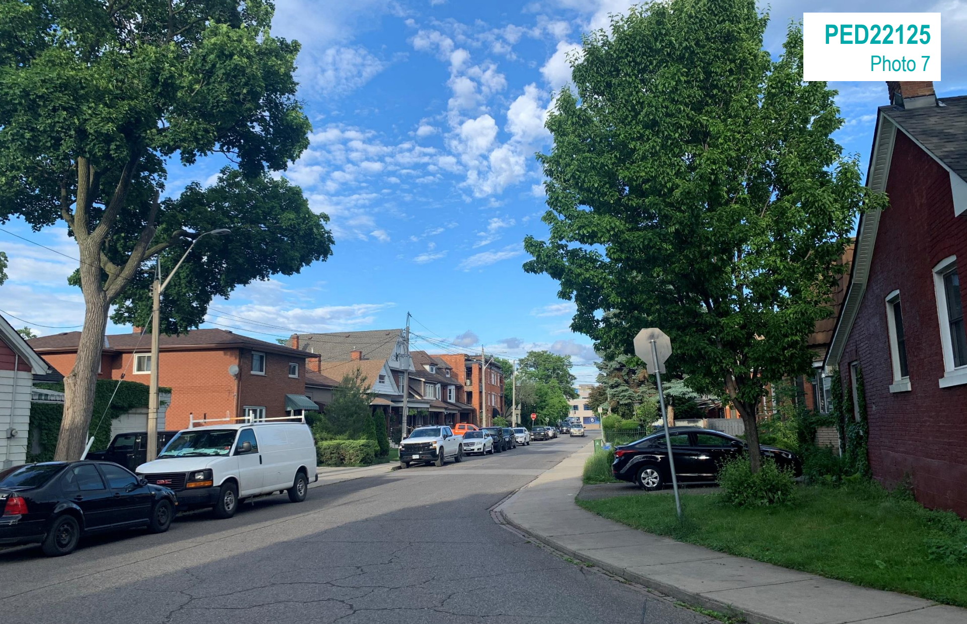
View looking east on King William Street