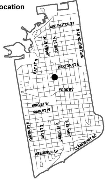
Key Map - Ward 2