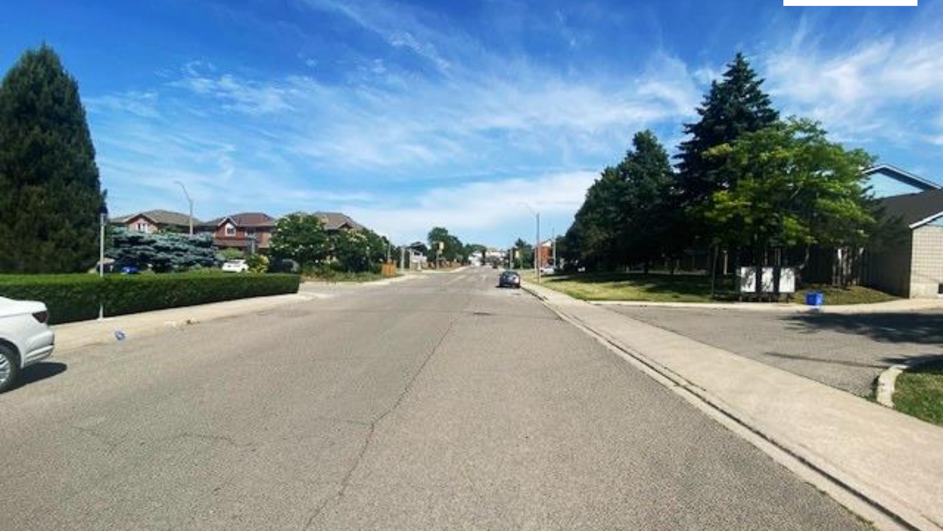
1540 Upper Wentworth - Facing East (from Emperor Avenue)