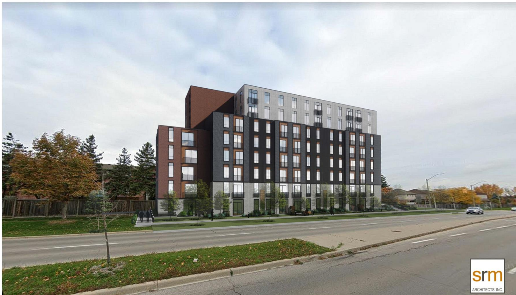
Upper Wentworth looking Northwest