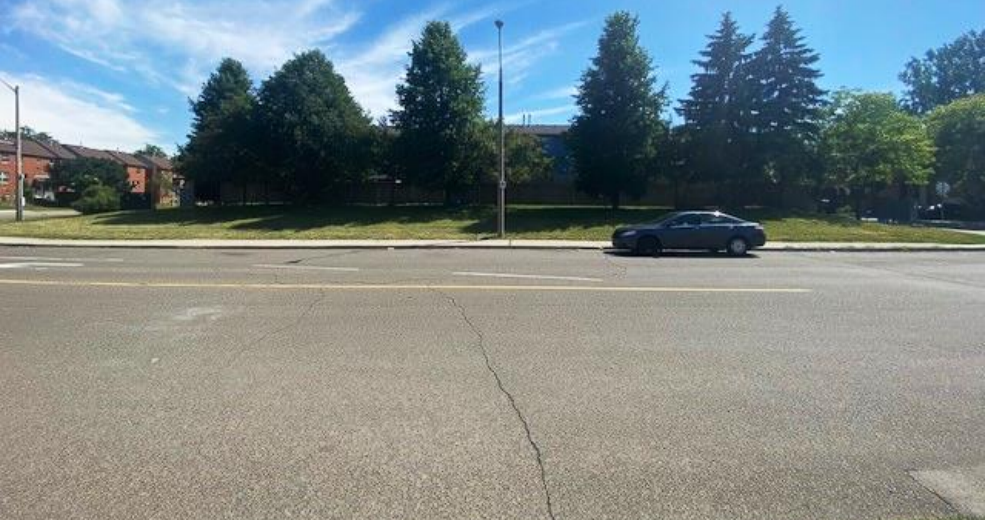
1540 Upper Wentworth - Facing South (from Emperor Avenue)