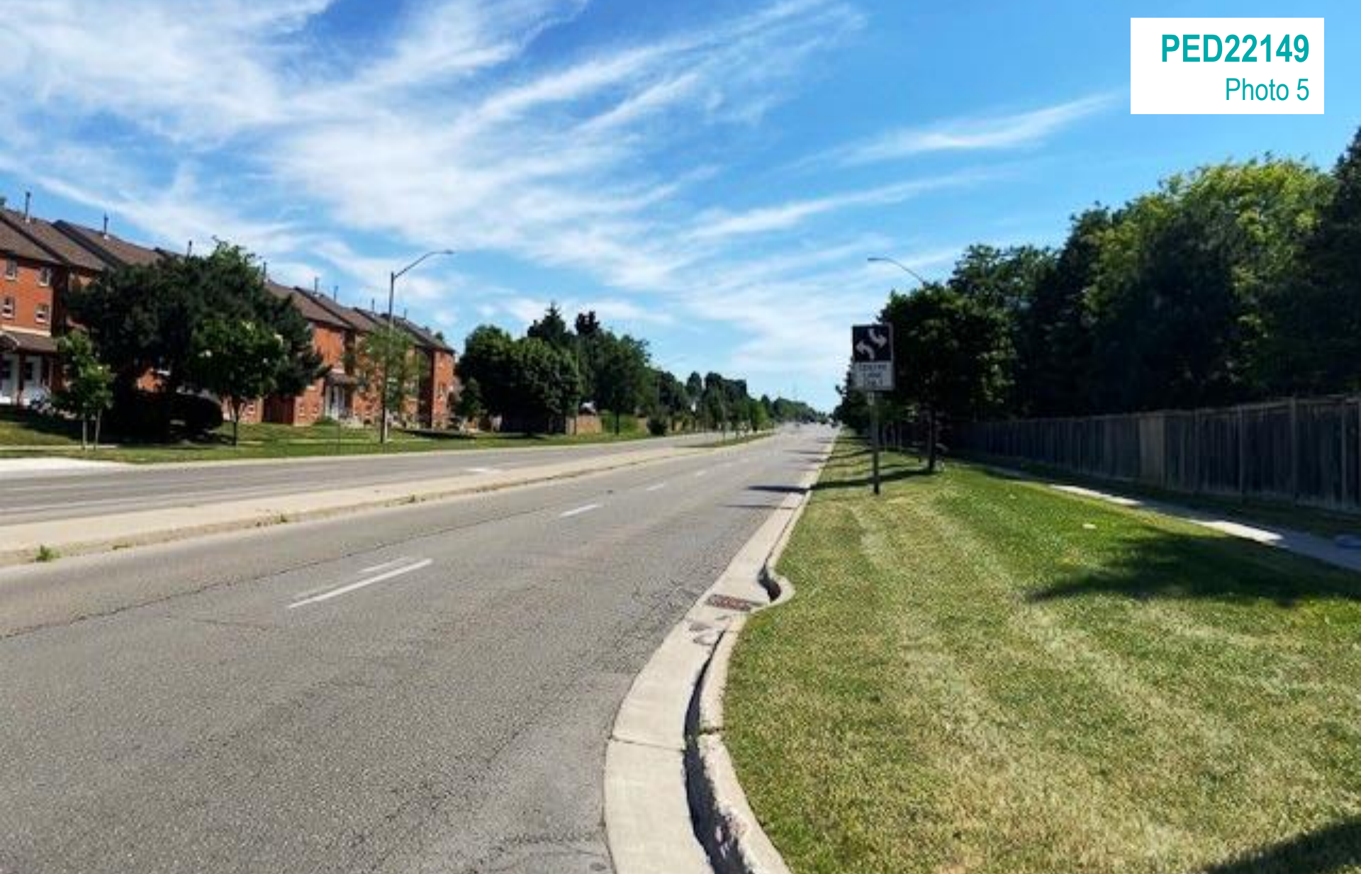
1540 Upper Wentworth - Facing South (from Upper Wentworth Street)