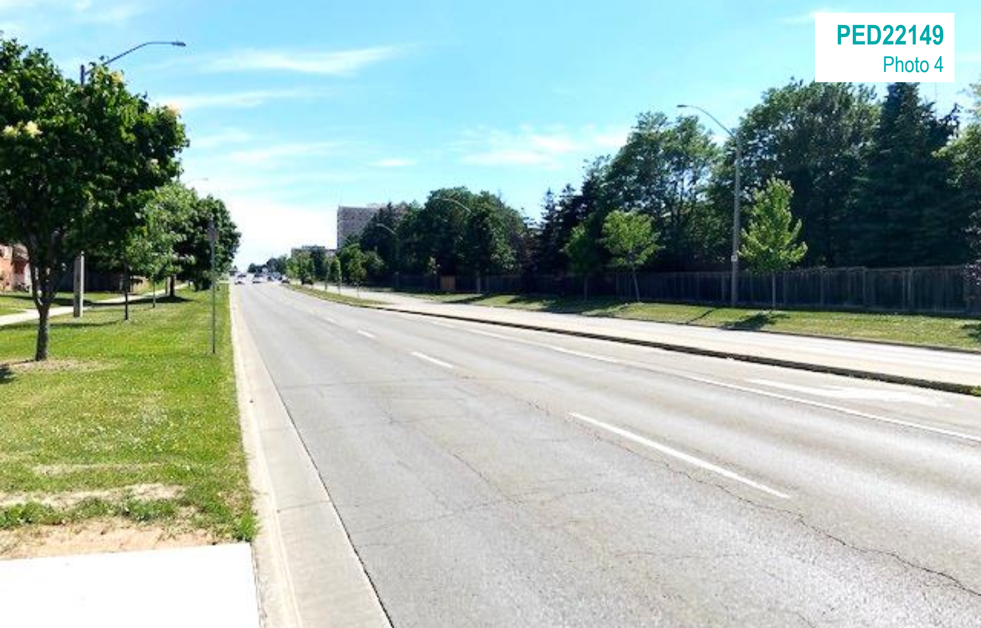
1540 Upper Wentworth - Facing South (from Upper Wentworth Street)