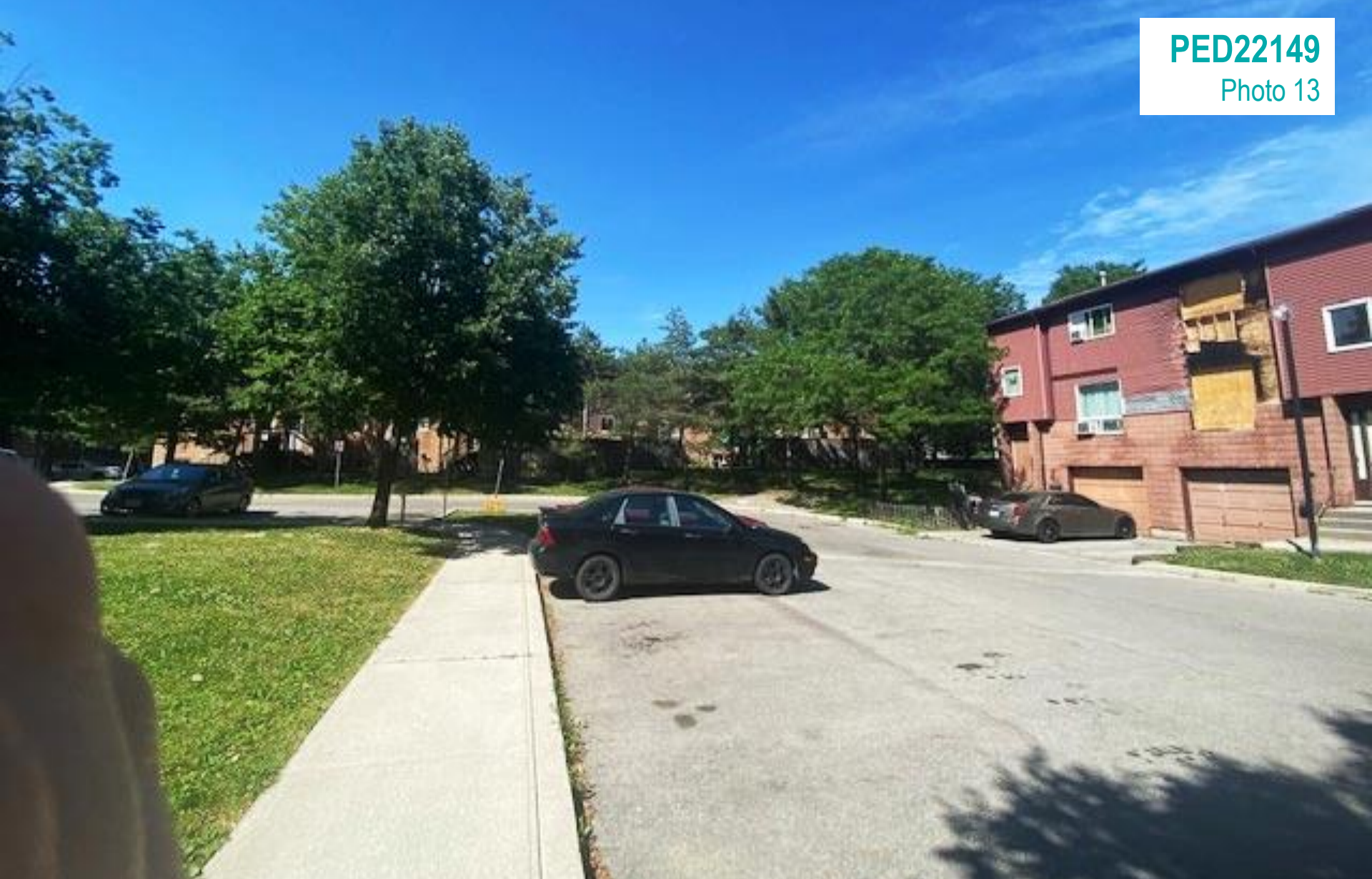
1540 Upper Wentworth - Facing Development Area (North)