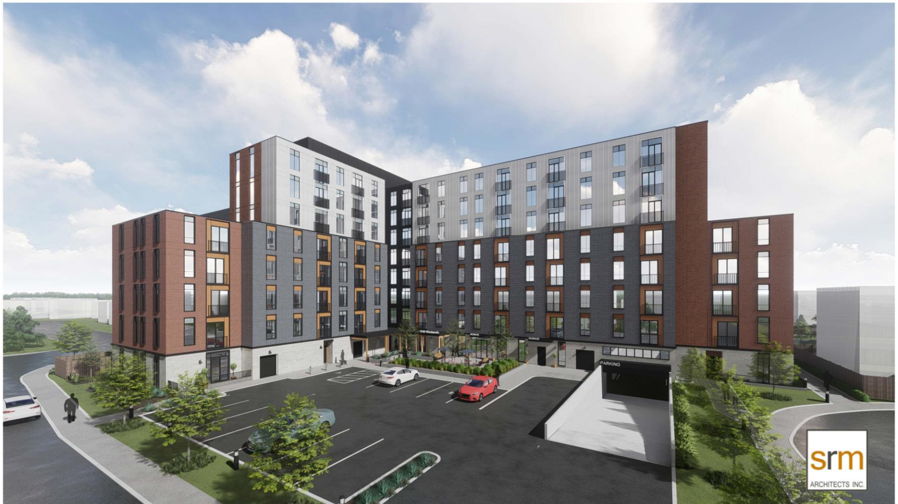
Existing side road looking Northeast