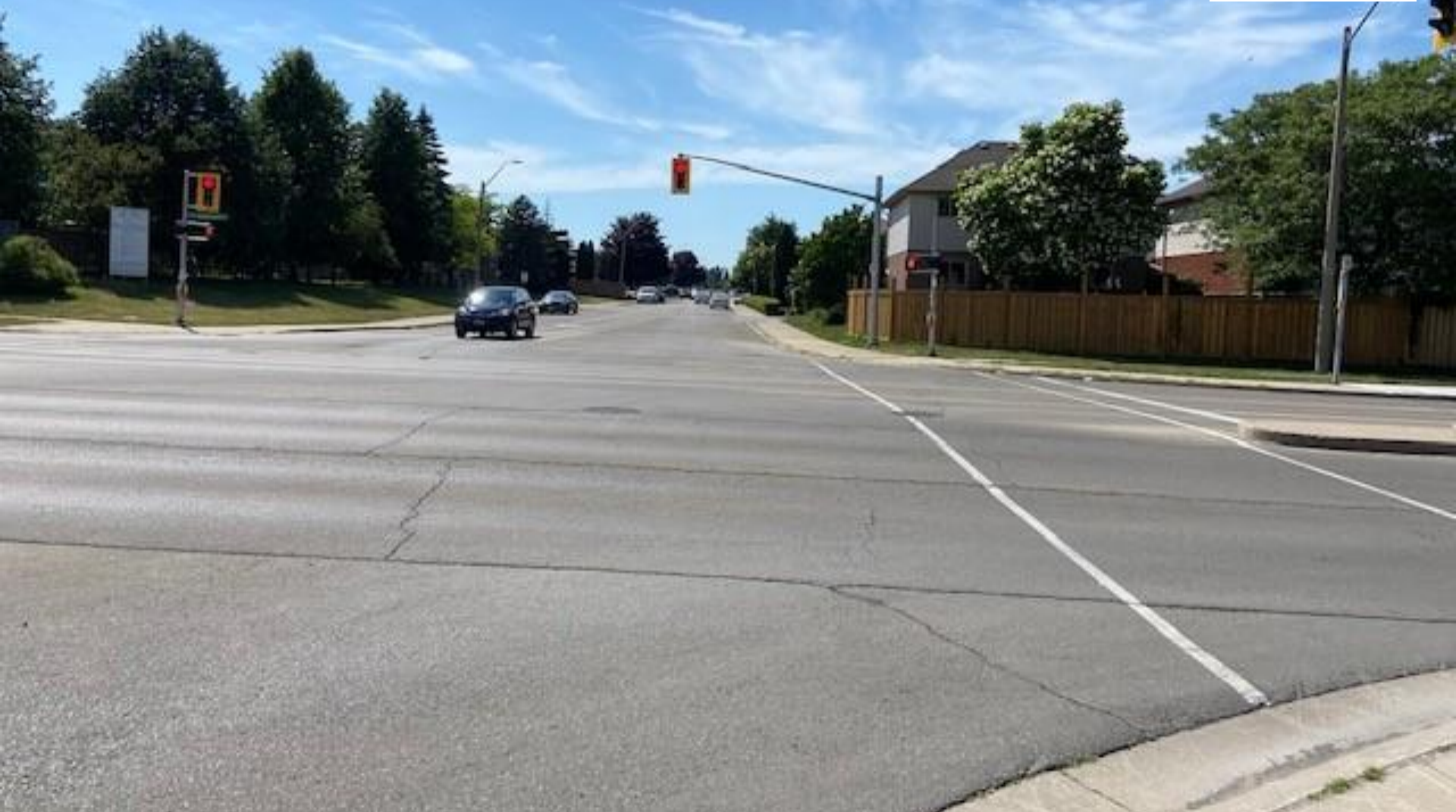
1540 Upper Wentworth - Facing West (from Upper Wentworth Street)