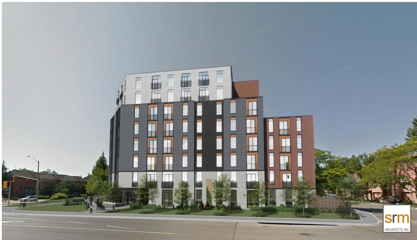
Emperor Avenue looking Southeast