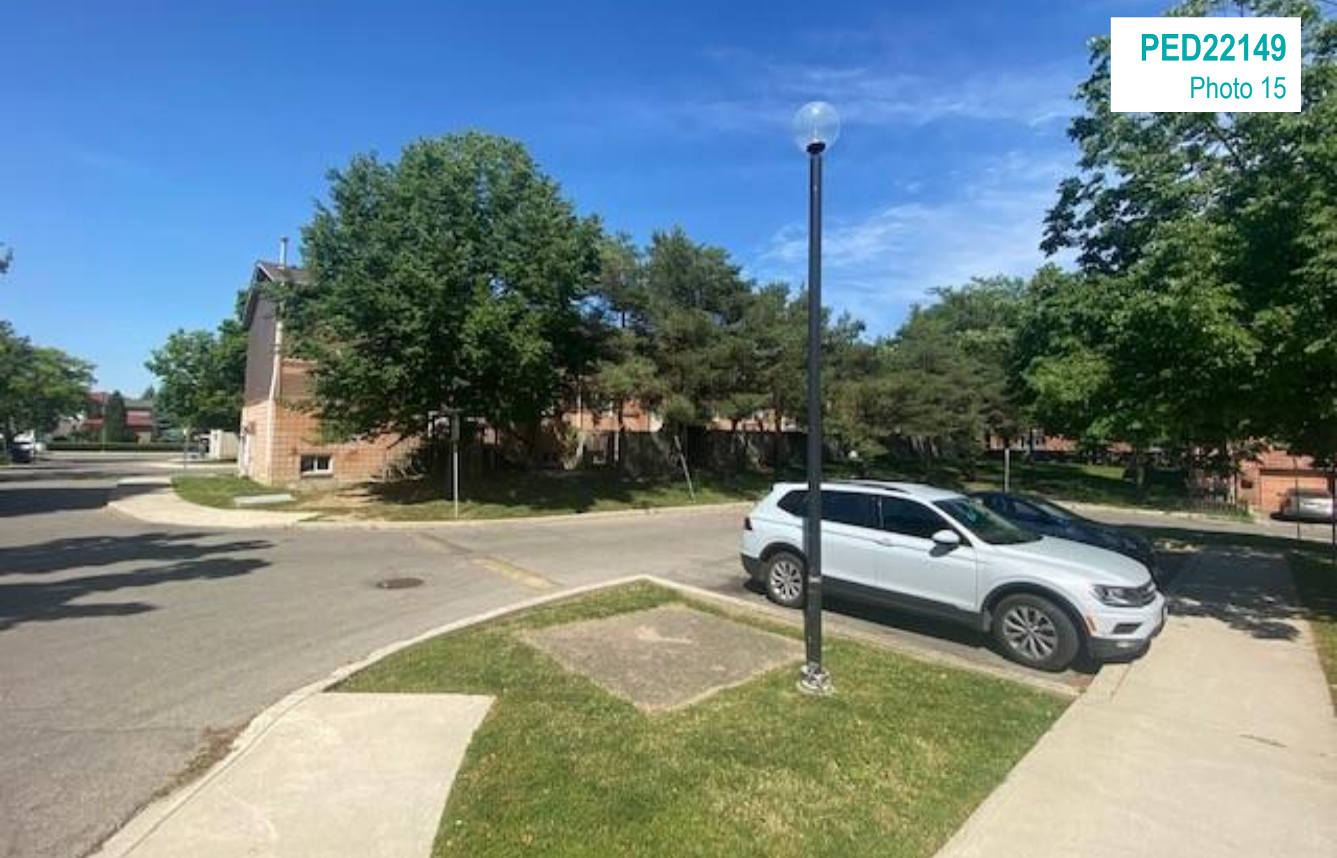
1540 Upper Wentworth - Facing Development Area (Southeast)