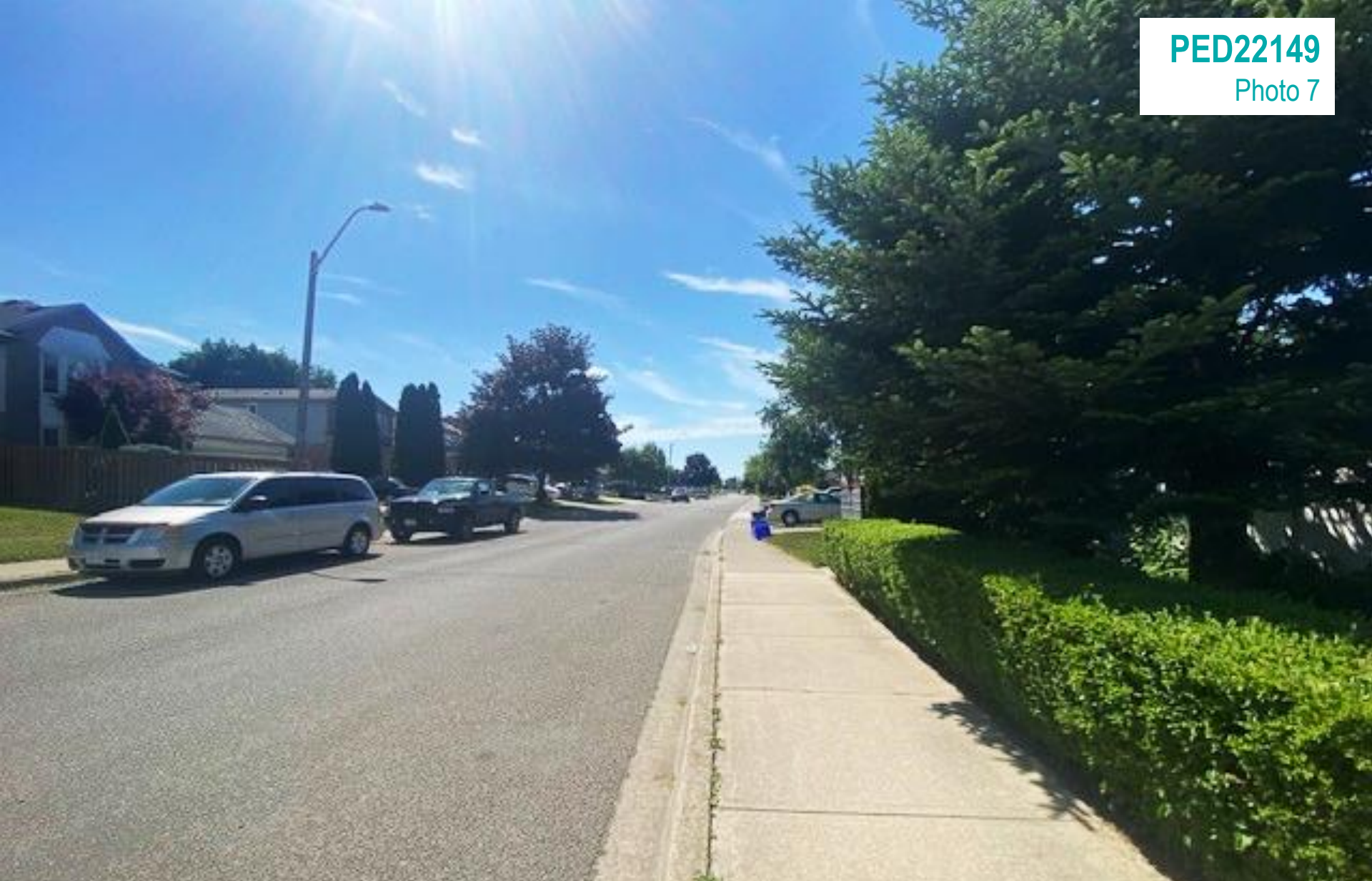
1540 Upper Wentworth - Facing West (from Emperor Avenue)