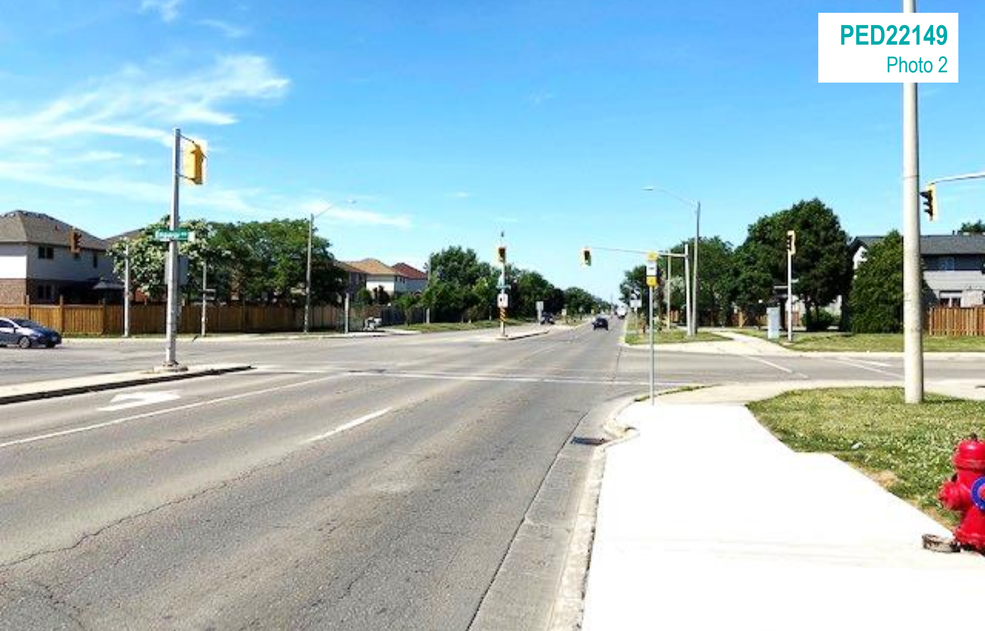
1540 Upper Wentworth - Facing North (from Upper Wentworth Street)