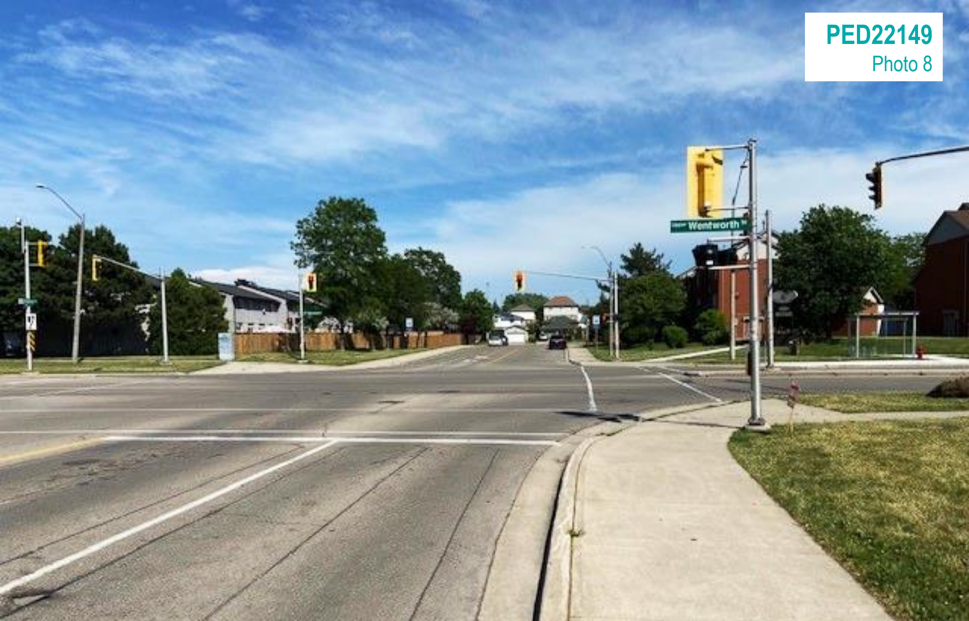
1540 Upper Wentworth - Facing East (from Emperor Avenue)