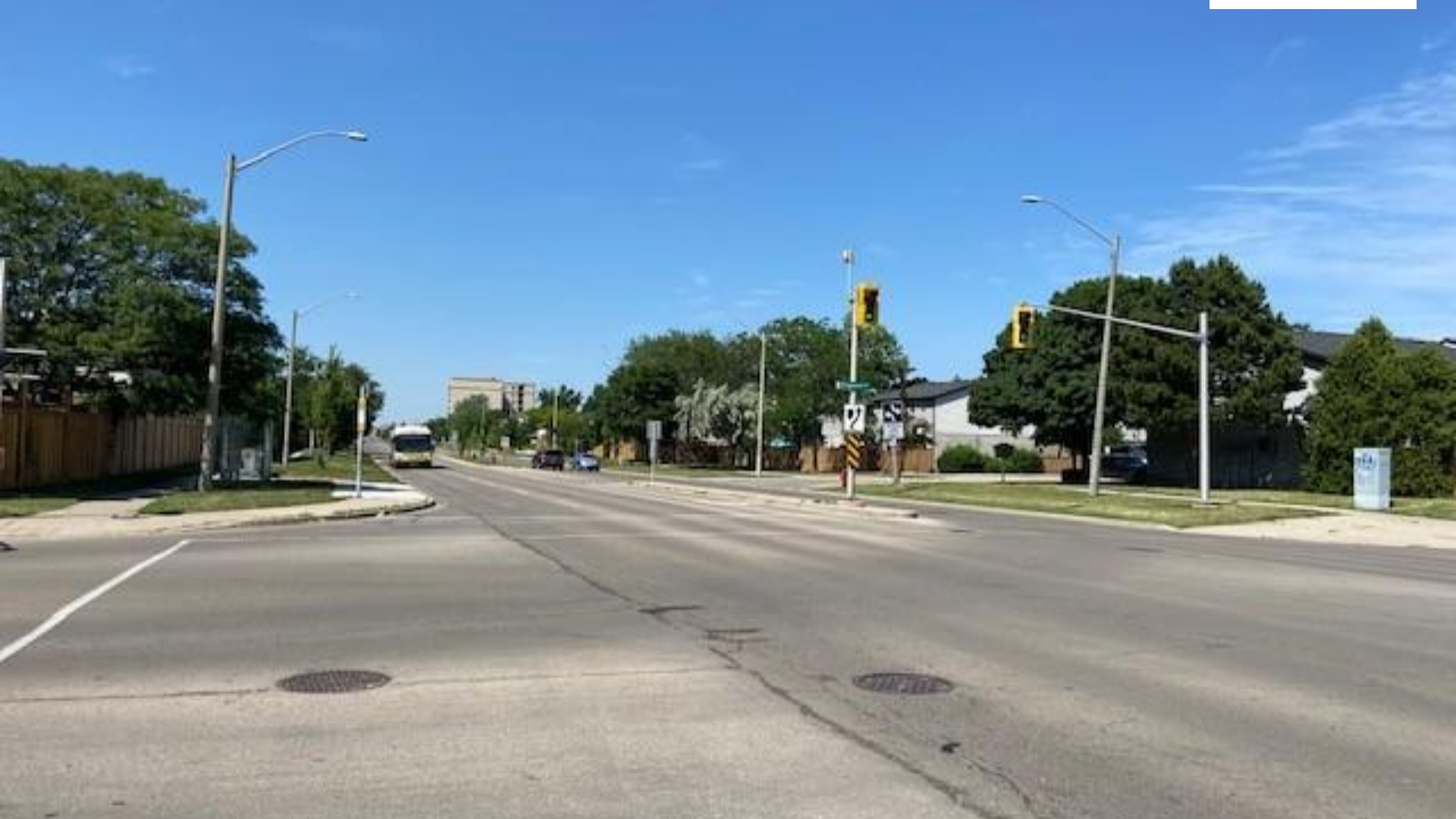
1540 Upper Wentworth - Facing North (from Upper Wentworth Street)