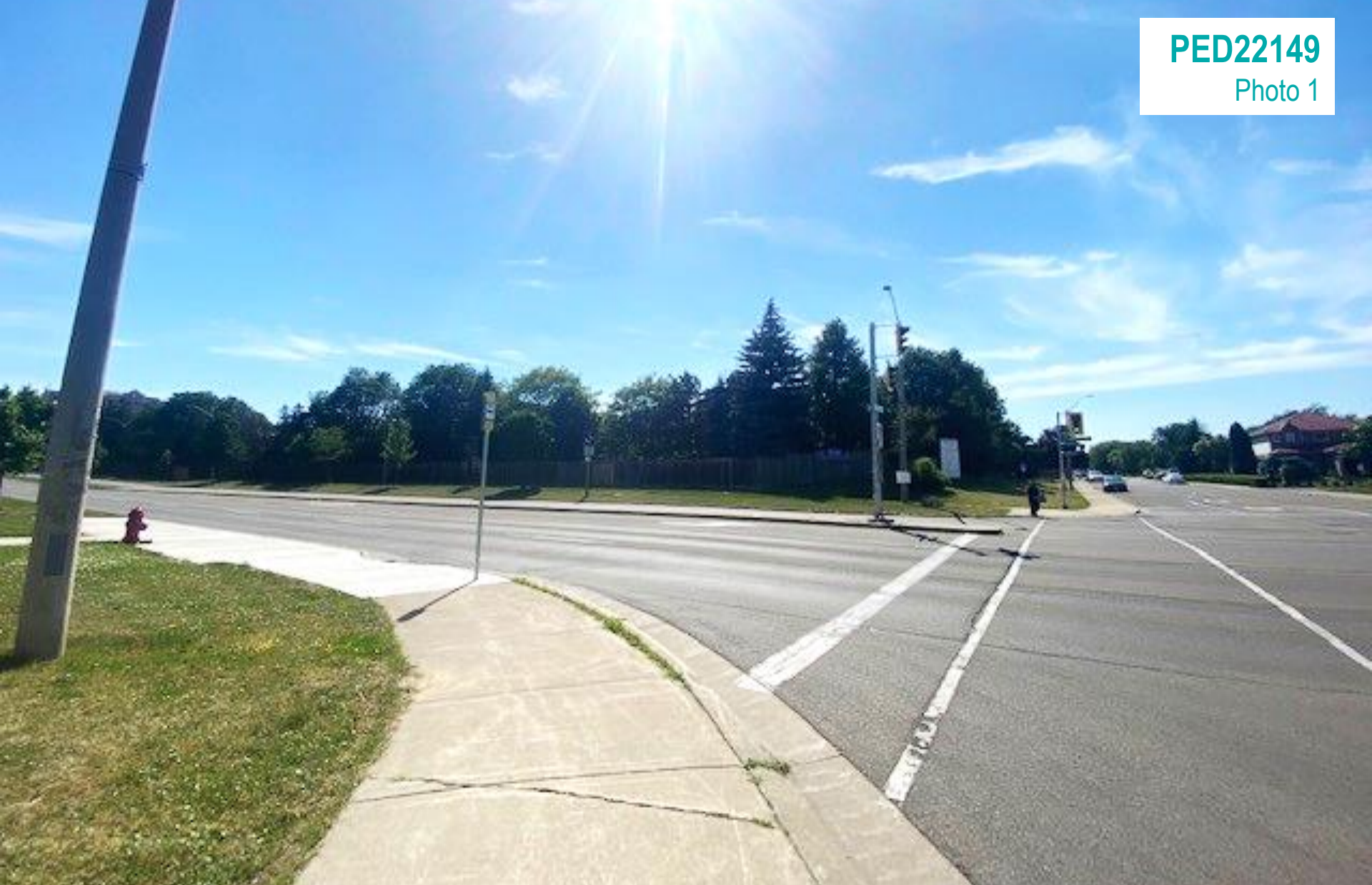
1540 Upper Wentworth - Facing Southwest (from Upper Wentworth Street)