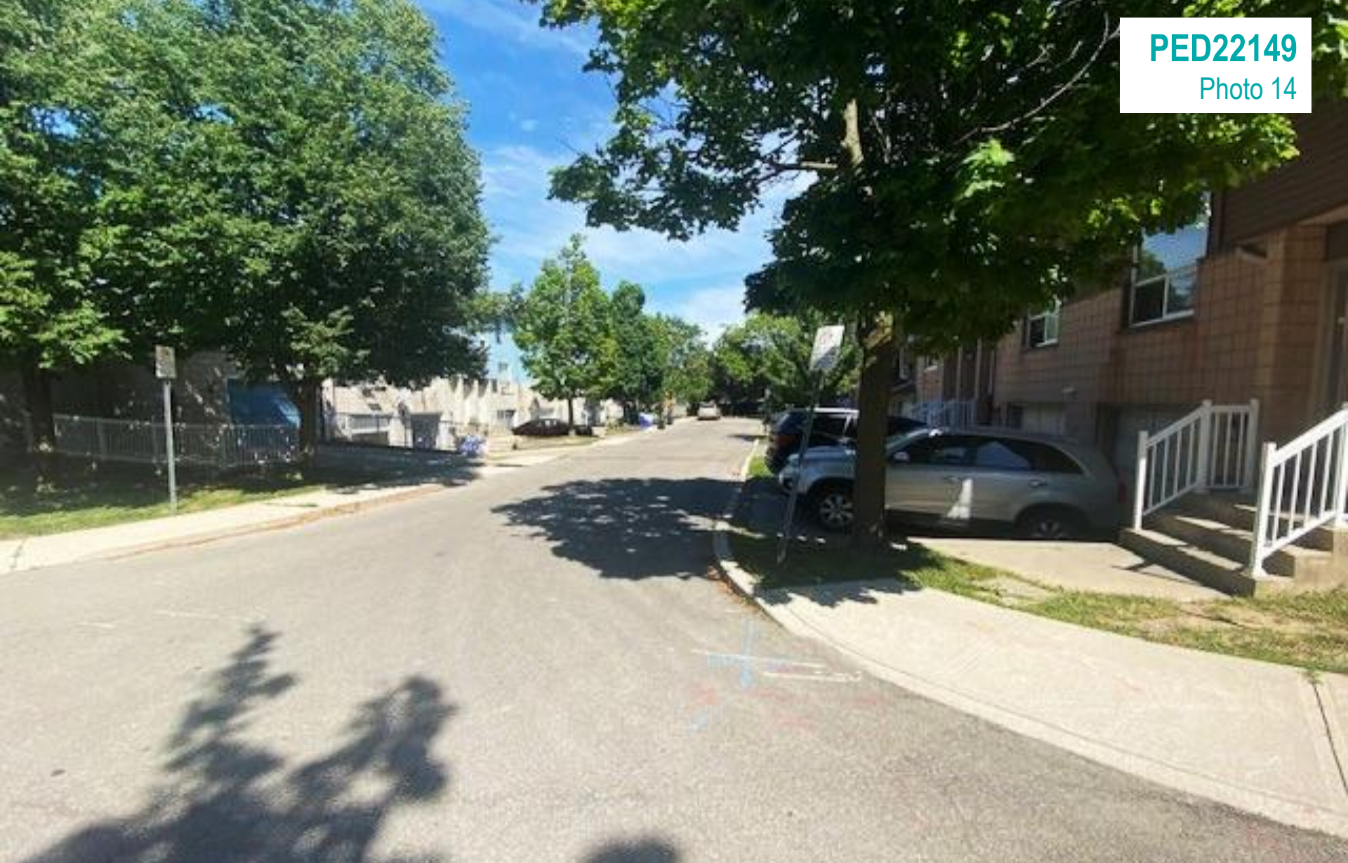
1540 Upper Wentworth - Facing Development Area (East)