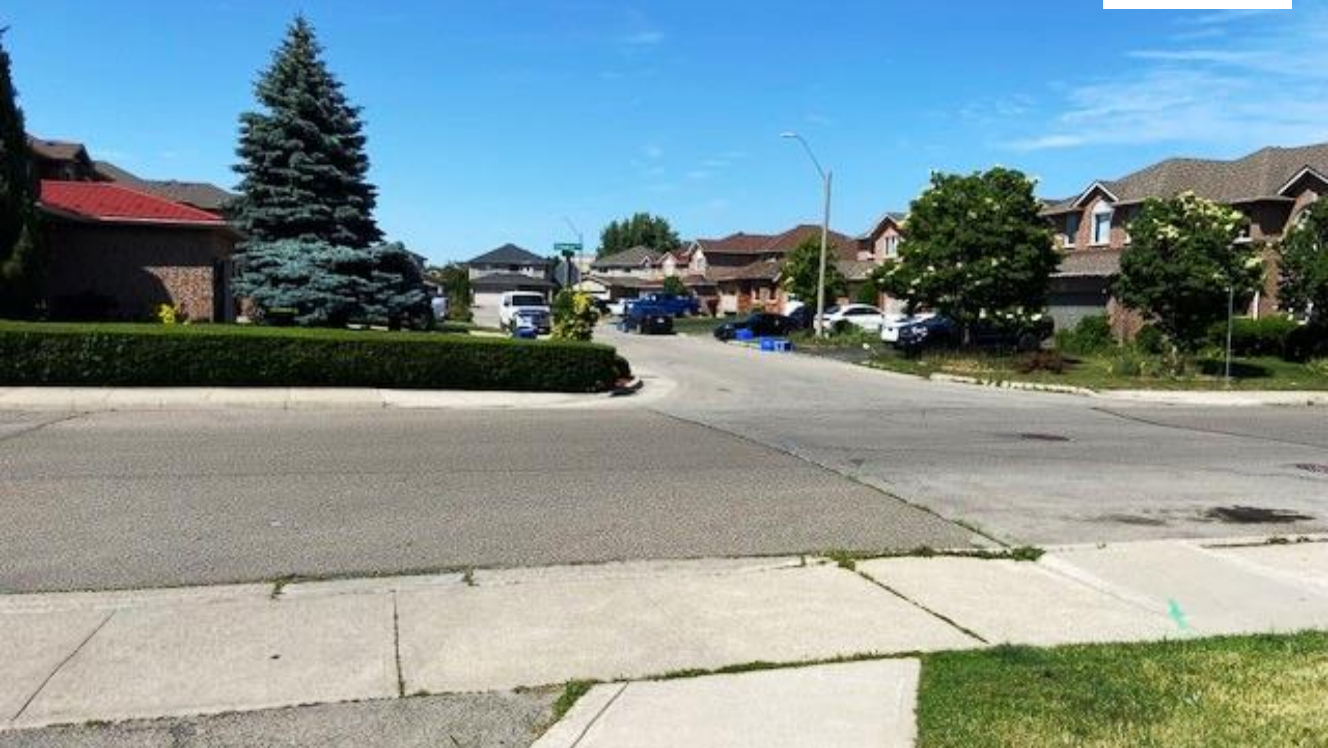
1540 Upper Wentworth - Facing North (from Emperor Avenue)