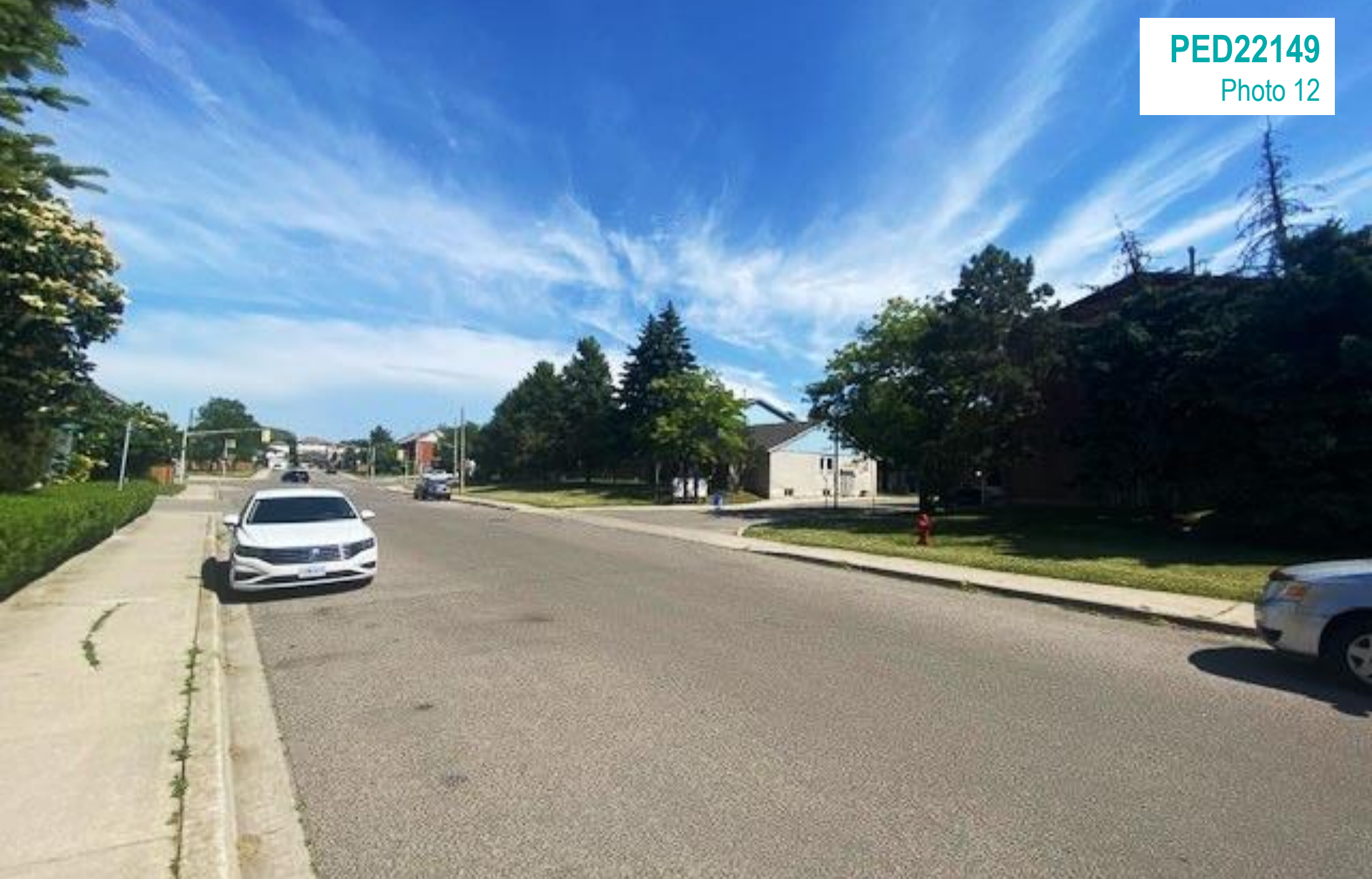
1540 Upper Wentworth - Facing Northeast (from Emperor Avenue)