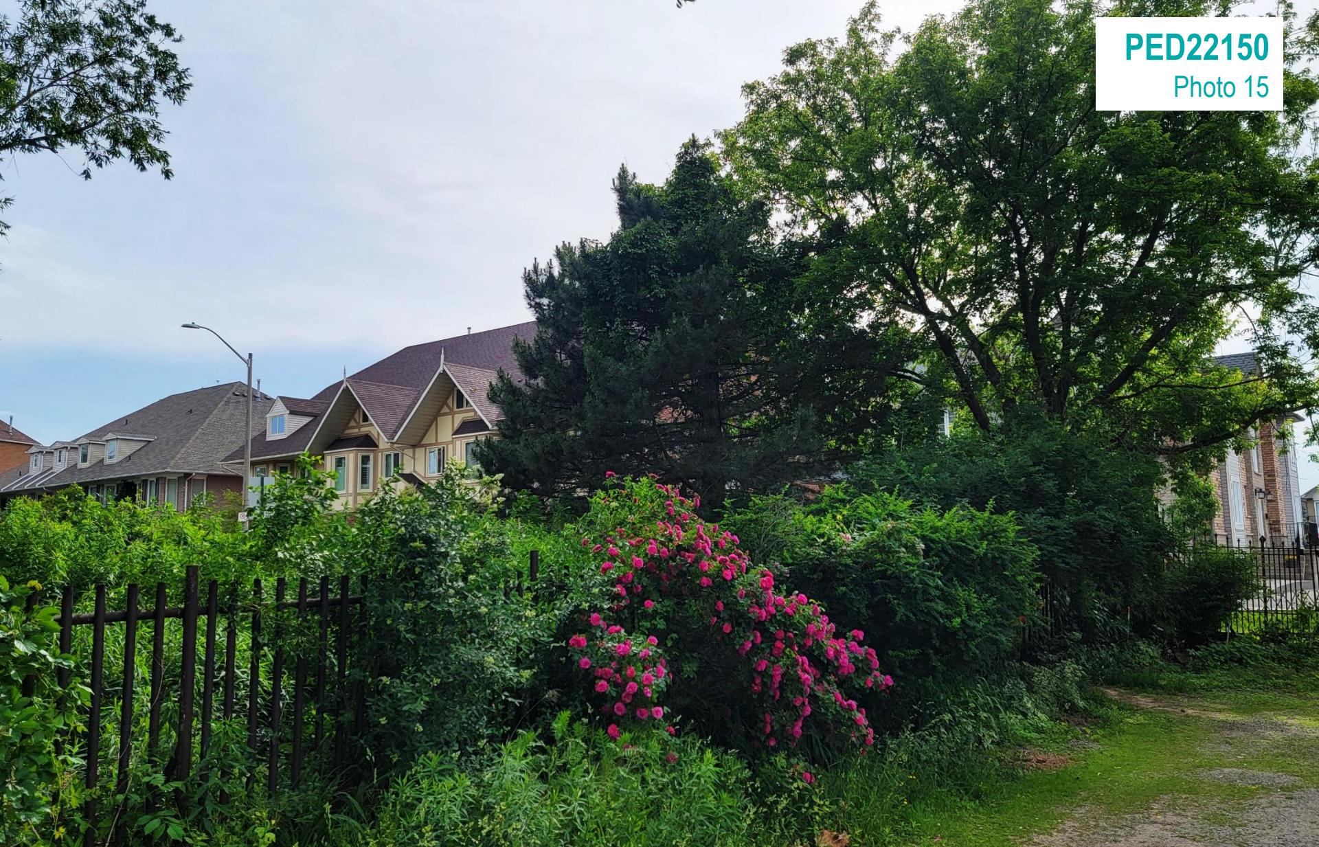
View towards Sunvale Place from Lakeside Drive