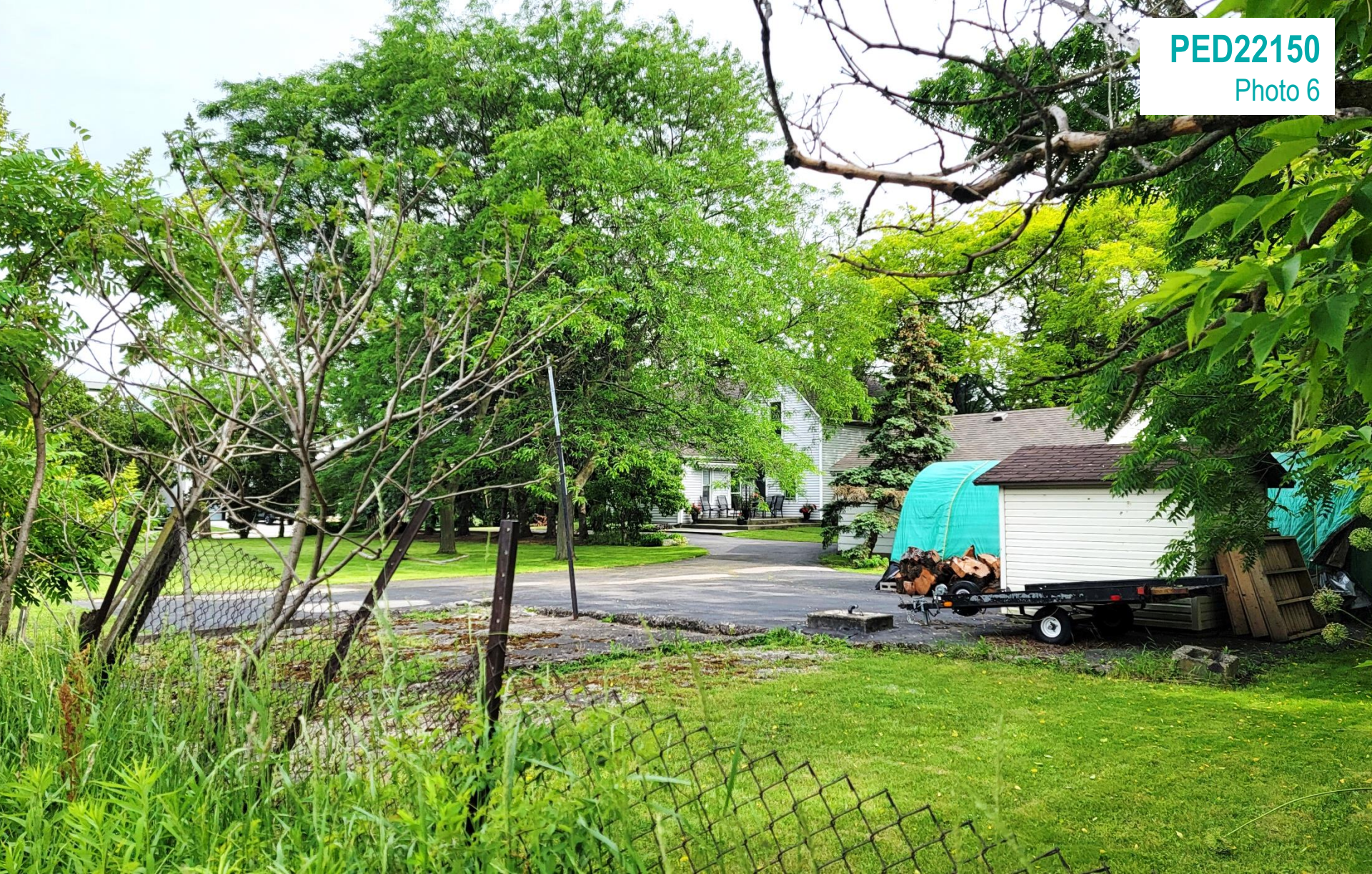
Existing development to east on lands at 515 Jones Road