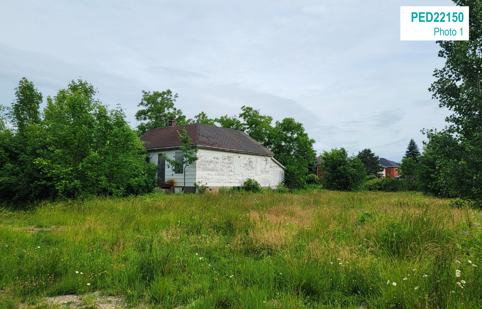
Existing single detached dwelling located on Subject Lands