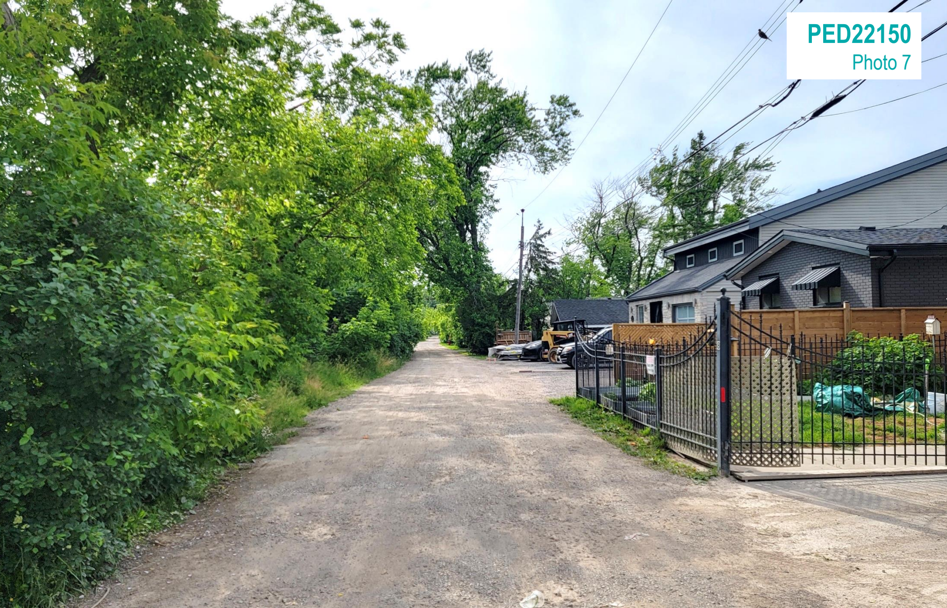
View of Subject Lands from the east along Lakeside Drive