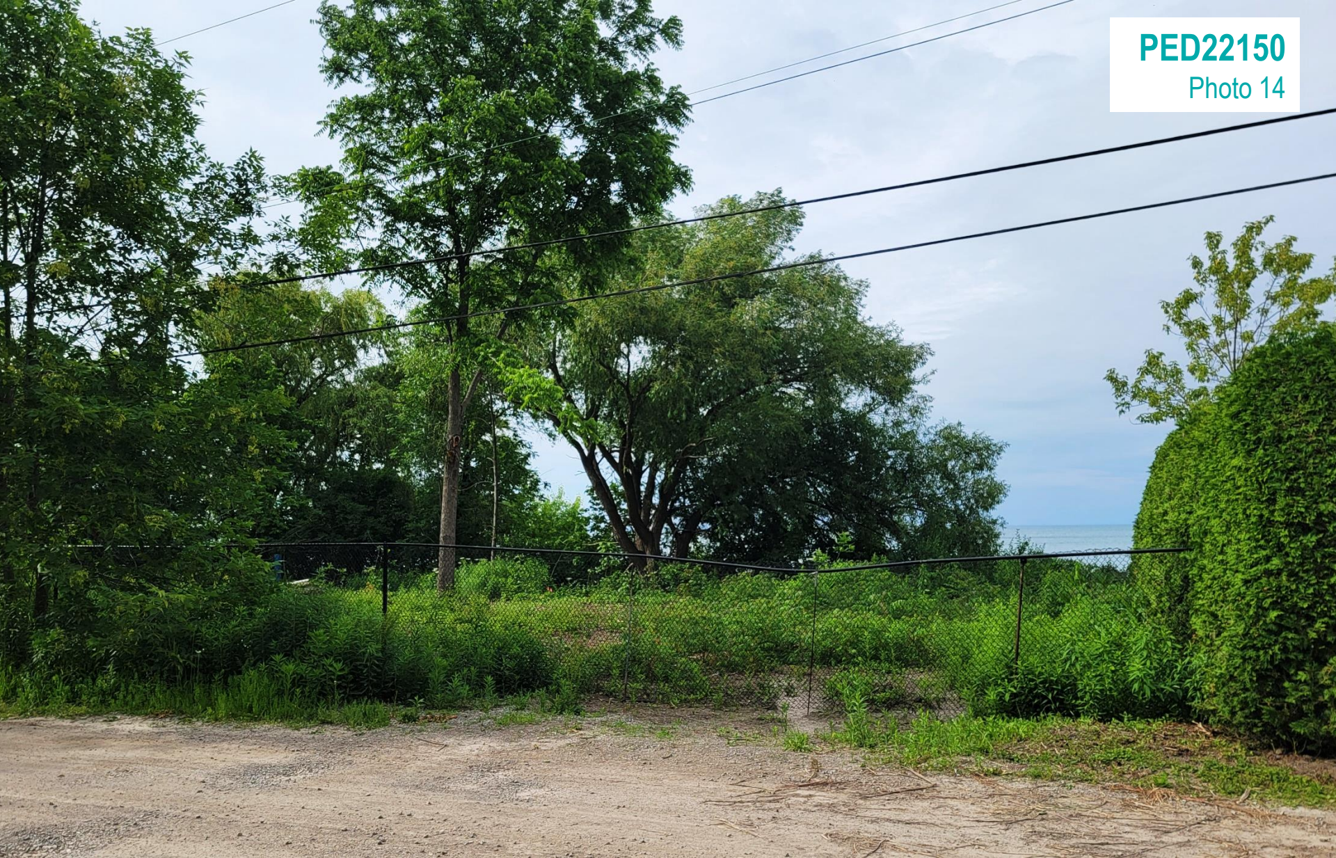
Location of Future Linkage Block on Block 51