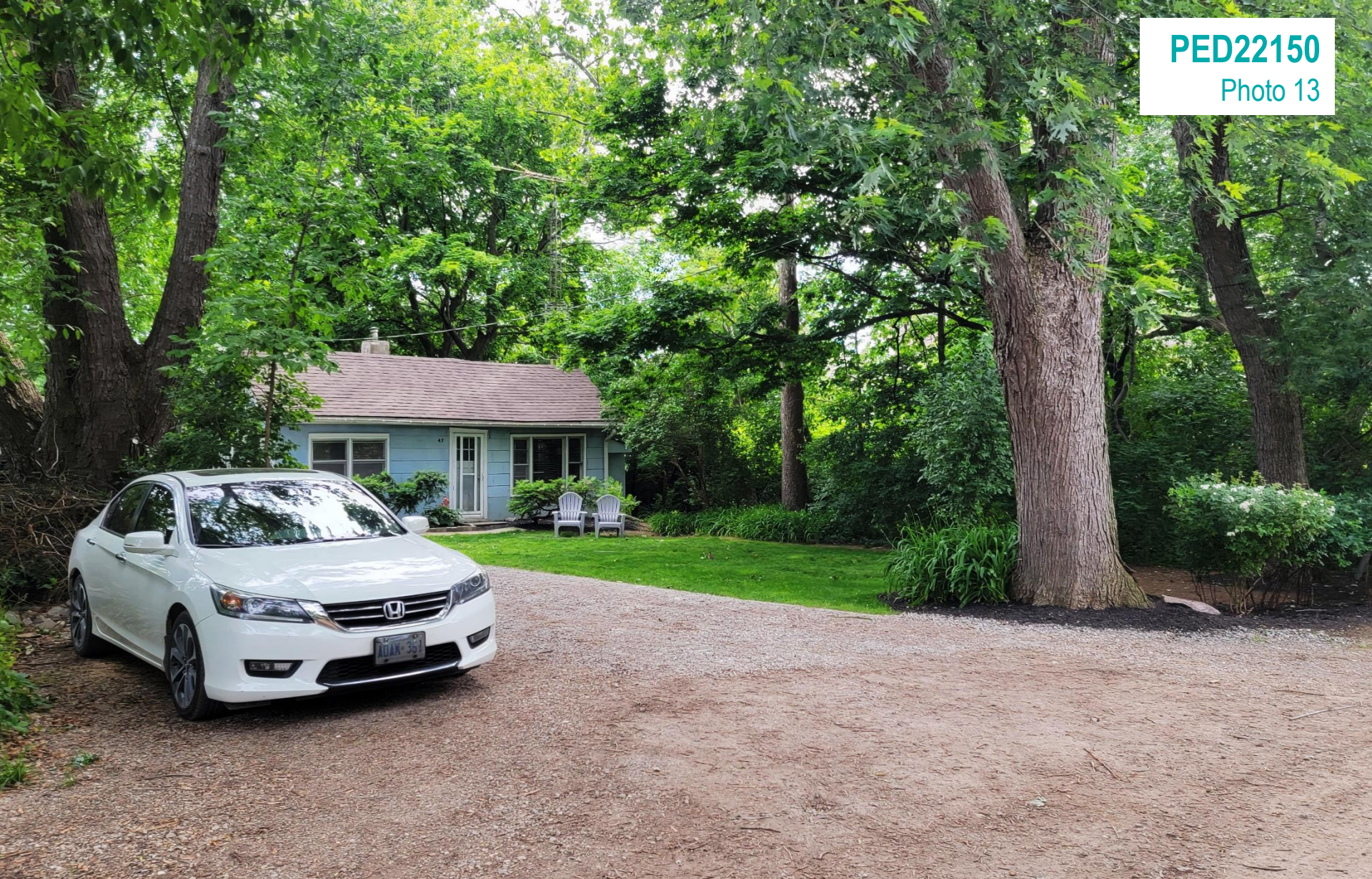
Existing development to west on lands at 47 Lakeside Drive