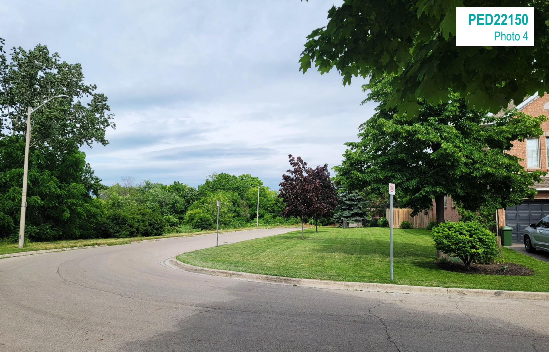
Cove Crescent temporary east-west connector road