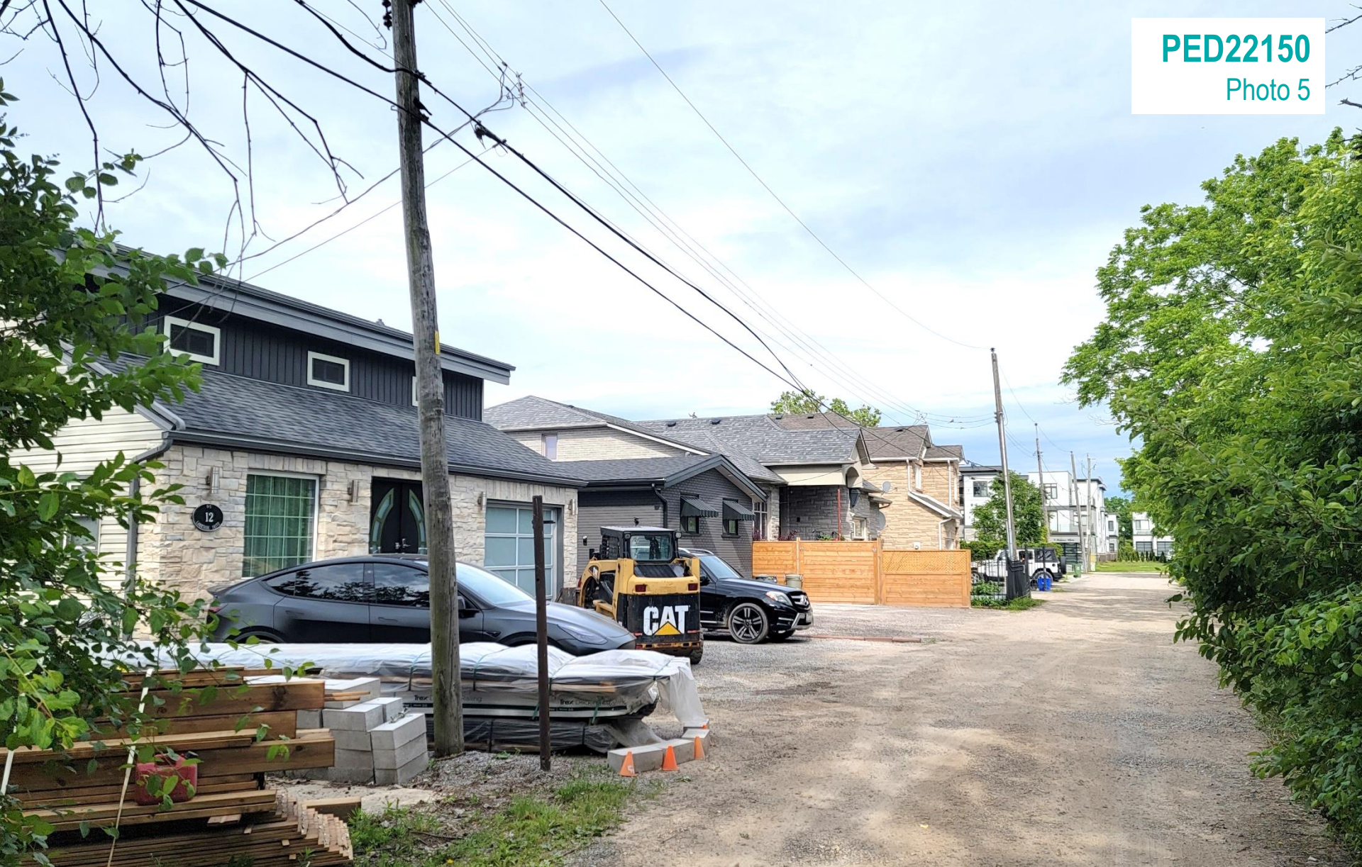
View along Lakeside Drive to east from subject lands