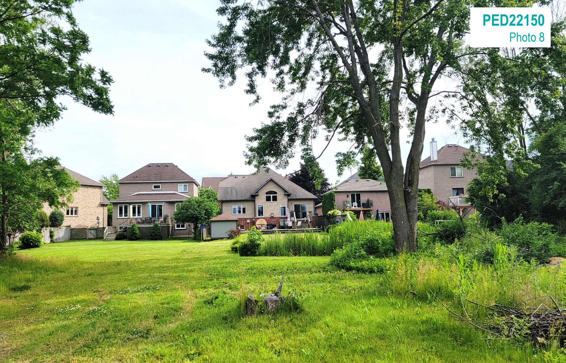
Back of lots along Waterford Crescent from Lakeside Drive