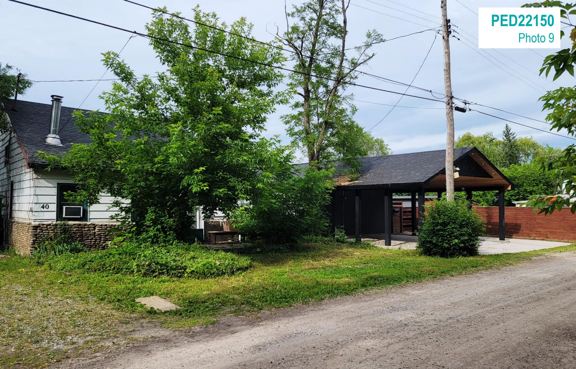
Example of existing built form along north side of Lakeside Drive