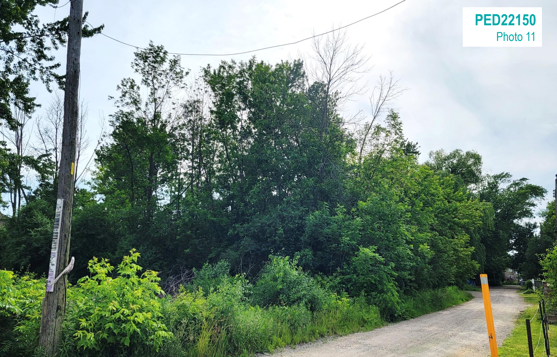
Existing western Linkage within Subject Lands