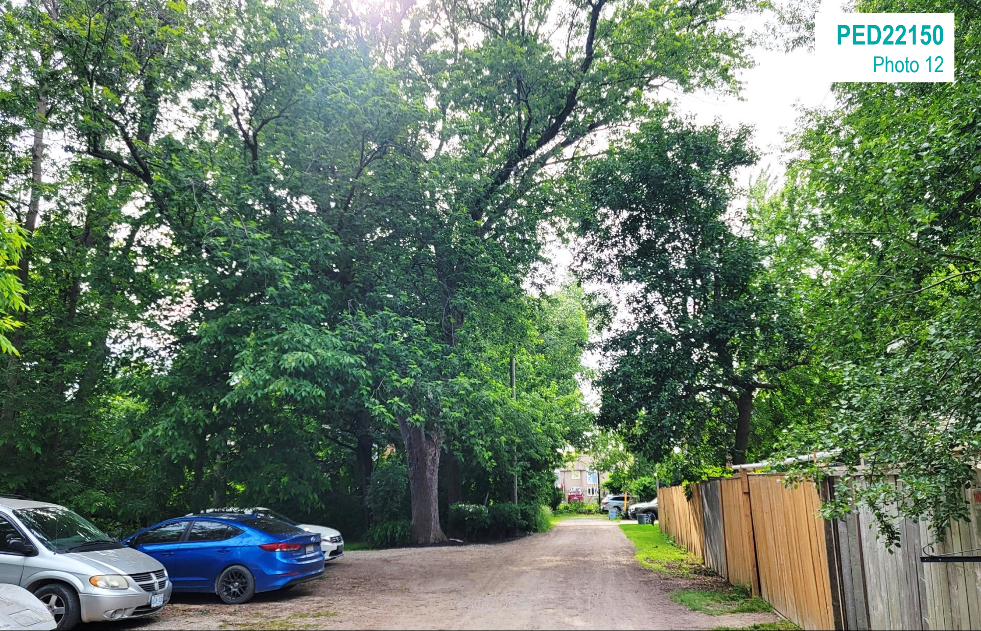
Existing western Linkage remaining on adjacent lands