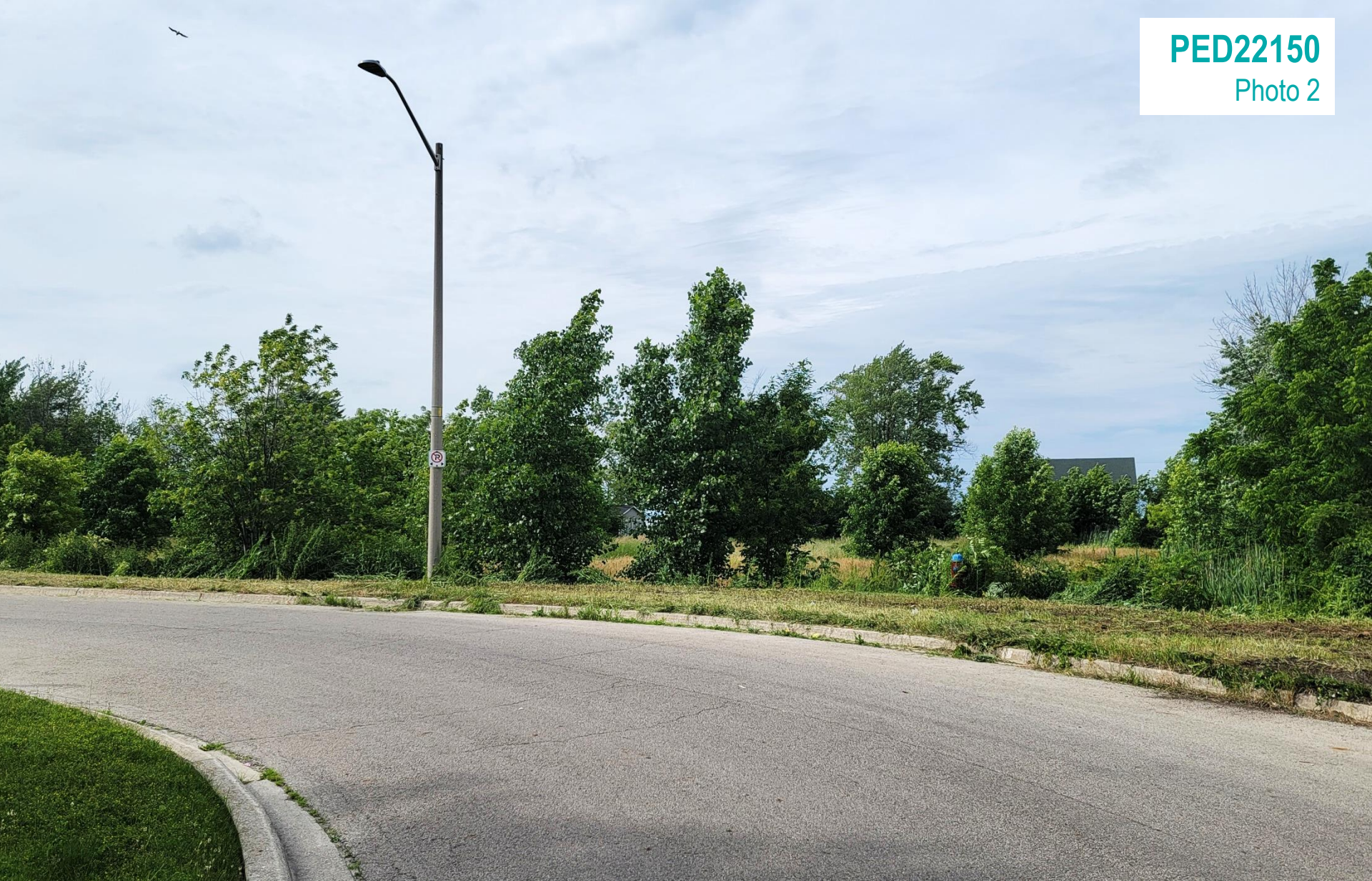
View of Subject Lands from Cove Crescent (east side)