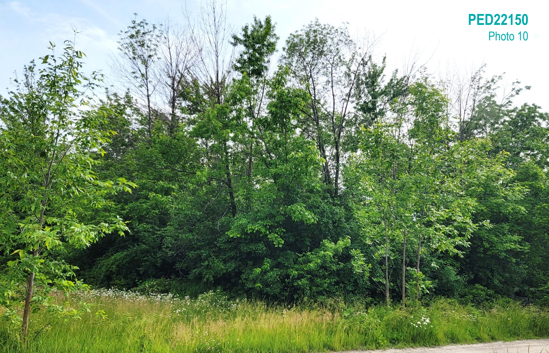
Existing eastern Linkage within Subject Lands