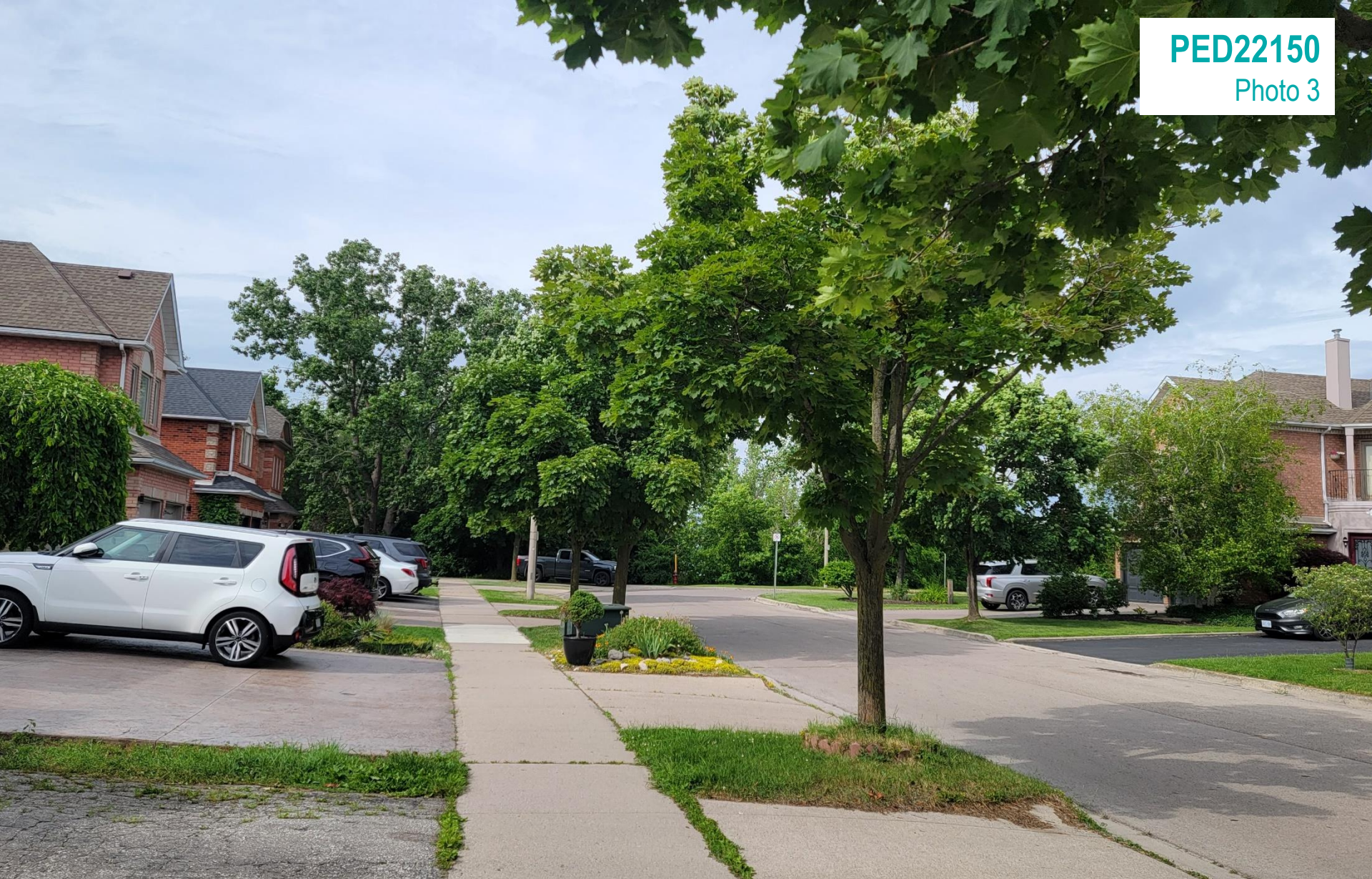
View of Subject Lands from Cove Crescent (west side)