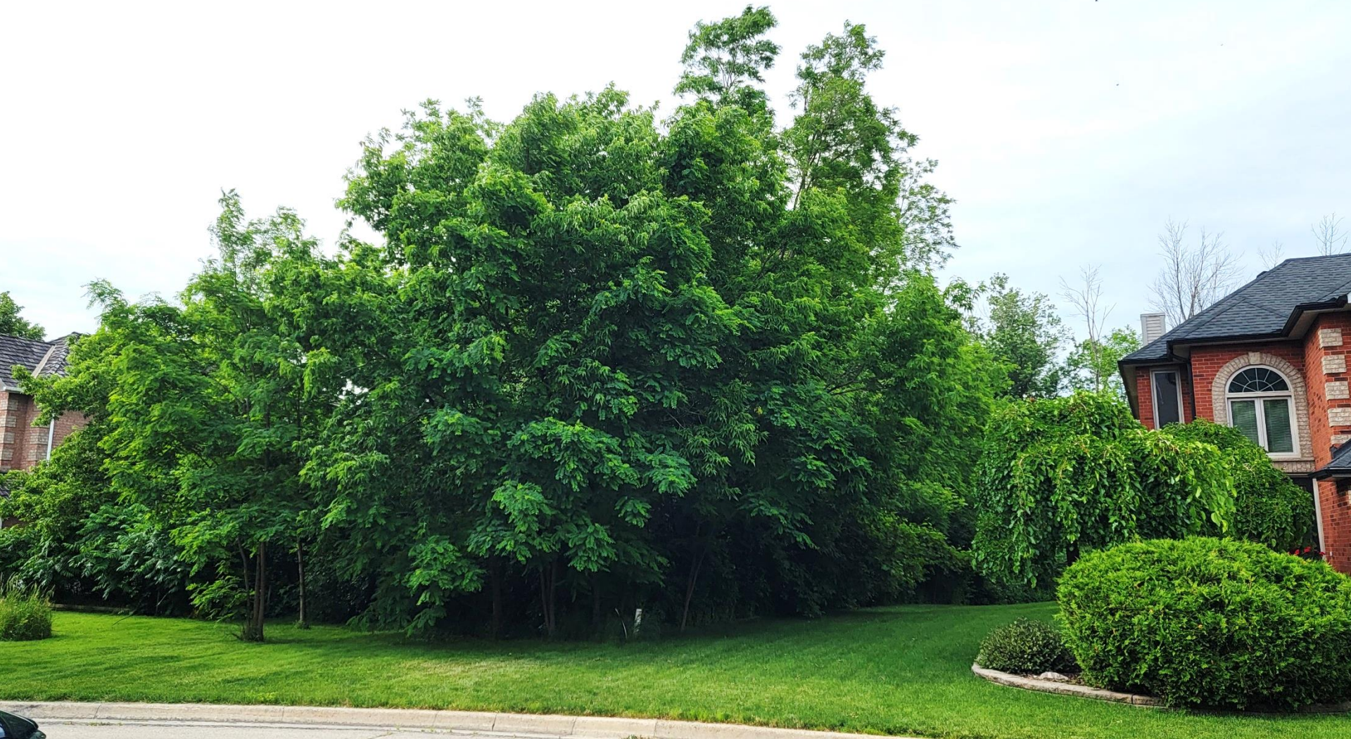
View of Lot 4 located at 81 Waterford Crescent