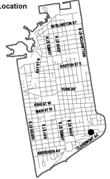
Key Map - Ward 2