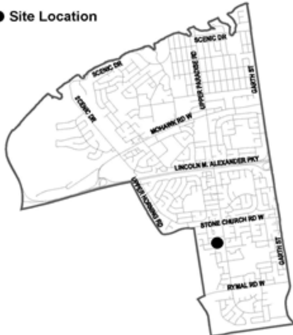
Key Map - Ward 14