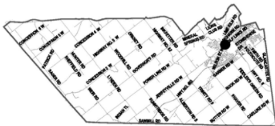
Key Map - Ward 12