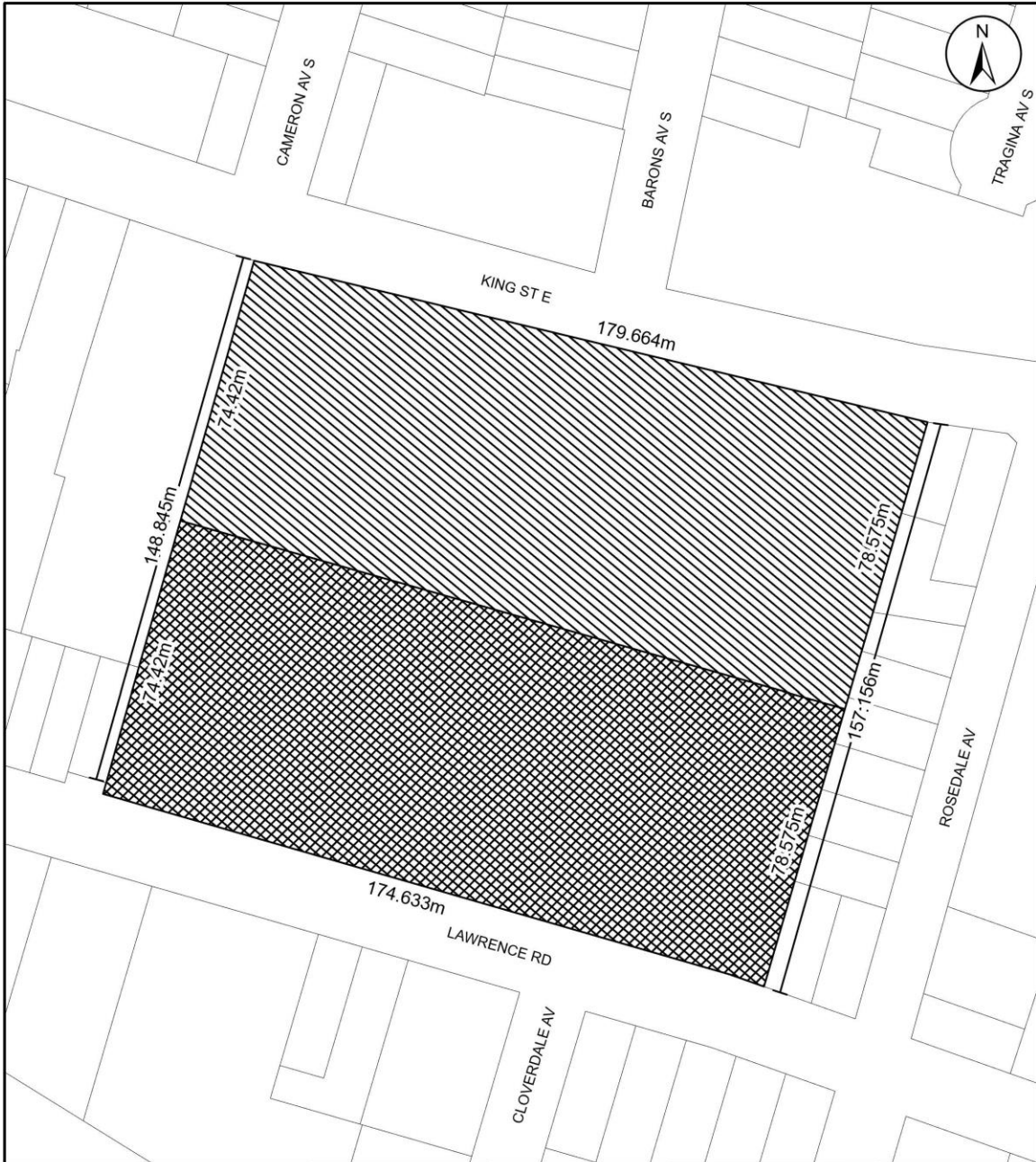
Special Figure 31: Maximum Building Setbacks for 1842 King Street East