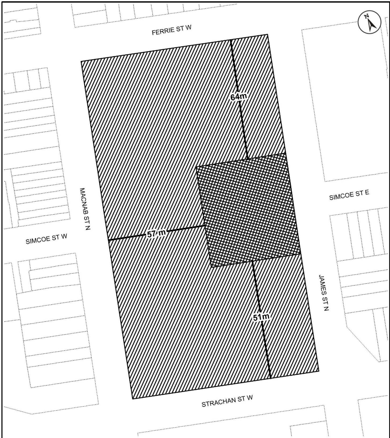
Special Figure 29: 405 James Street North