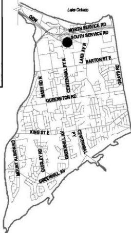
Key Map - Ward 5